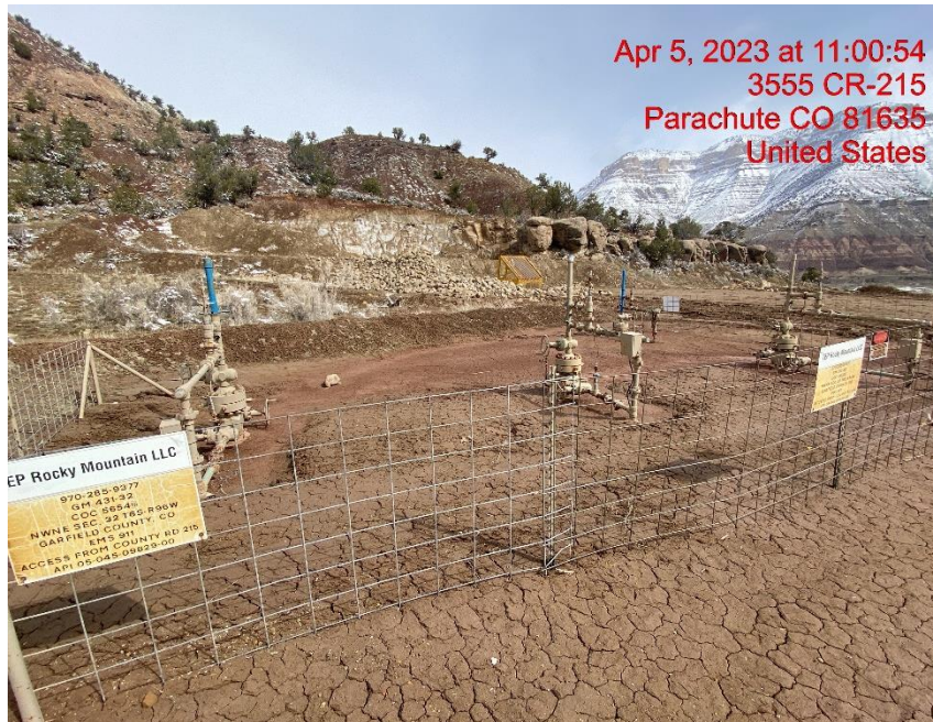
Wellheads – Photo #01937