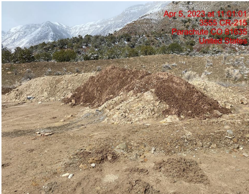
Degradation/Sediment Migration – Photo #01938