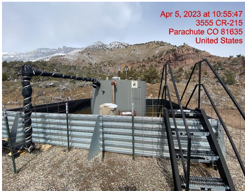
Tank Battery – Photo #01934