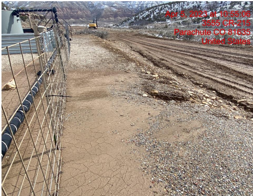
Erosion/Sediment Migrating Off Location – Photo #01931