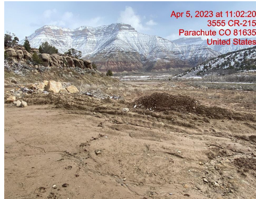
Degradation/Sediment Migration – Photo #01942