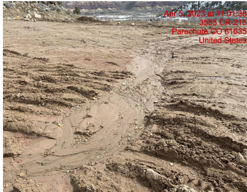
Lack of Stabilization/Sediment Migration – Photo #01940