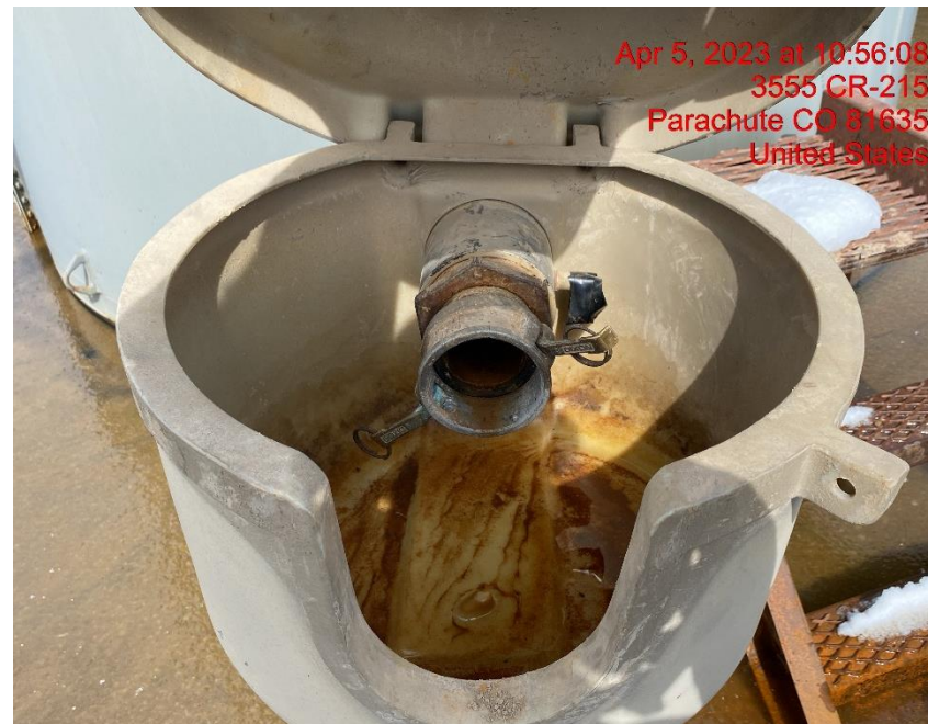
Open-Ended Line – Photo #01936