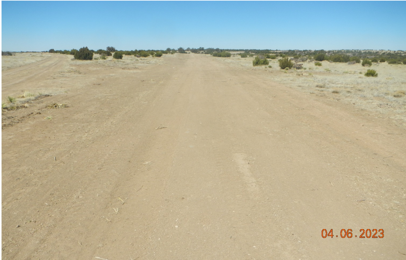
Photo 2. Facing north at the flowline disturbance. The piles of trees were removed as well as other supplies and equipment. All disturbed soils will need to be decompacted, seeded, and stabilized.