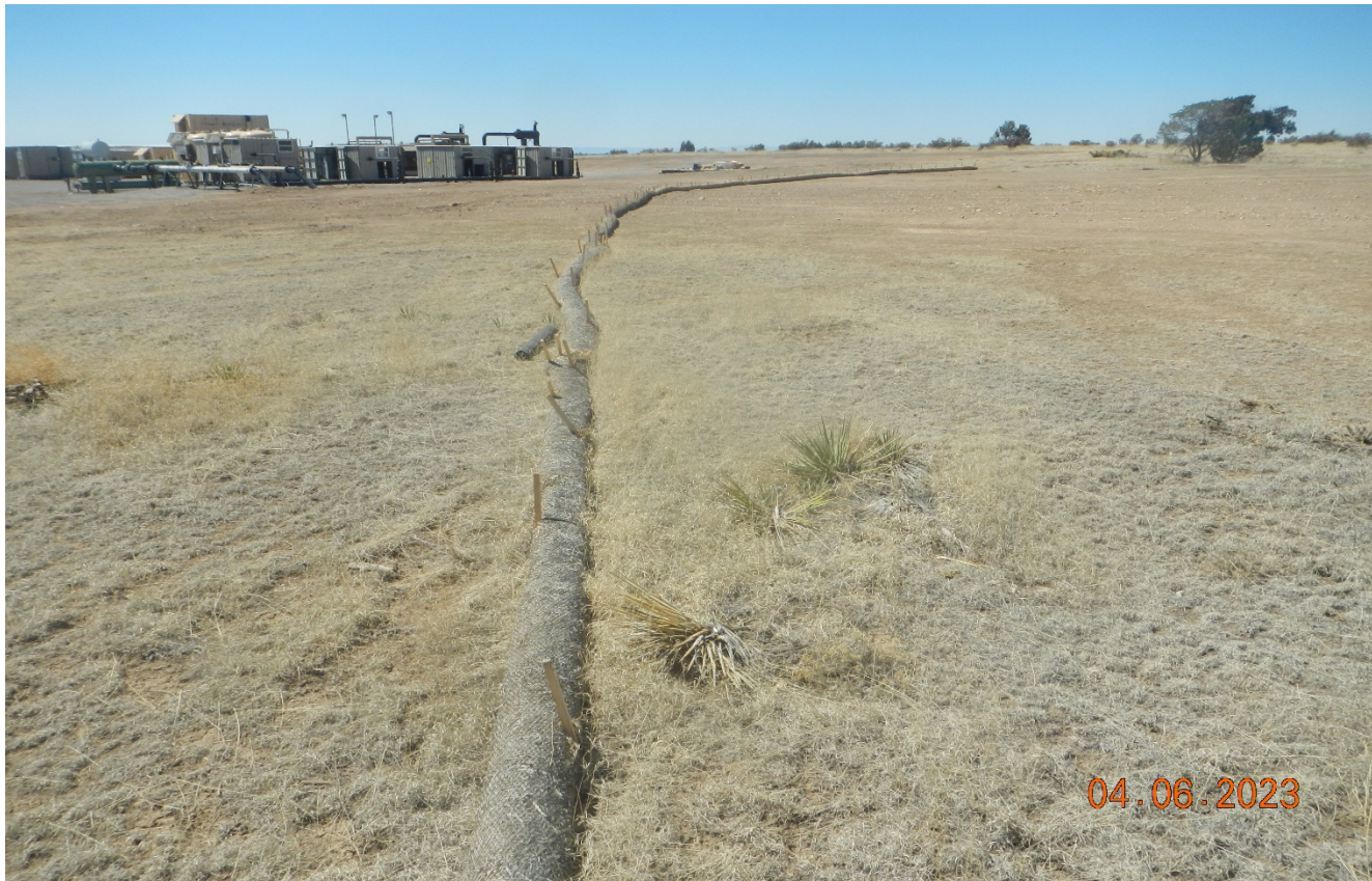
Photo 5. Facing southwest toward the perimeter wattles and in the left is the processing plant.