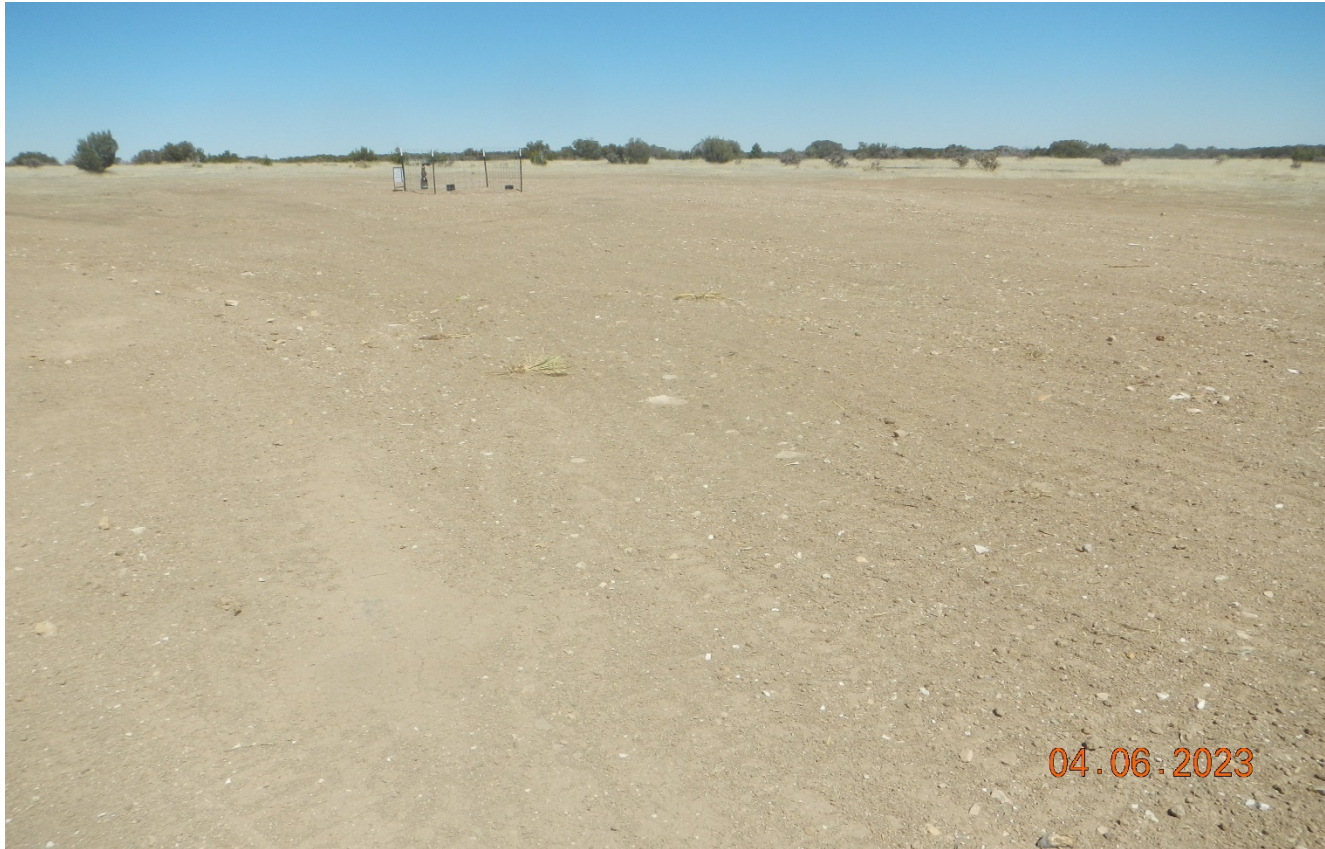
Photo 6. Facing north at the location. All disturbed soils will need to be decompacted, seeded, and stabilized.