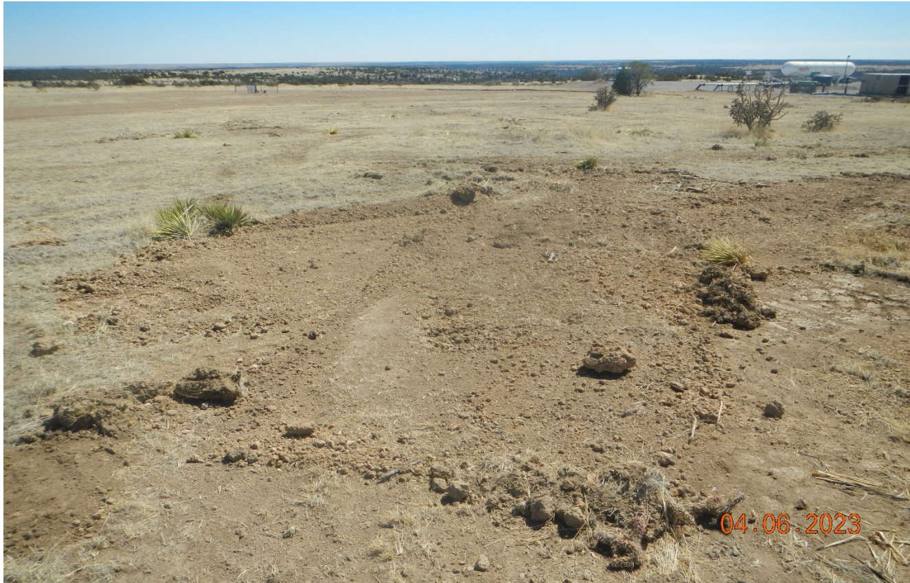
Photo 7. All other areas of disturbance outside of the location will also need to be seeded and stabilized.