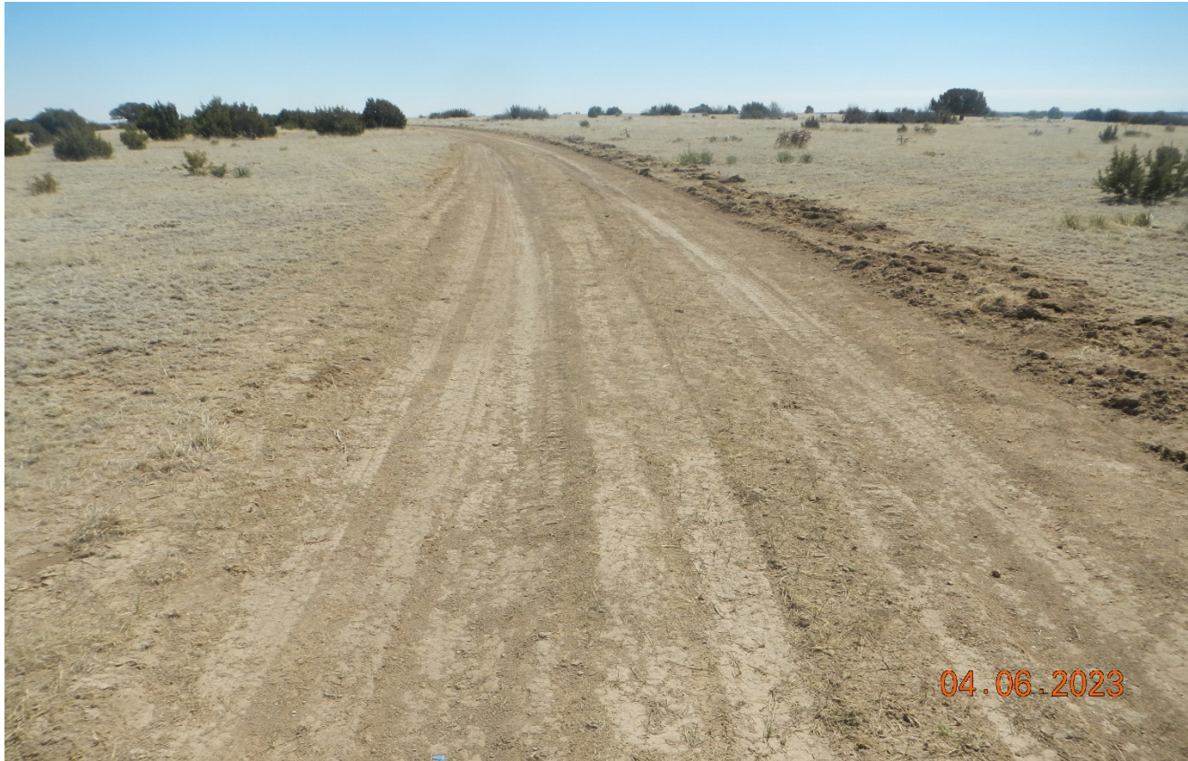
Photo 1. Facing southeast along the access road. The access road is not stabilized and soil is being pushed off the road. Soils should be segregated off the road before stabilizing the road with road base.