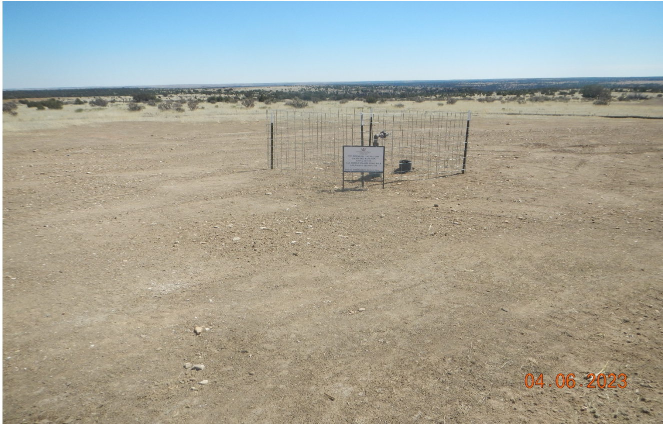
Photo 3. Facing southeast toward the wellsite. Fence was installed around wellhead with a sign.