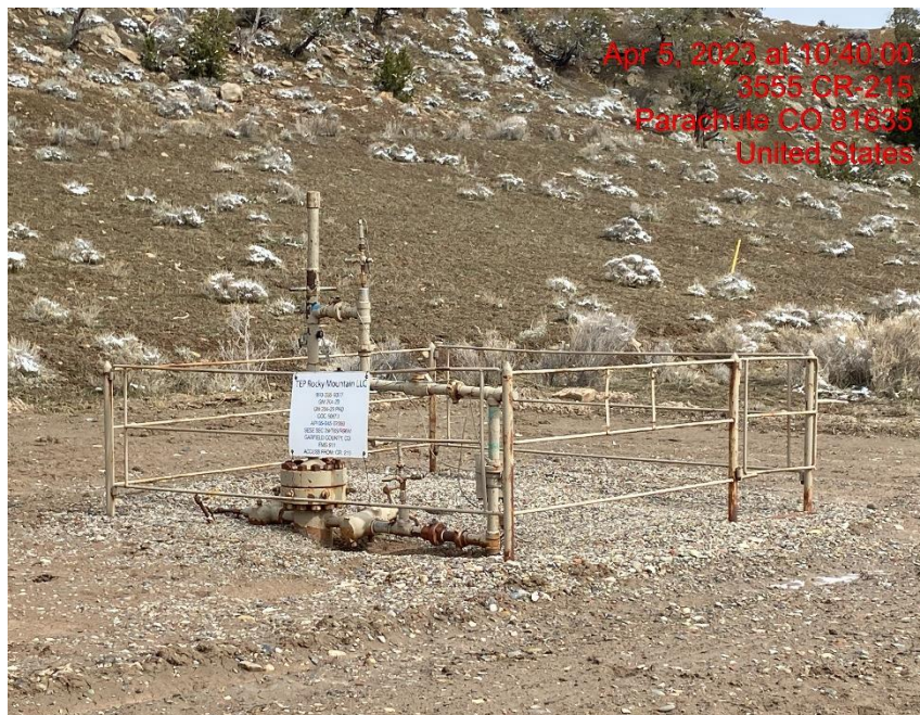
Wellhead – Photo #01917