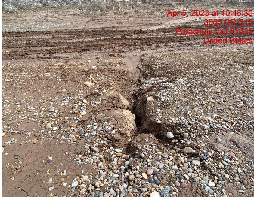
Erosion/Sediment Migration/Lack of Stabilization – Photo #01926