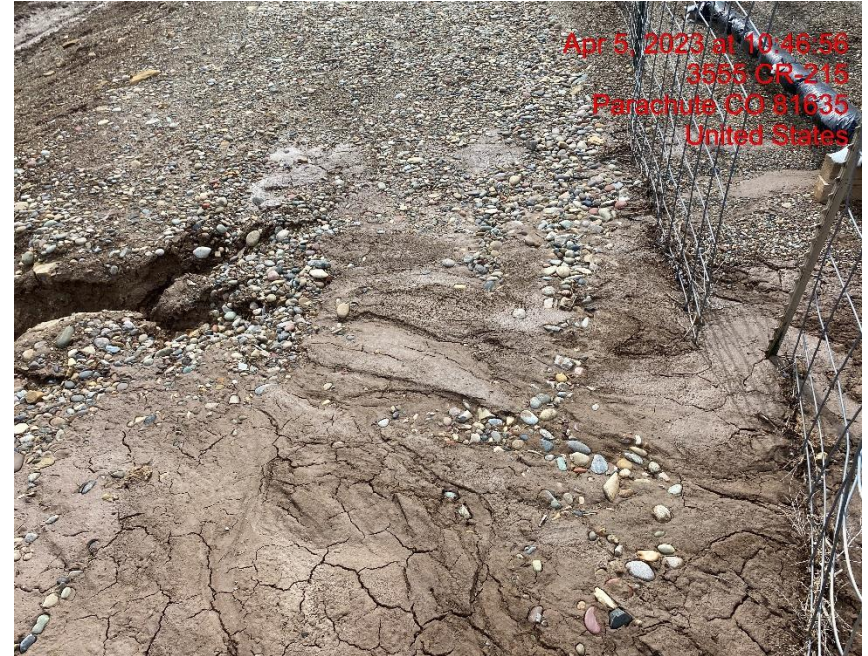
Erosion/Sediment Migration – Photo #01923