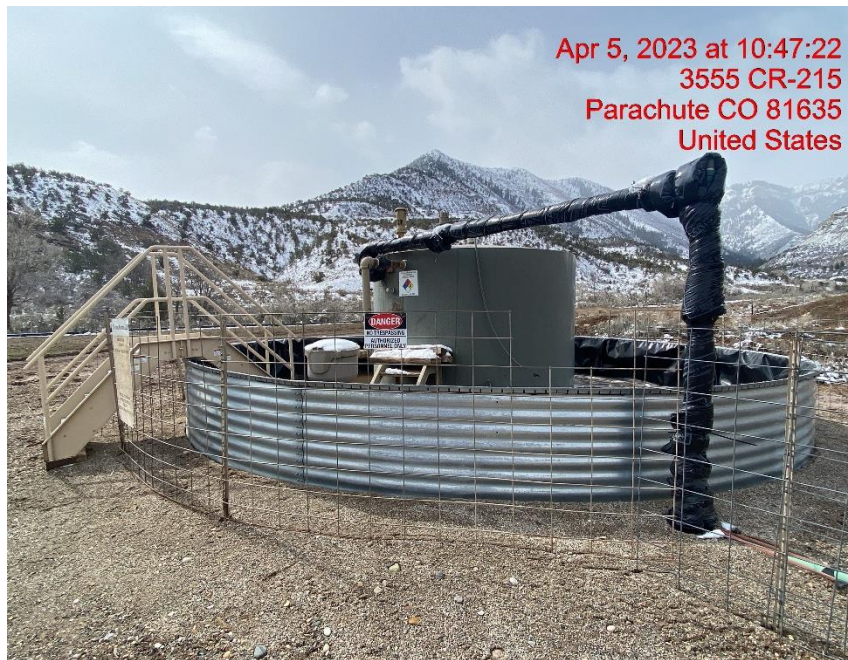
Tank Battery – Photo #01924