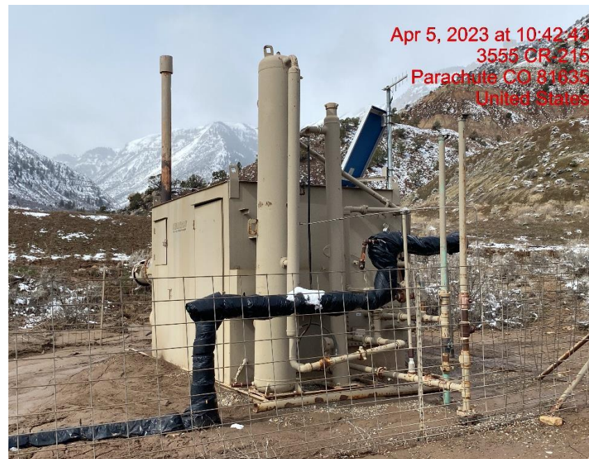
Separator – Photo #01919