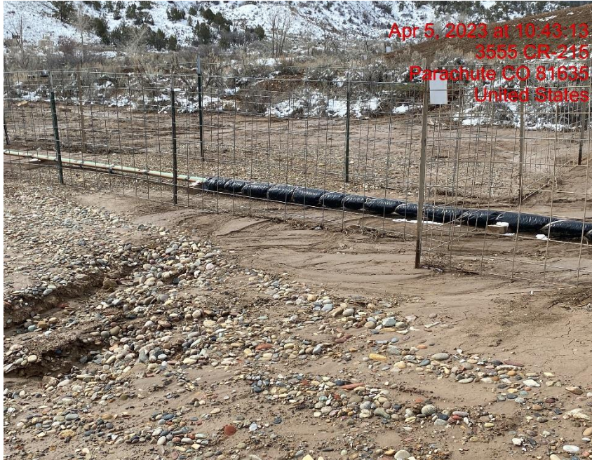
Erosion/Sediment Migration – Photo #01921