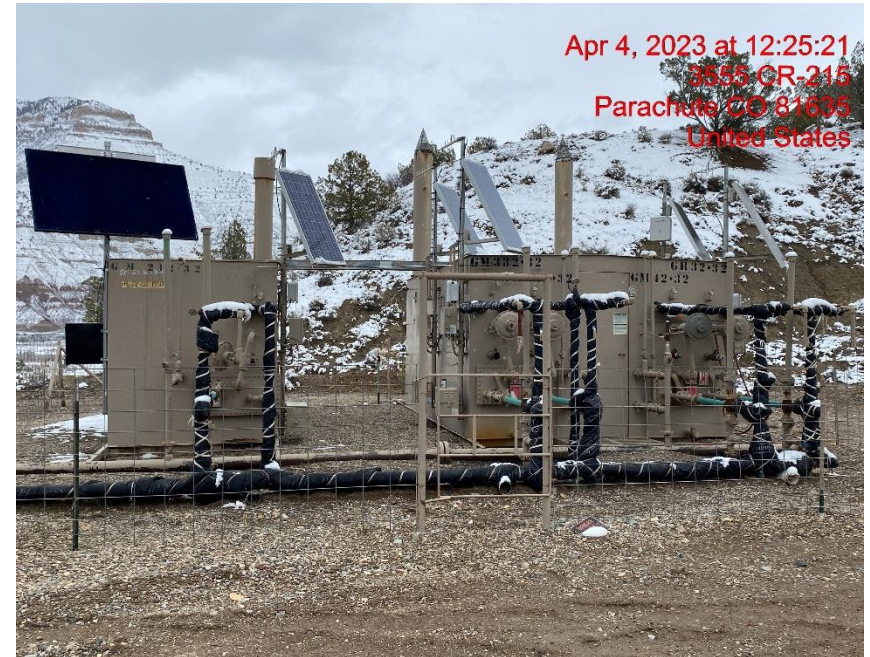
Separators – Photo #01907