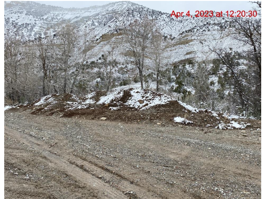
Lease Road Degradation/Sediment Transport – Photo #01904