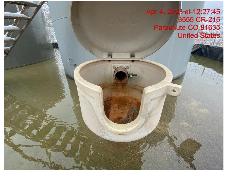
Open-Ended Line – Photo #01911