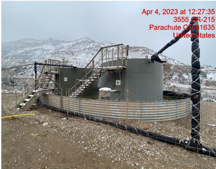
Tank Battery – Photo #01910