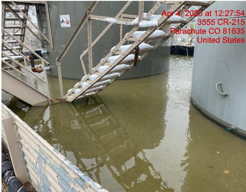
Inadequate Secondary Containment Capacity – Photo #01912