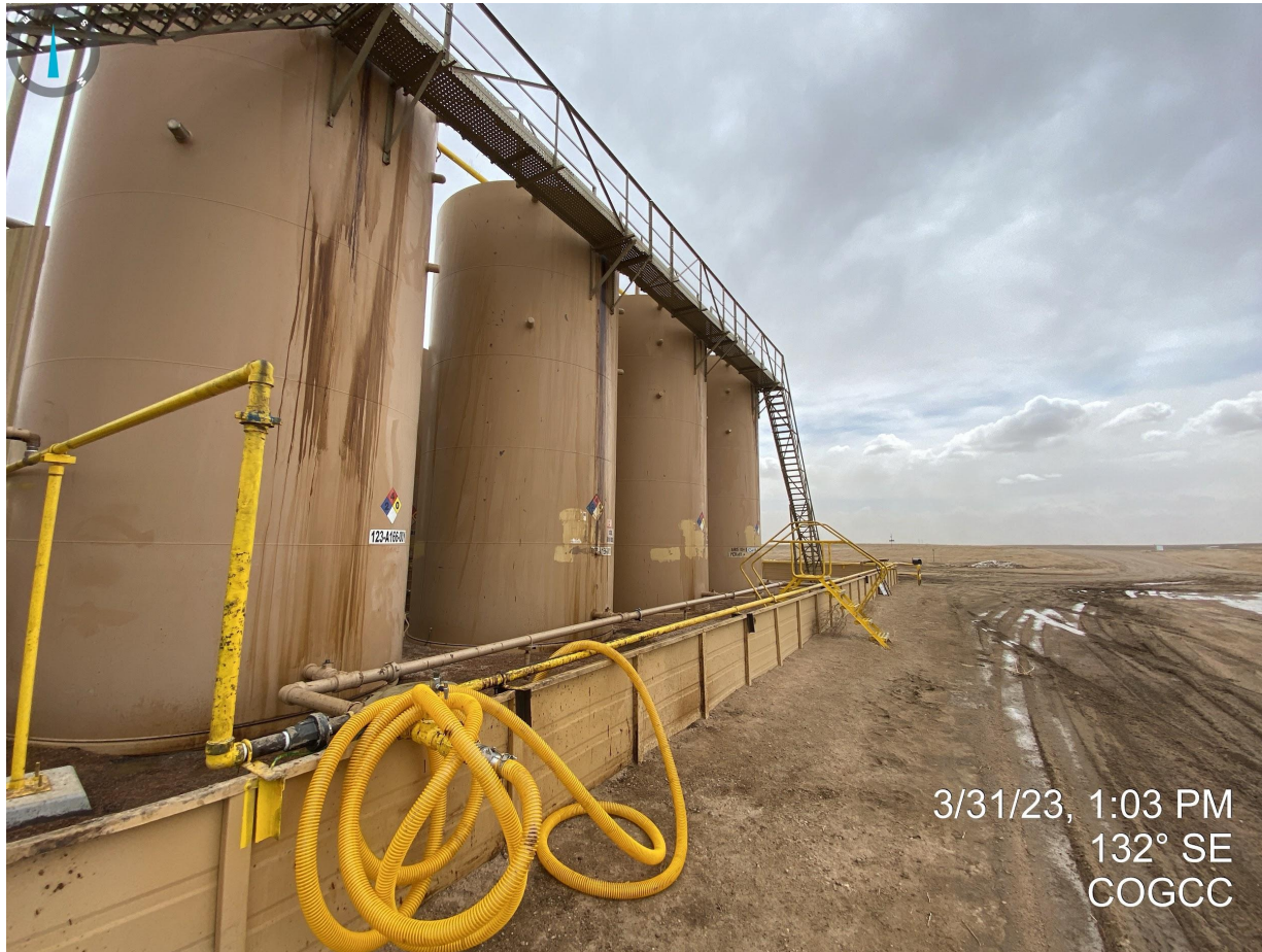
Photo 19. Overview of spill at tanks.