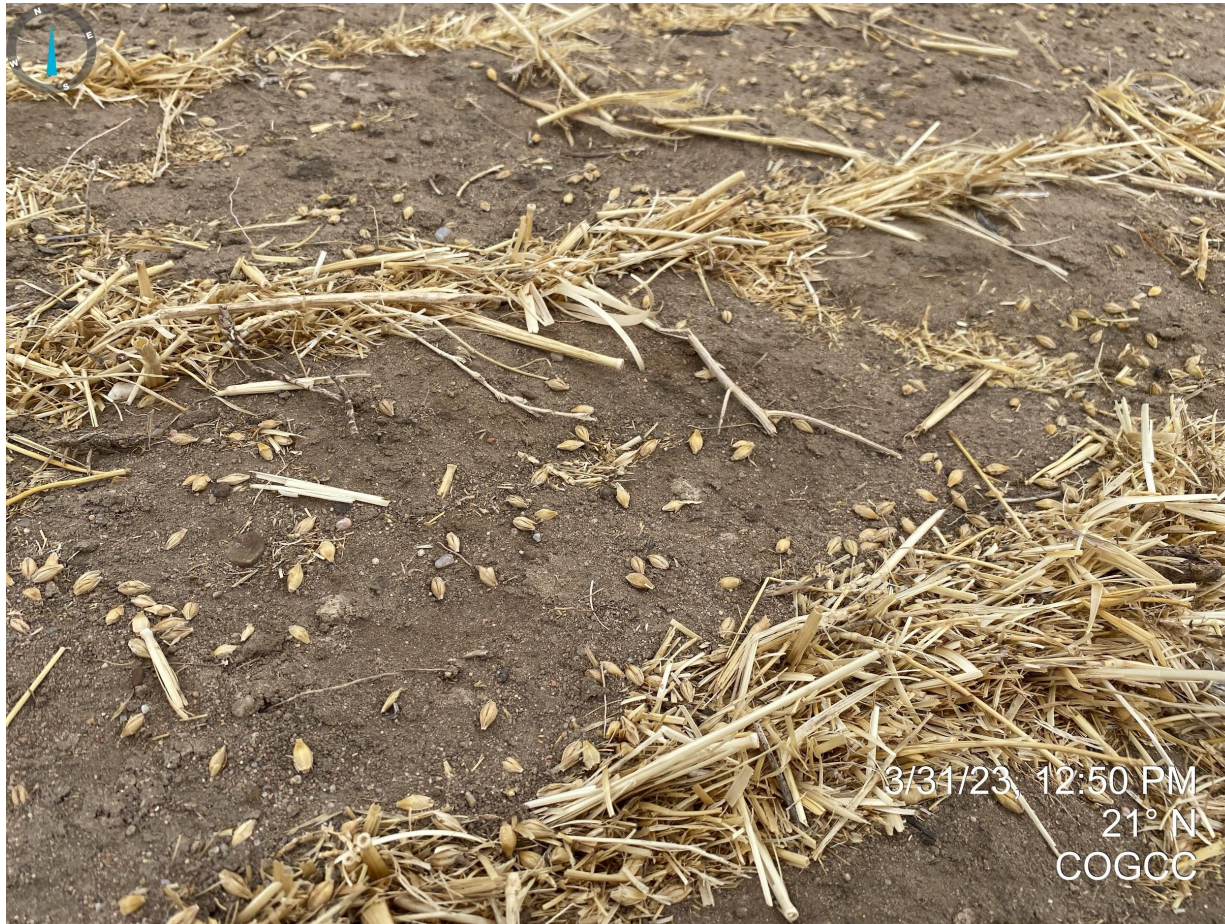
Photo 2. Close up photo of topsoil. It appears the Operator may have broadcasted the seed. A future inspection will be conducted to verify germination and establishment of vegetation.