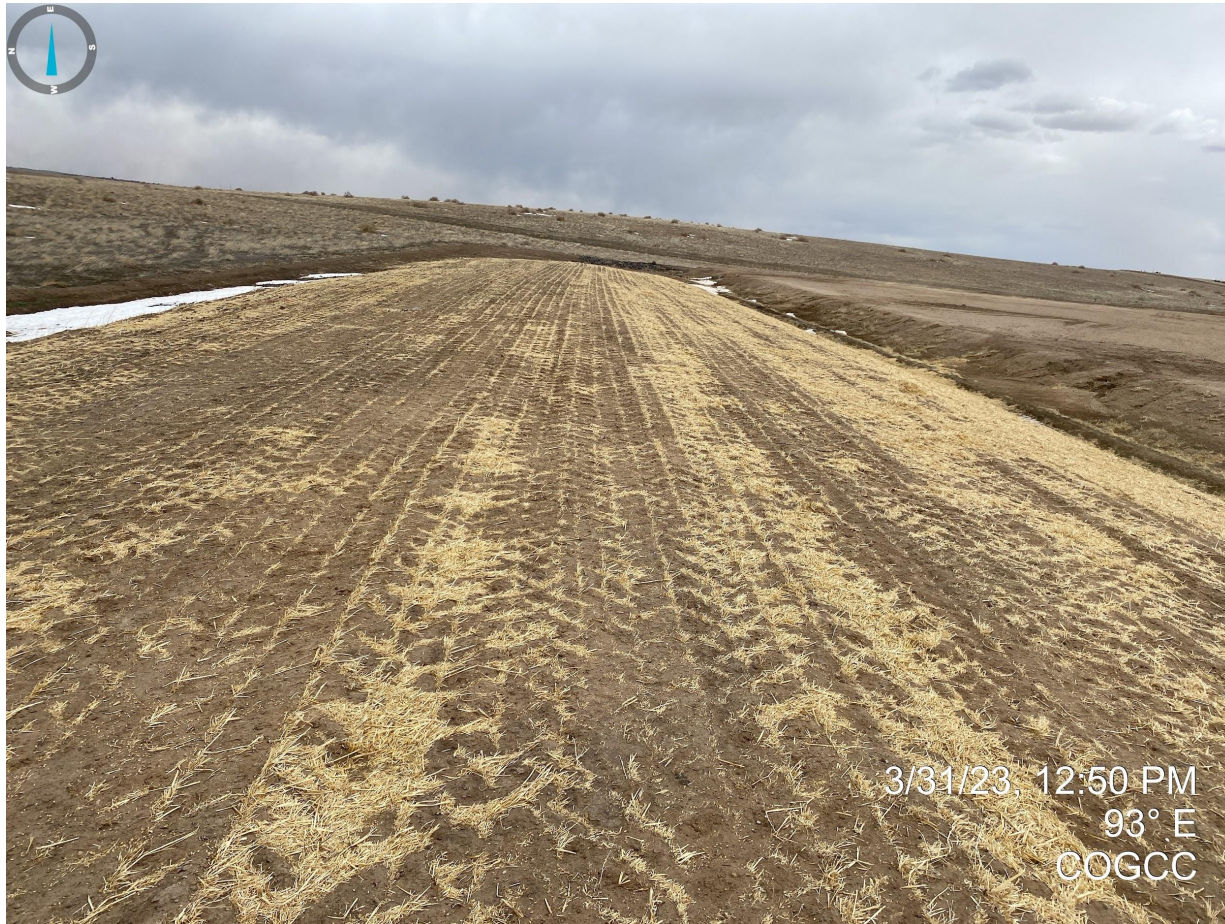
Photo 1. Facing east from the topsoil stockpile. It appears the Operator has performed work to stabilize the topsoil with evidence of drill rows and mulch.