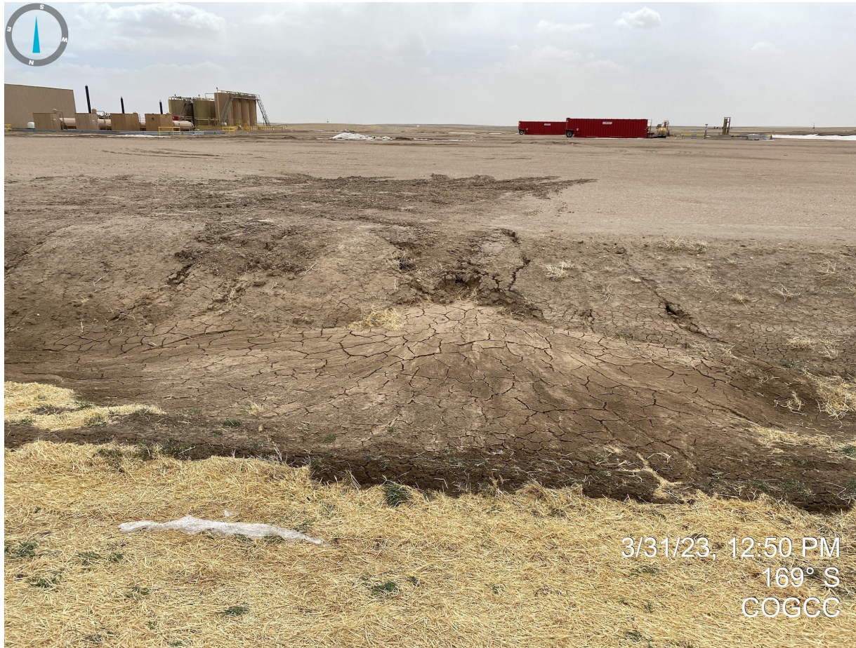
Photo 3. Facing south from the topsoil stockpile. Photo illustrates that the production areas don't appear to be stabilized as sediment has been deposited into the stormwater ditch. The BMP will need to be repaired and stabilized to prevent further erosion from occurring.