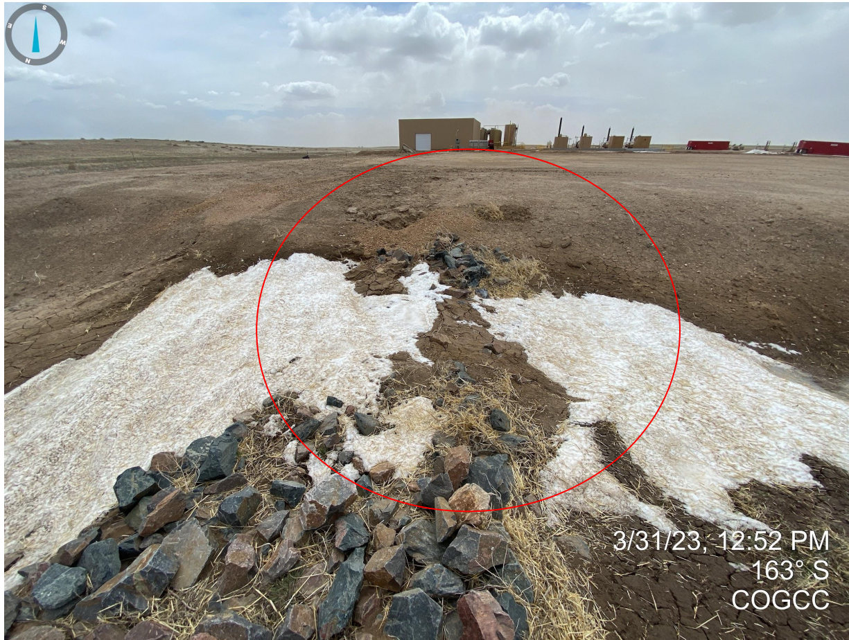
Photo 7. Facing south at rip rap check dam area. Rip rap structure will require maintenance as portions were observed to be filled with sediment.