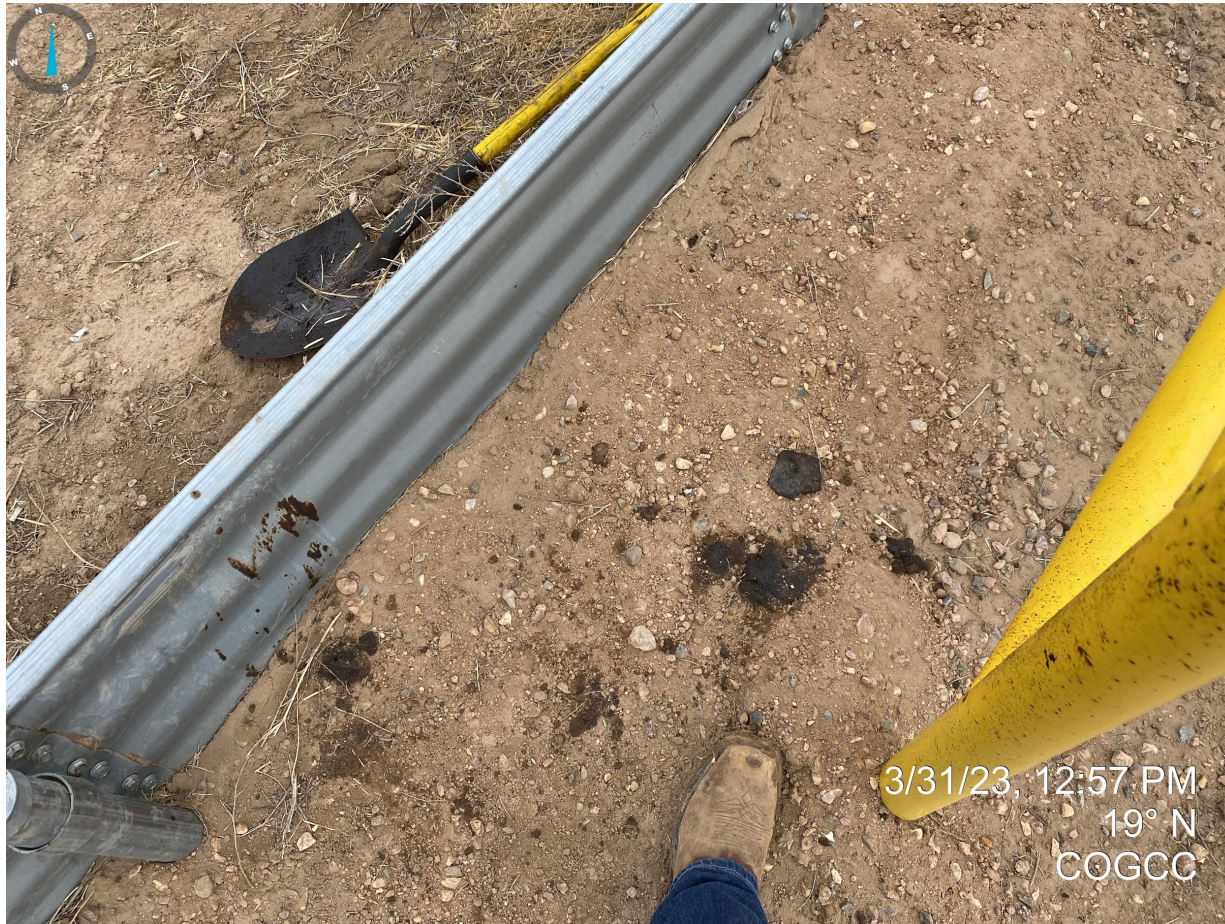
Photo 10. Oily waste observed near containment of separators that will need to be properly disposed of.