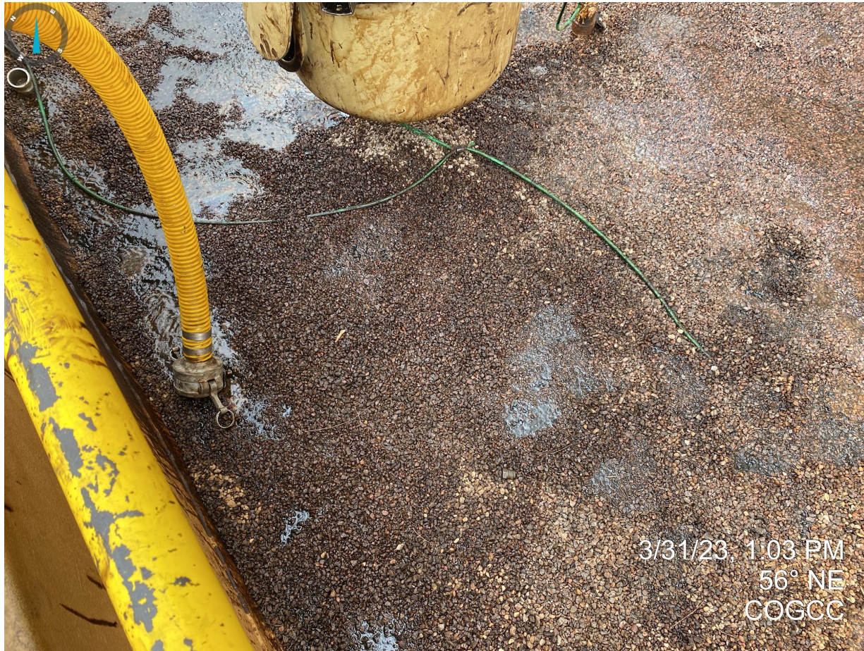
Photo 22. Close up of oily waste/stained soil within secondary containment at load out line.