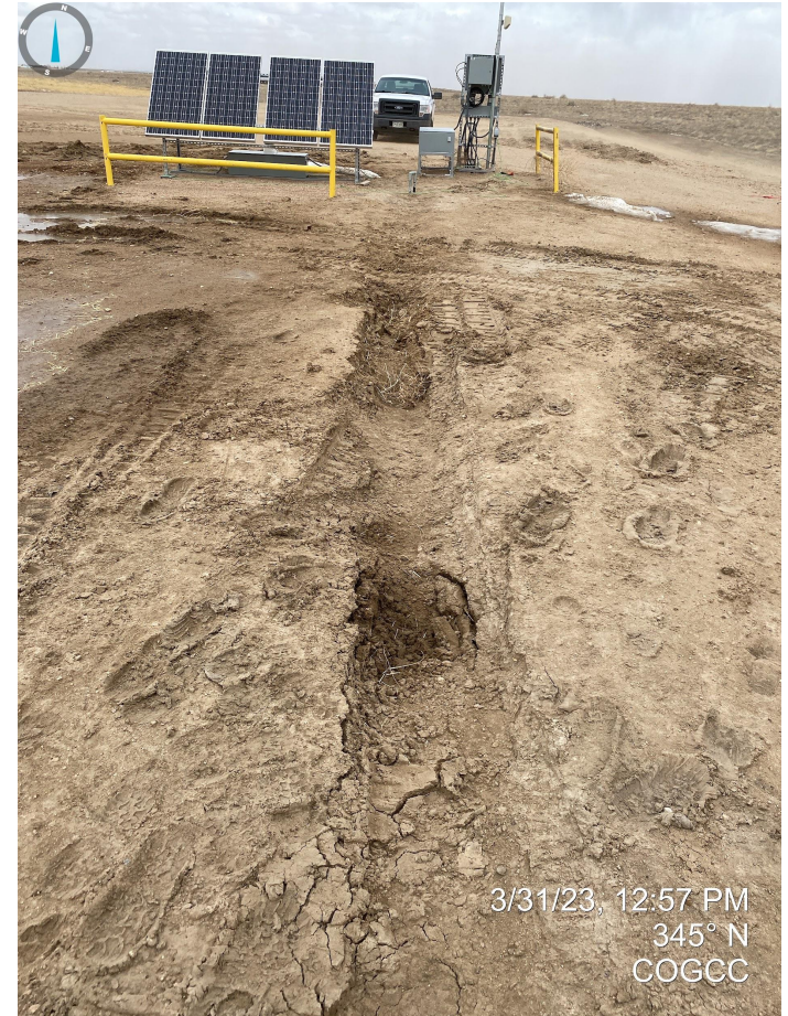
Photos 13 & 14. Subsidence on trench that will need to be backfilled or fenced to ensure safe operations for personnel and wildlife.