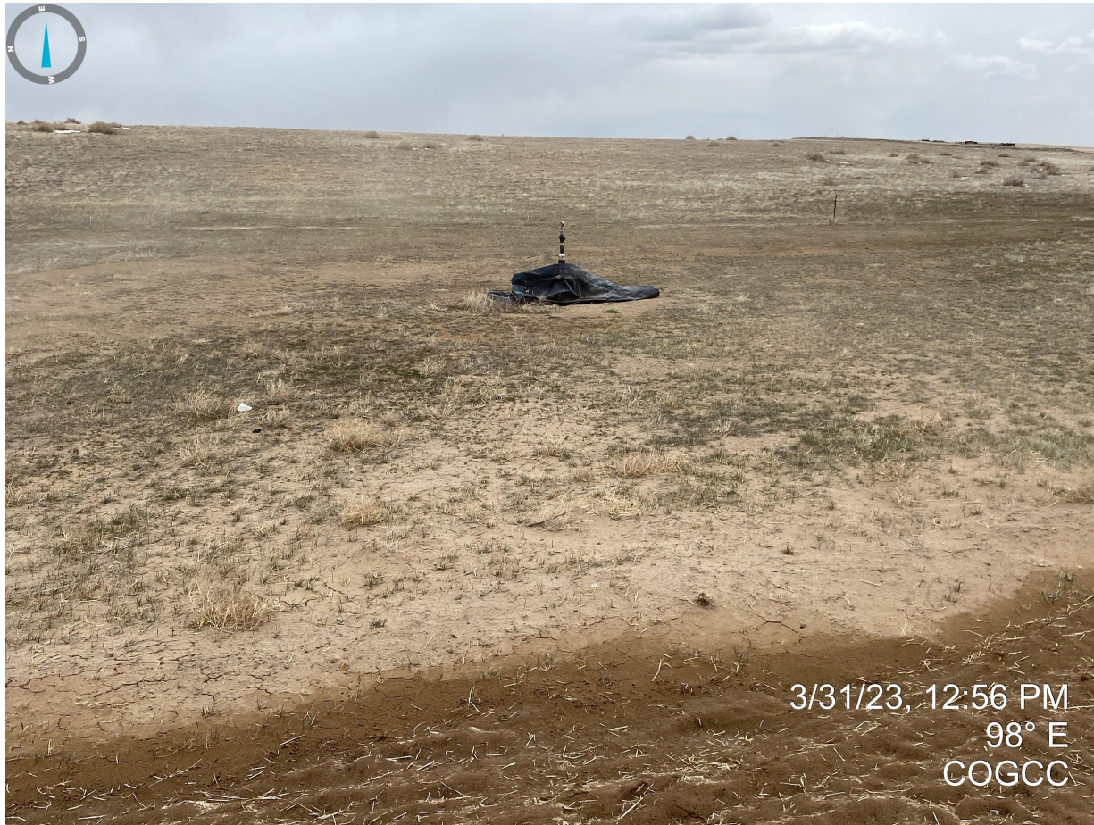
Photo 8. Facing east from the eastern portion of the location. Debris was observed to have blown off location and will need to be picked up.