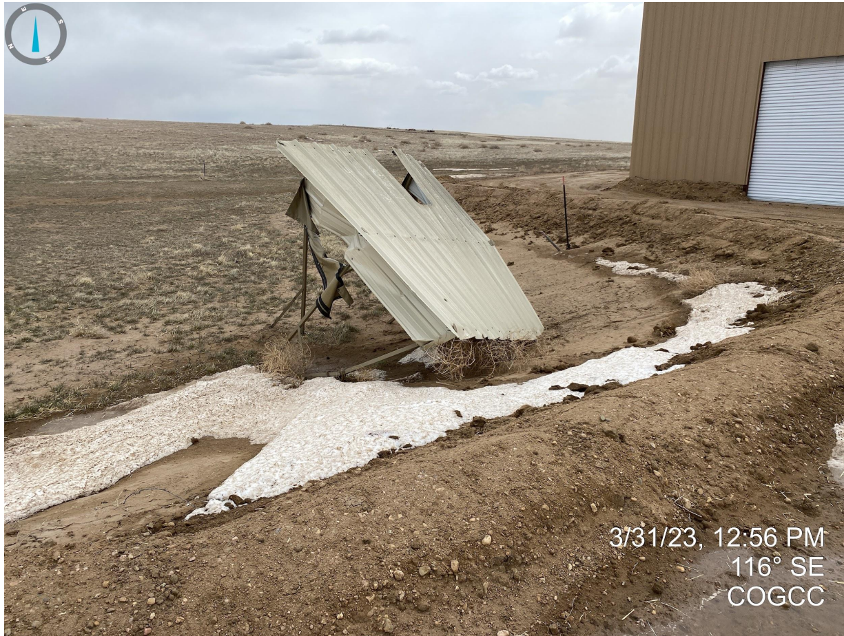
Photo 9. Debris blown off location doesn't appear to have been anchored down.