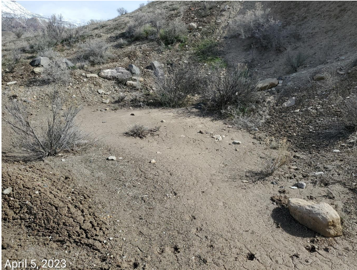
Photo 5: See comments under photo 3. Photo shows sediment deposition due to lack of stabilization at the slopes of the Location.