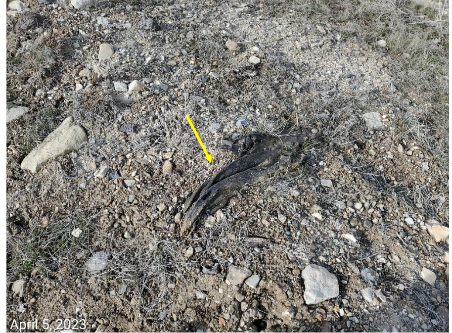
Photo 7: Photos 7-8 examples showing various trash debris (liner material, rags, etc...) observed throughout the entire interim areas on the east end of the Location. .