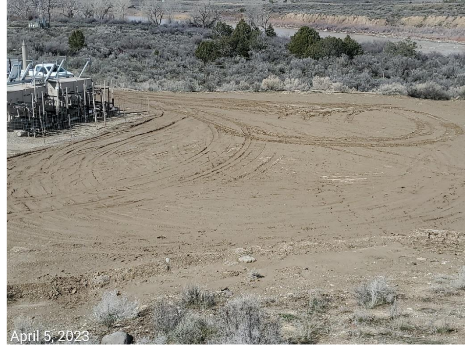
Photo 1: Photos 1-2 taken from the Location. Photos show BMPs to stabilization the Location, and to minimize erosion, degradation and off-site sediment transport remain missing or insufficient.