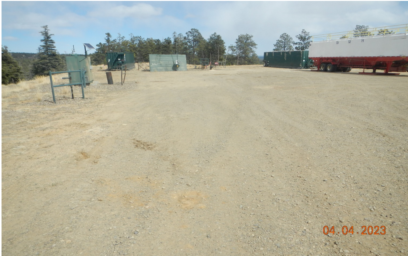
Photo 2. Facing east toward the location. There was a recent frac operation at the location.