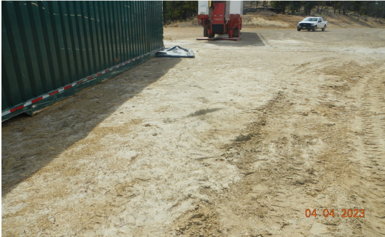
Photo 7. There is white frac sand that has now blown further across the location.