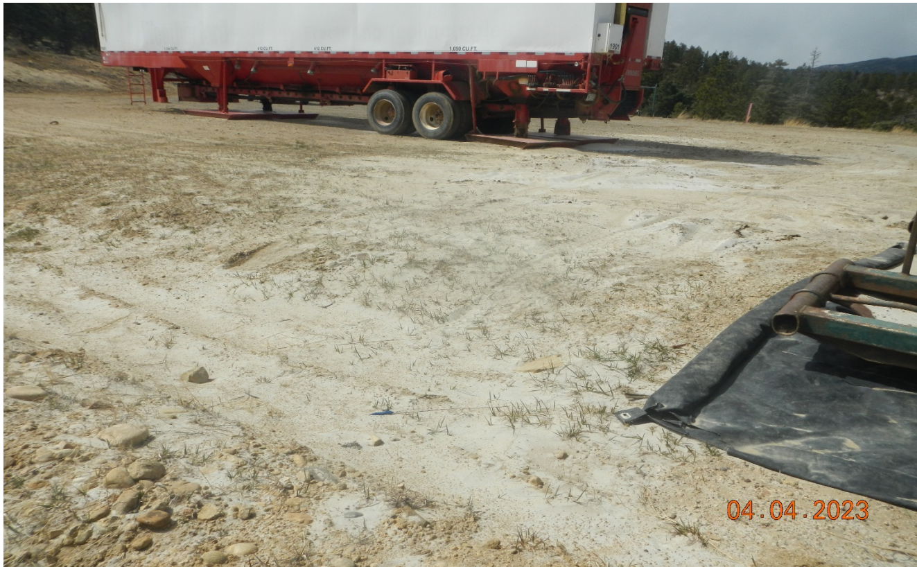
Photo 8. There is frac sand spilled out over the ground that was not properly handled and has now blown further across the location and offsite.