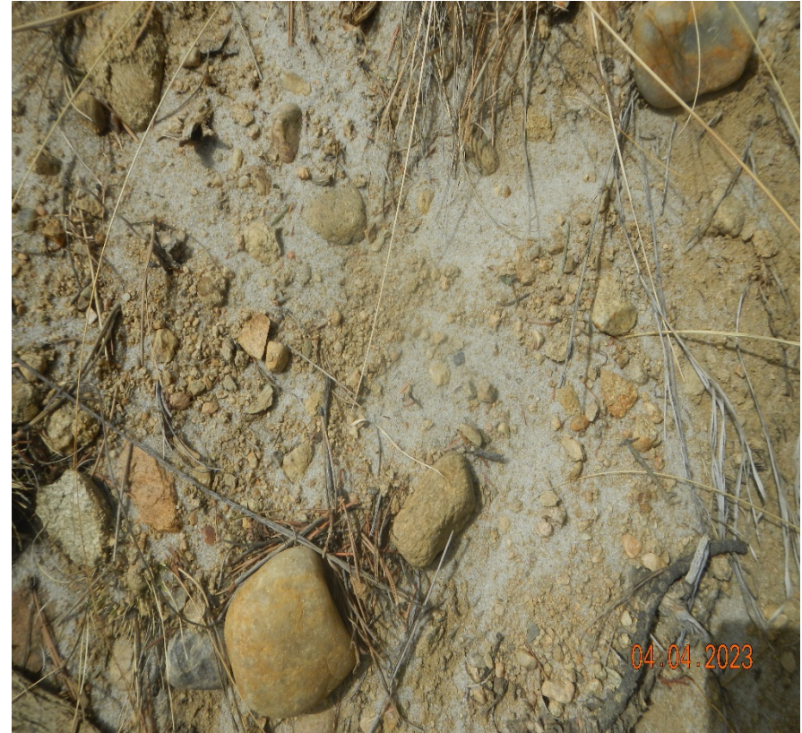
Photo 9. There is white frac sand that has blown off the south side of the location.