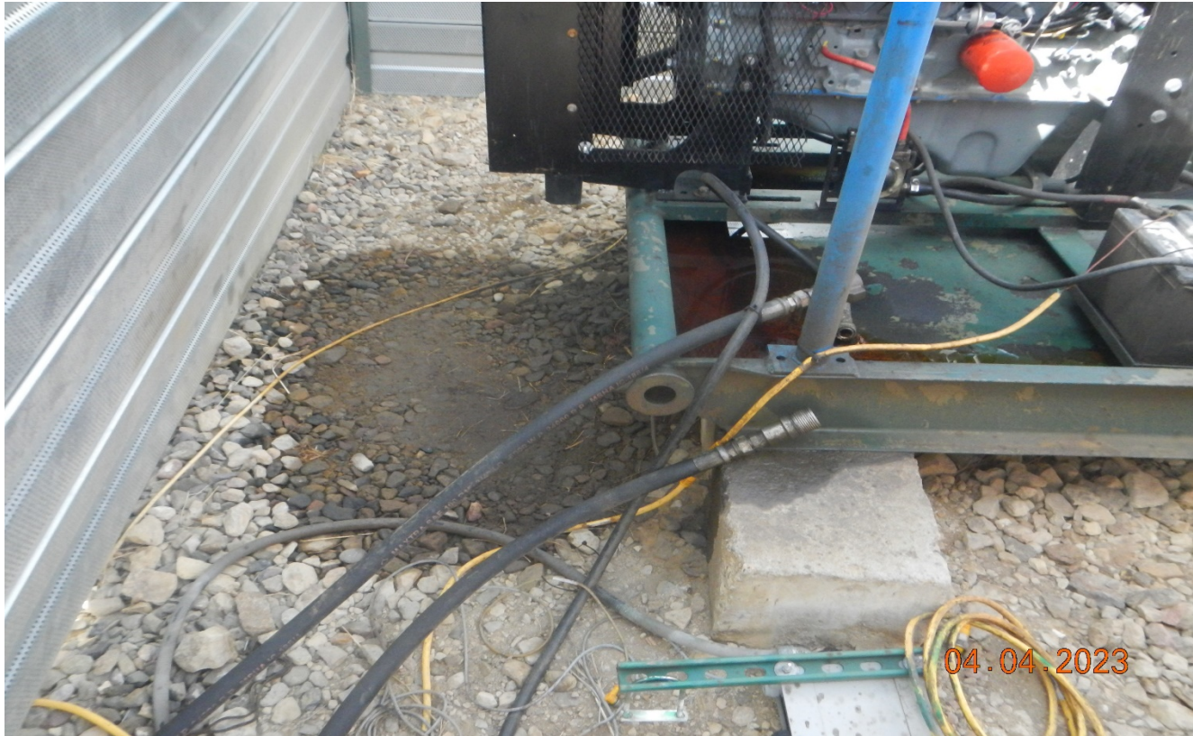
Photo 5. There is oily fluid the engine skid and spilled out onto the ground that needs to be cleaned up.