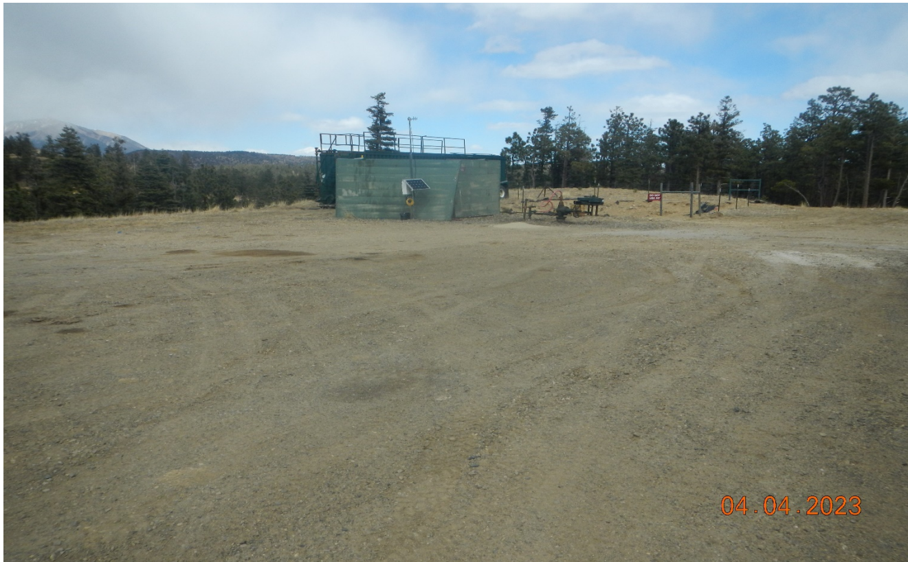
Photo 10. Facing northeast at the location.