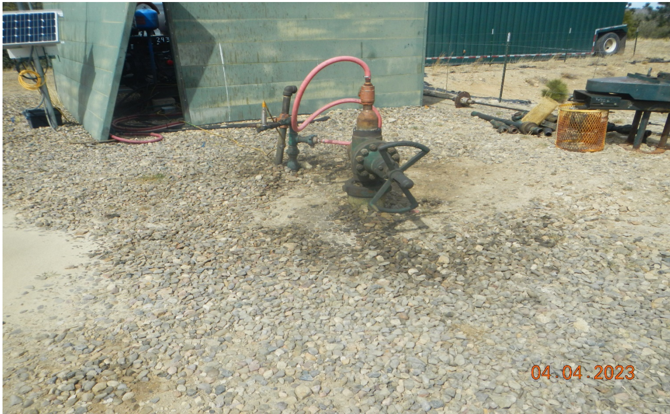
Photo 4. There is oily fluid sprayed out at the onto the ground at the wellhead that has not been cleaned up. Previous corrective action was not completed.