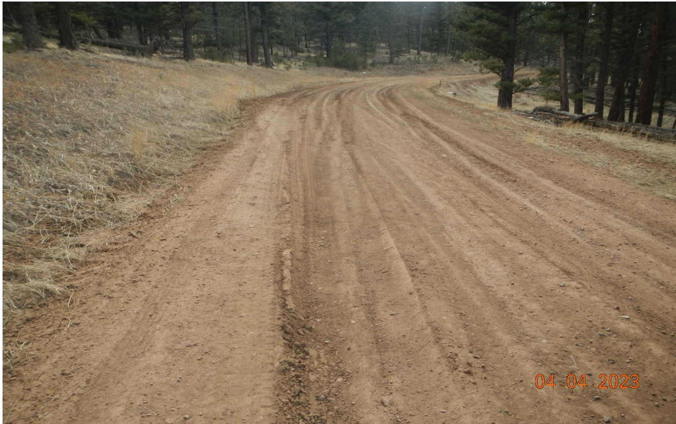
Photo 1. Facing southwest along the main road to the location. There are areas of vehicle rutting that will need to be repaired.