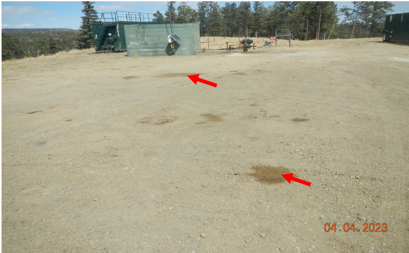
Photo 3. There is numerous areas of oil stained soil from the equipment parked on location which will need to be cleaned up. Previous corrective action was not completed.