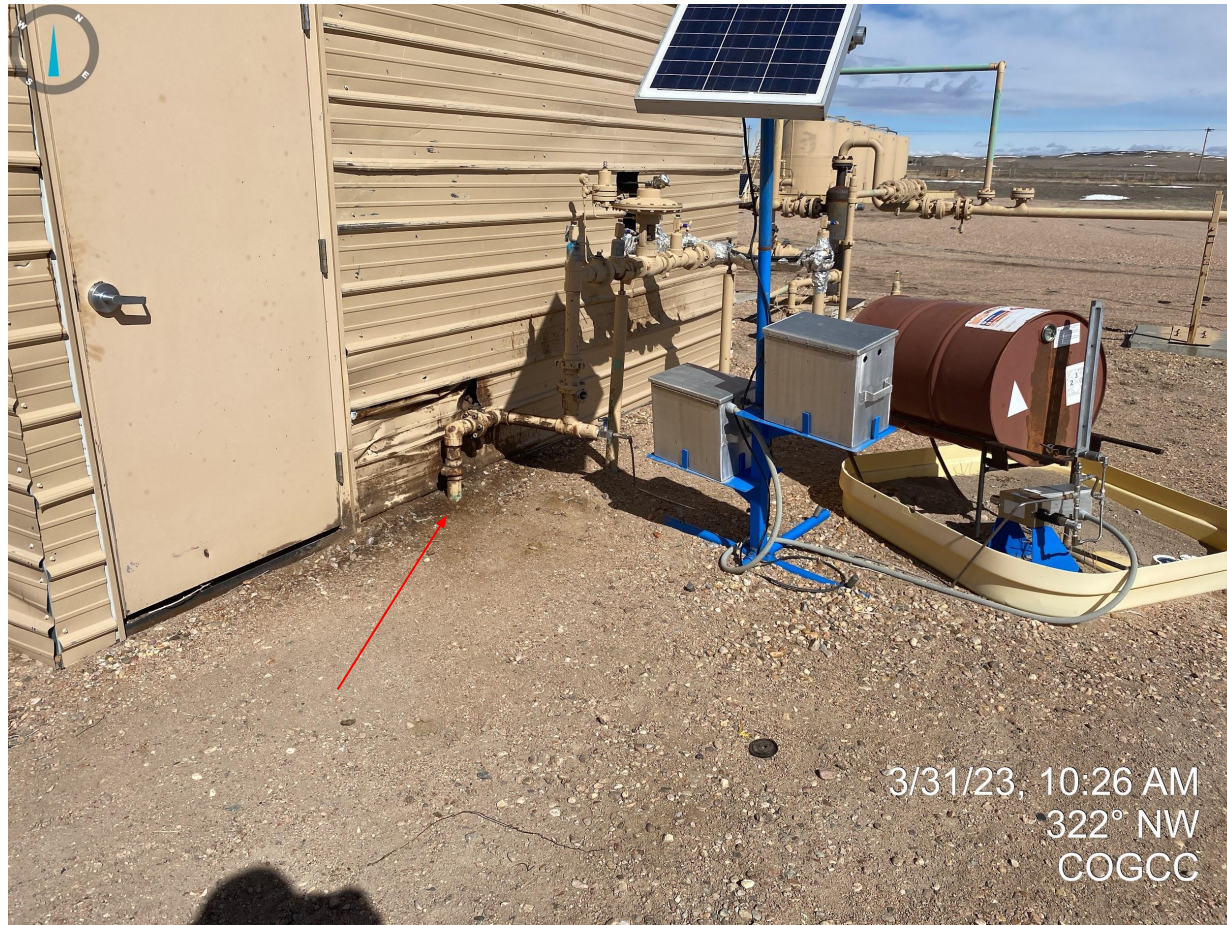
Photo 4. Facing northwest at engine shed. It appears the unused tin has been installed. Stained soil (red arrow) observed in the previous inspection does not appear to have been cleaned up per Rule 905.e.