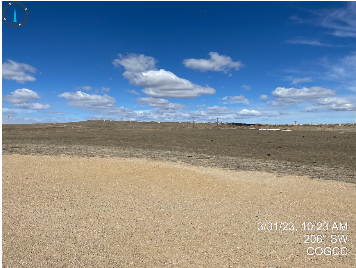
Photo 3. Facing southwest near the wellhead. It appears the operator has managed the interim areas (e.g. mowed) for undesirable vegetation. Note: evidence of livestock (e.g. cow pies) was observed throughout the location and interim areas.