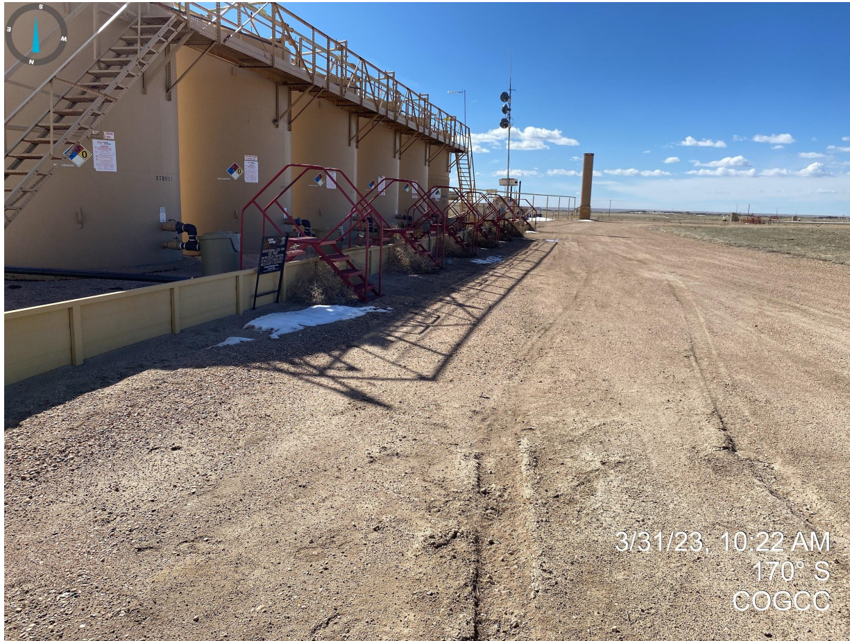
Photo 1. Facing south at tank battery. Operator submitted photo documentation showing that tumbleweed debris was removed from location. However, during this inspection high winds lead to additional tumbleweed accumulations that will need to be managed for in the future.