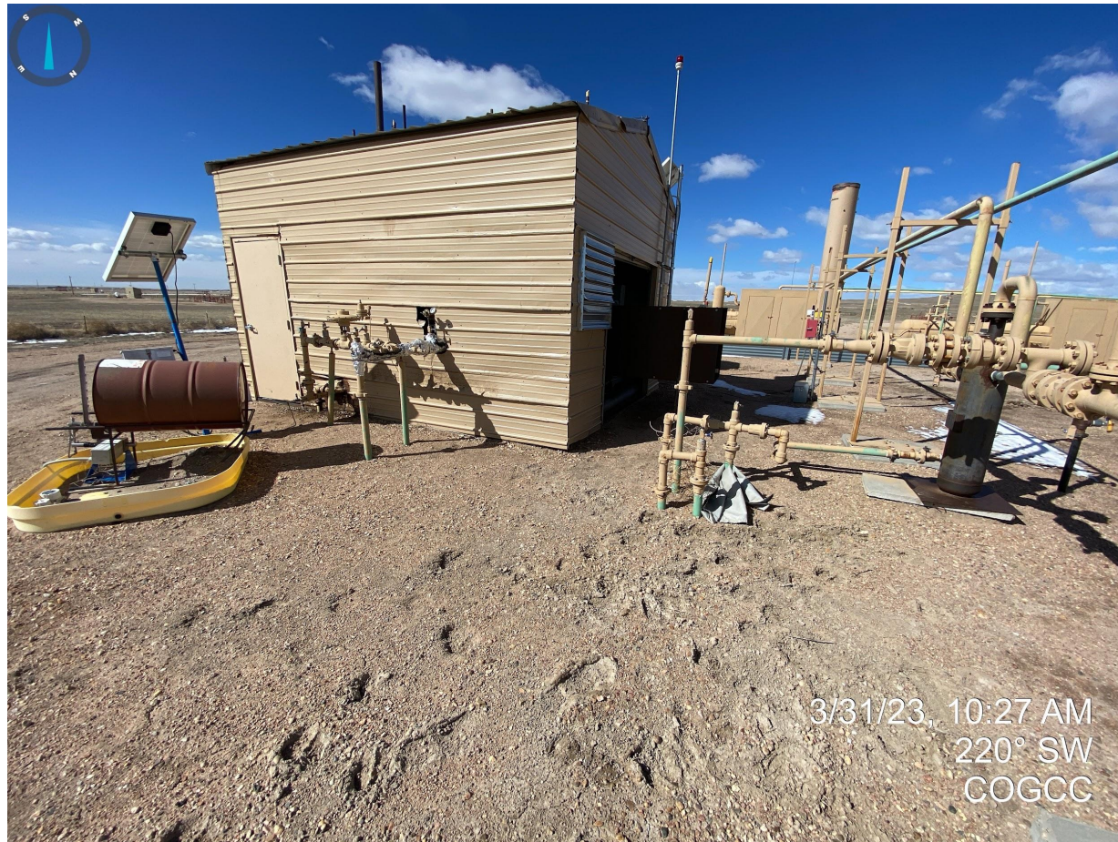
Photo 8. Overview of shed with tin reinstalled.