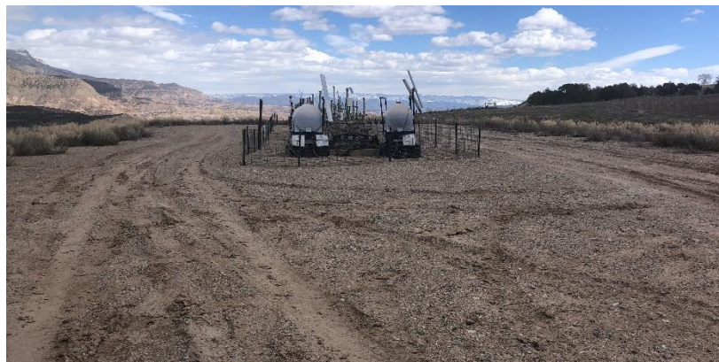
North East corner of location.