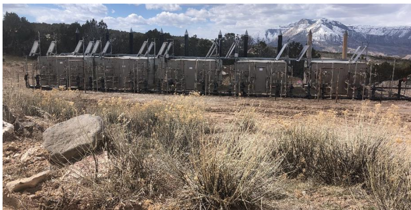
South West corner of location.