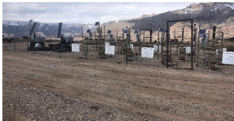
South East corner of location.