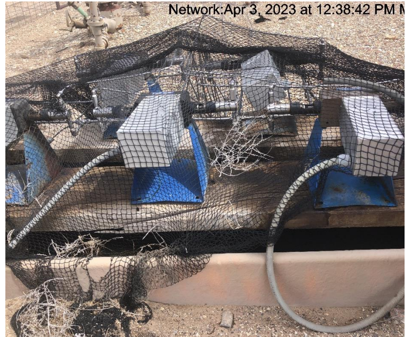
Photo #9479 Spill prevention and materials handling BMP insufficient.