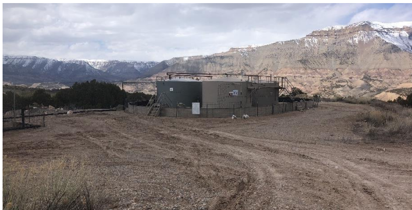
North West corner of location.