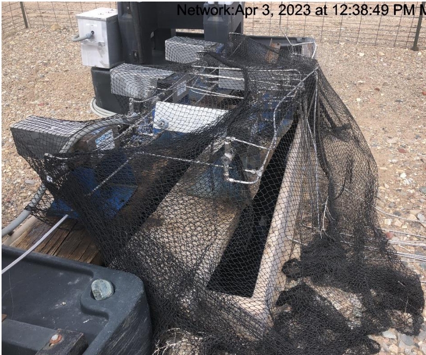
Photo #9480 Spill prevention and materials handling BMP insufficient.