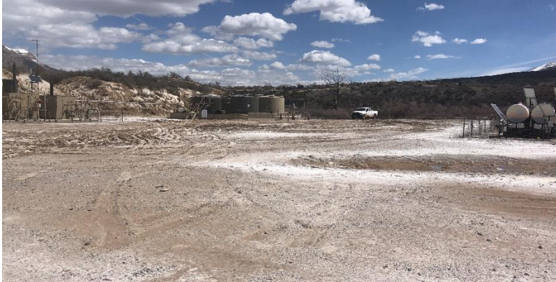
North West corner of location.