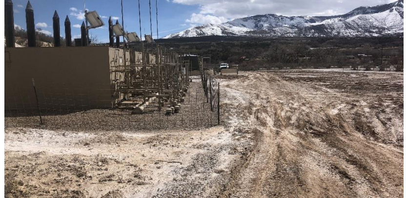
North East corner of location.