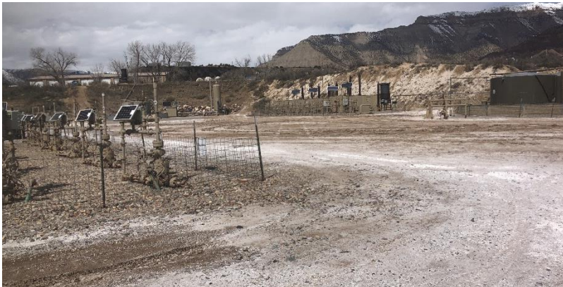
South West corner of location.