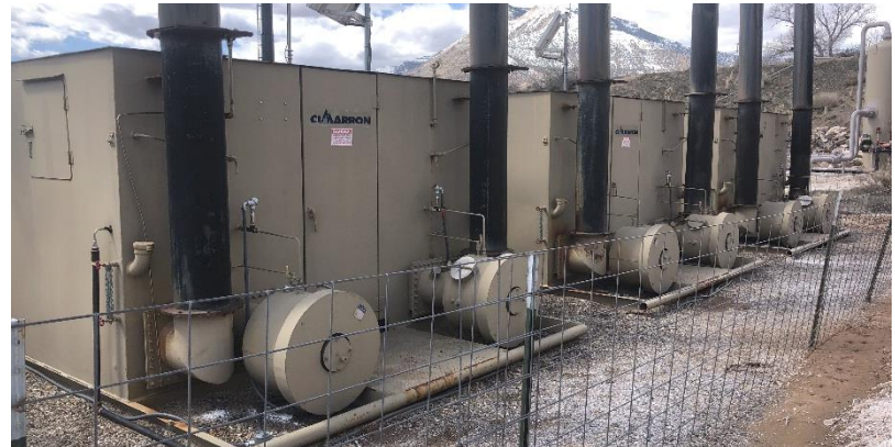
South East corner of location.