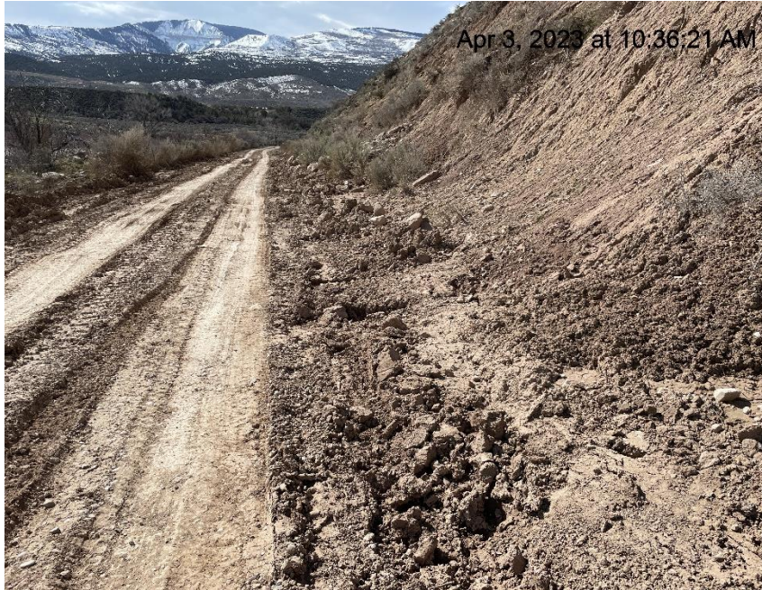
Photo # 4019 Lack of stabilization on slope/transport of sediment/insufficient BMP's (approximately 1.6- 1.7 miles down lease road)