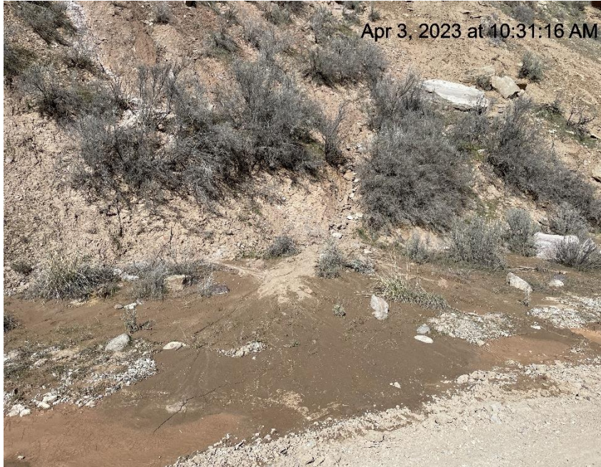
Photo # 4010 Sediment transport/insufficient BMP's (approximately 1.6 – 1.7 miles down lease road)