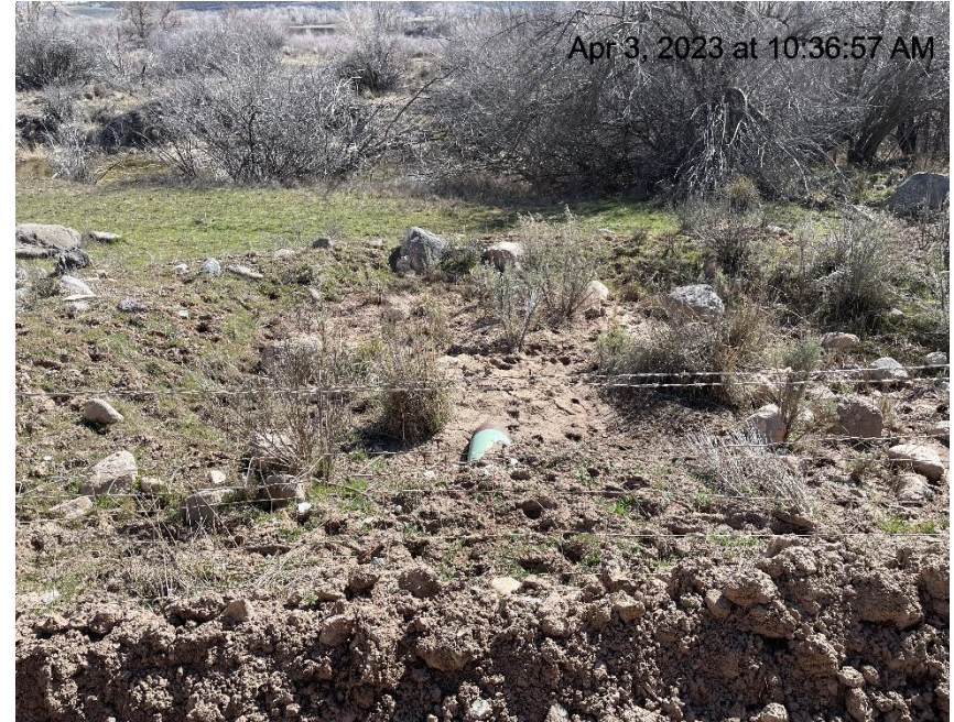
Photo # 4020 Culvert & sediment trap need maintenance (approximately 1.6- 1.7 miles down lease road)