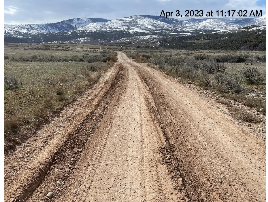
Photo # 4084 Lack of stabilization/Insufficient tracking BMP's (approximately 3.8 miles down lease road)