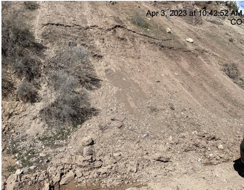
Photo # 4043 Lack of stabilization on slope/Insufficient run on controls/BMP's/transport of sediment (approximately 1.6 – 1.7 miles down lease road)