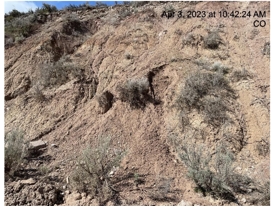
Photo # 4041 Lack of stabilization on slope/Insufficient run on controls/BMP's/transport of sediment (approximately 1.6 – 1.7 miles down lease road)