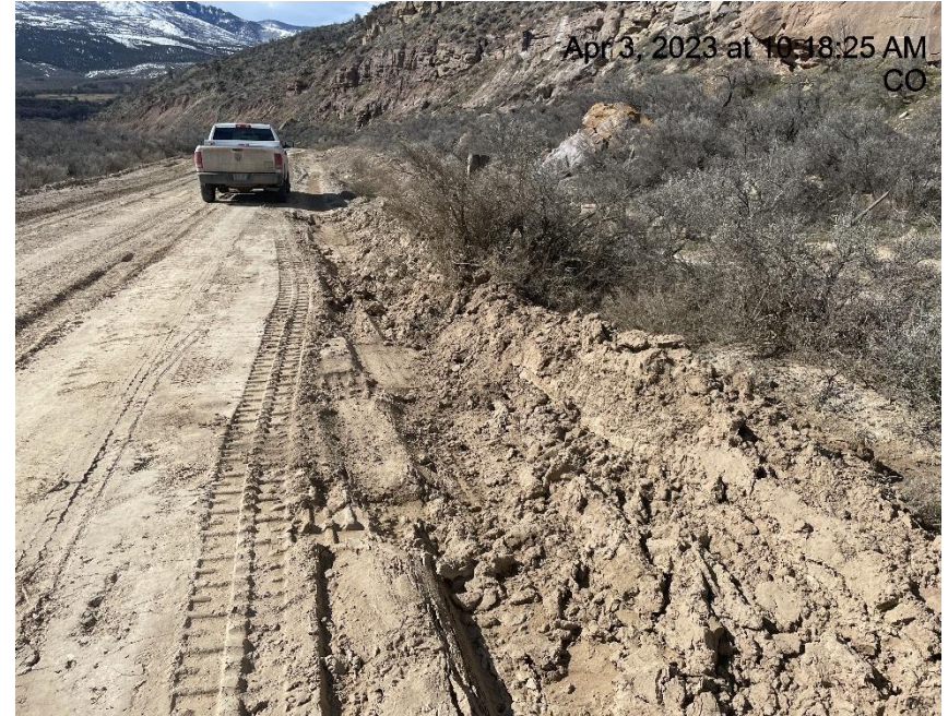
Photo # 3996 Transport of sediment/insufficient BMP's (approximately 1.5 miles down lease road)