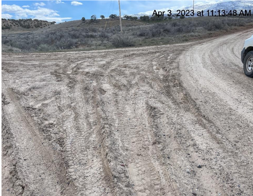
Photo # 4080 Lack of stabilization/Insufficient tracking BMP's (approximately 3.5 miles down lease road)