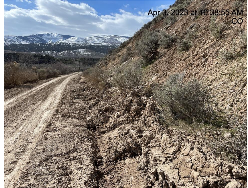
Photo # 4029 Insufficient run on BMP's (approximately 1.6 – 1.7 miles down lease road)