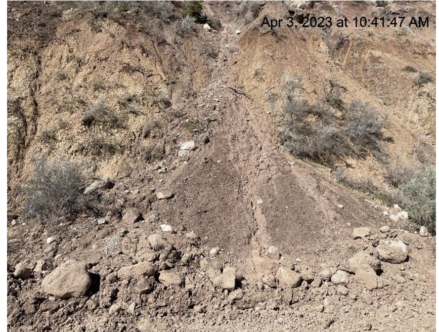
Photo # 4039 Lack of stabilization on slope/Insufficient run on controls/BMP's/transport of sediment (approximately 1.7 miles down lease road)