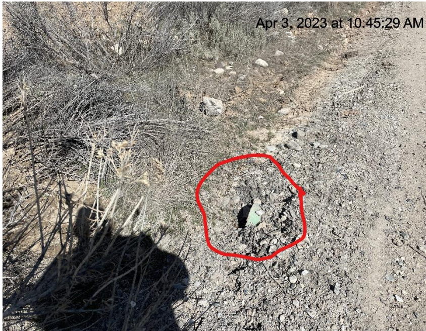
Photo # 4044 Culvert has insufficient BMP's, allows direct discharge into the Colorado River (approximately 1.8 – 1.9 miles down lease road)