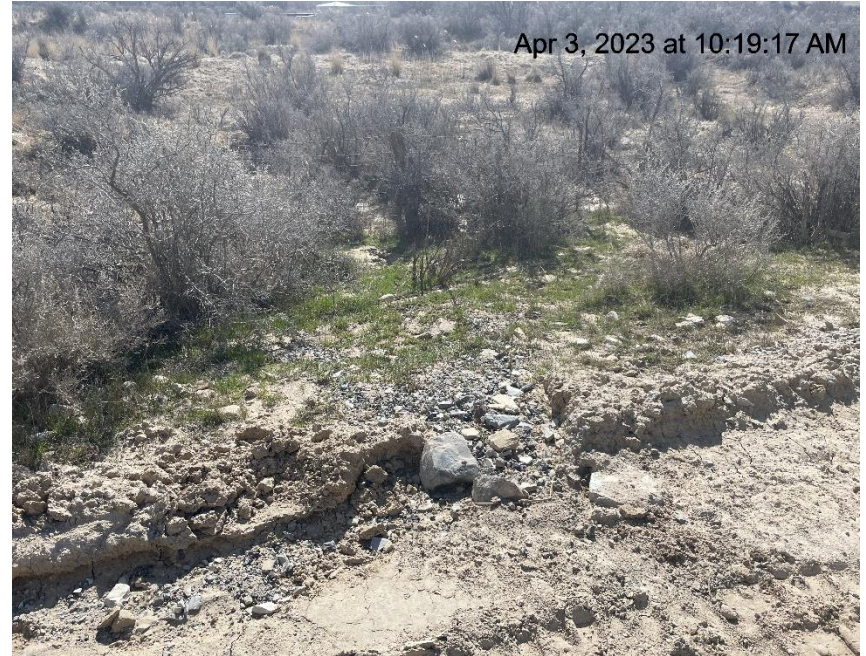
Photo # 3997 Rill erosion & transport of sediment off lease road (approximately 1.5 – 1.6 miles down lease road)