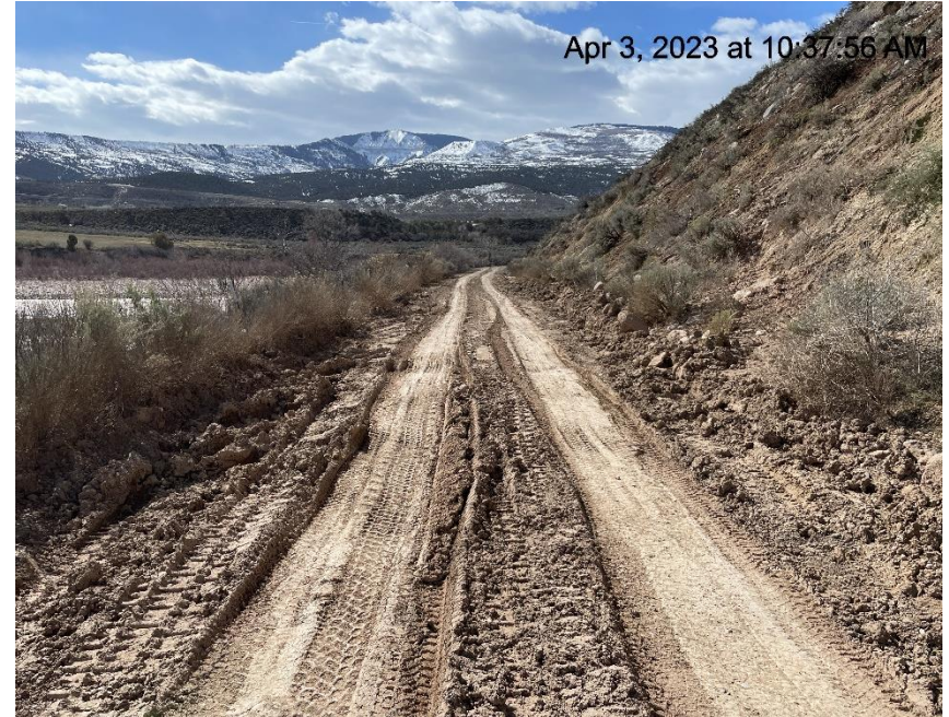
Photo # 4024 Lack of stabilization/insufficient tracking BMP's/insufficient run on controls/BMP's/transport of sediment (approximately 1.7 miles down lease road)