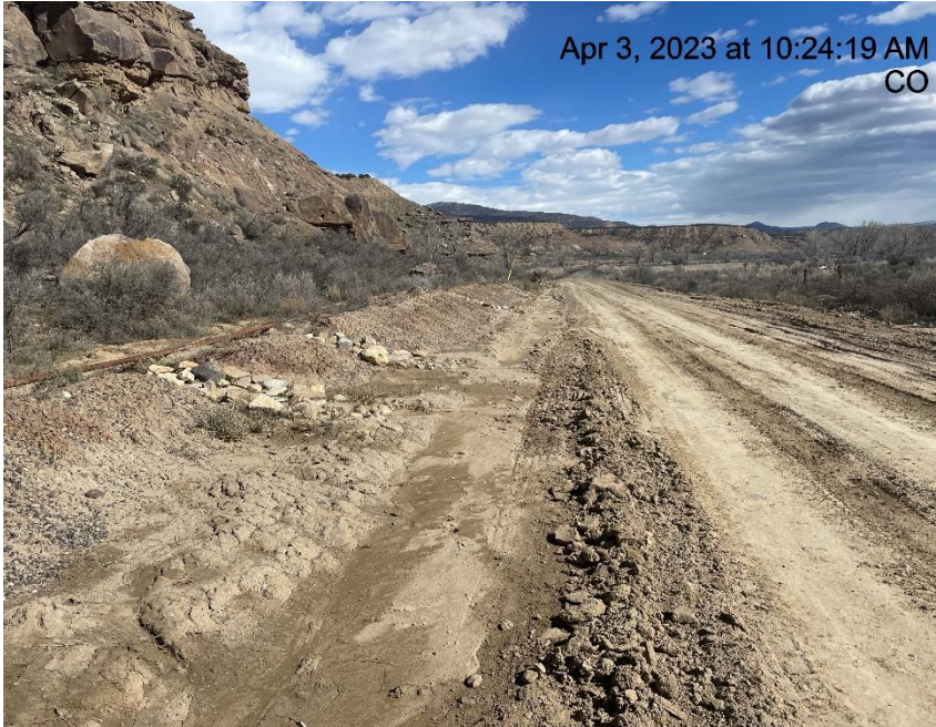
Photo # 4000 Transport of sediment/Insufficient run on controls /BMP's (approximately 1.5 – 1.6 miles down lease road)