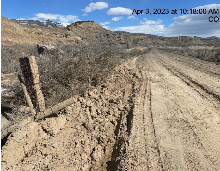
Photo # 3995 Transport of sediment/insufficient BMP's (approximately 1.5 miles down lease road)