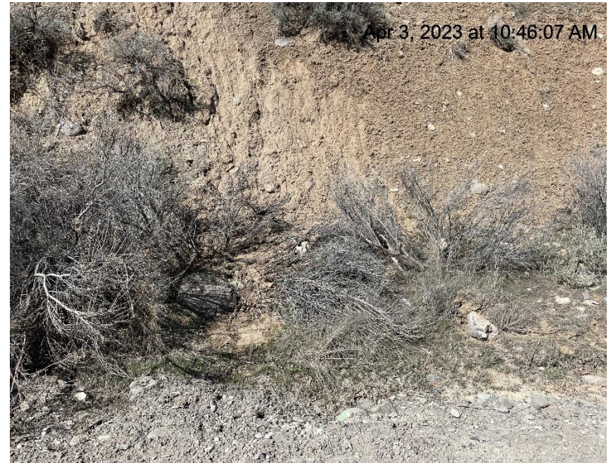
Photo # 4047 Lack of stabilization on slope/Insufficient run on controls/BMP's/transport of sediment (approximately 1.6 – 1.7 miles down lease road)