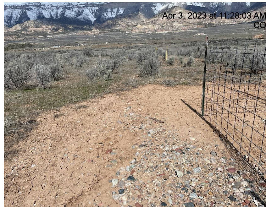
Photo # 4096 Rill erosion & transport of sediment (near production unit)