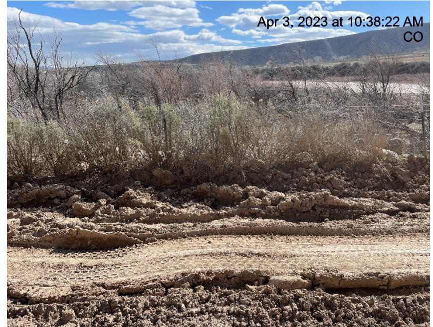
Photo # 4027 Lack of stabilization/Insufficient tracking BMP's (approximately 1.7 miles down lease road)