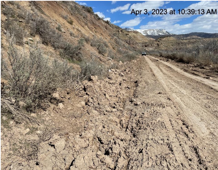
Photo # 4030 Insufficient run on BMP's (approximately 1.6 – 1.7 miles down lease road)