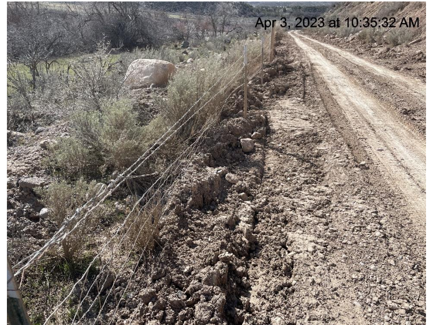
Photo # 4016 Sediment transported off lease road/insufficient BMP's (approximately 1.6 – 1.7 miles down lease road)