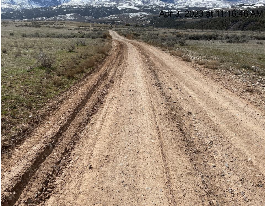
Photo # 4083 Lack of stabilization/Insufficient tracking BMP's (approximately 3.8 miles down lease road)