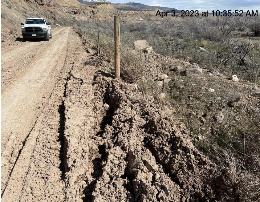
Photo # 4017 Sediment transported off lease road/insufficient BMP's (approximately 1.6 – 1.7 miles down lease road)