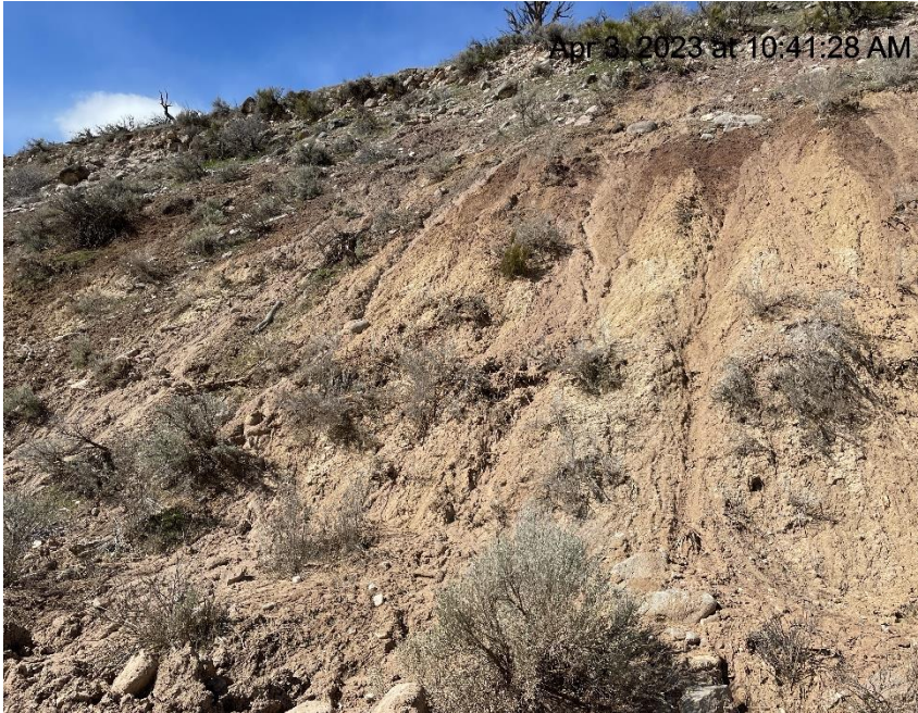
Photo # 4038 Lack of stabilization on slope/Insufficient run on controls/BMP's/transport of sediment (approximately 1.7 miles down lease road)