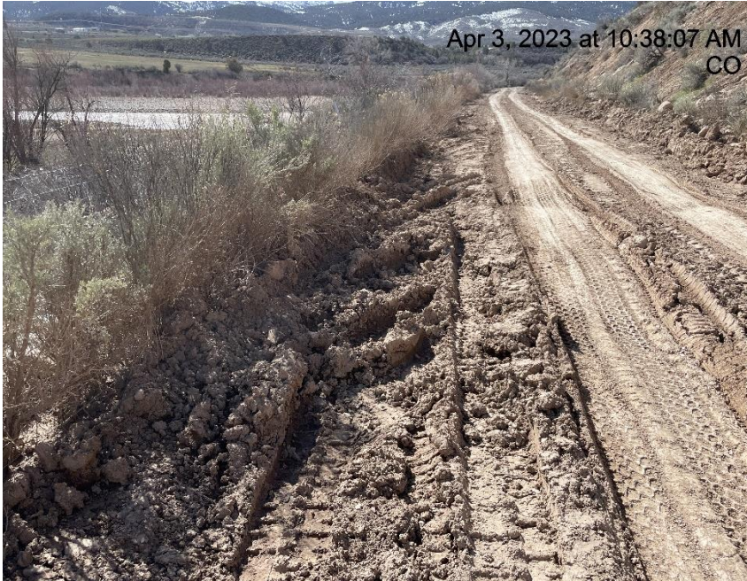
Photo # 4026 Insufficient BMP's/Sediment transported off lease road & into vegetation (approximately 1.6 – 1.7 miles down lease road)