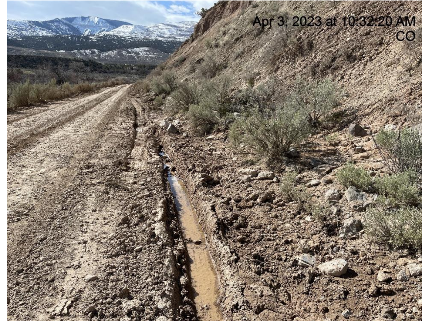
Photo # 4011 Photo # 4010 Sediment transport/insufficient BMP's (approximately 1.6 – 1.7 miles down lease road)