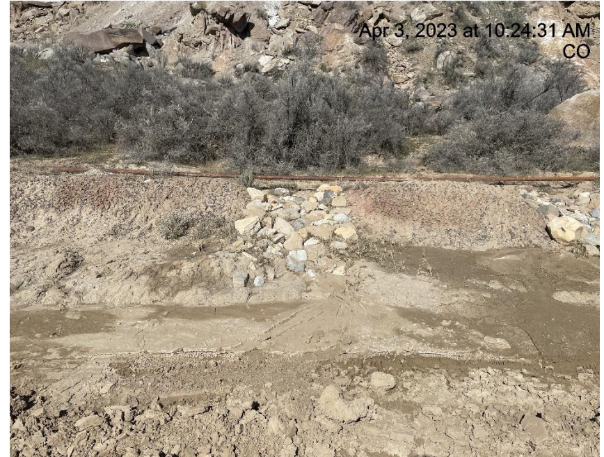
Photo # 4001 Transport of sediment/Insufficient run on controls/ BMP's (approximately 1.5 – 1.6 miles down lease road)