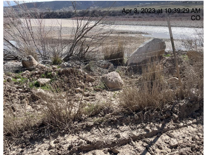
Photo # 4031 Insufficient BMP's/Sediment transported off lease road & into vegetation near the Colorado River (approximately 1.7 – 1.8 miles down lease road)