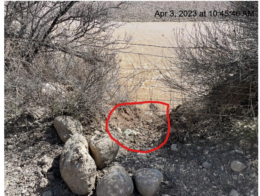
Photo # 4045 Culvert has insufficient BMP's, allows direct discharge into the Colorado River (approximately 1.8 – 1.9 miles down lease road)