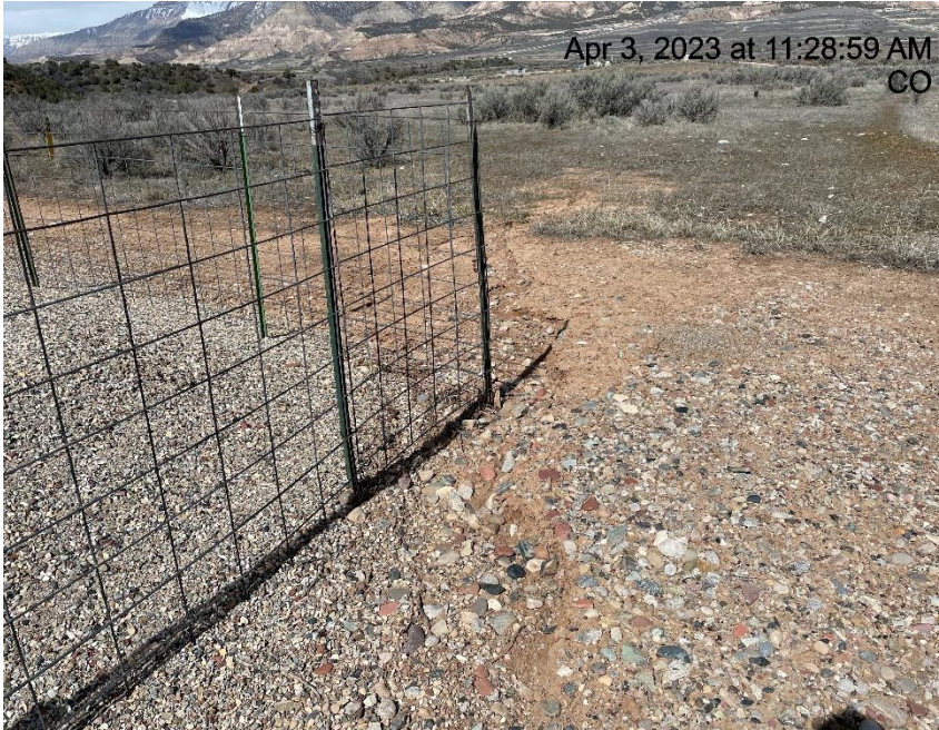
Photo # 4098 Rill erosion & transport of sediment off location (near production tank & containment)