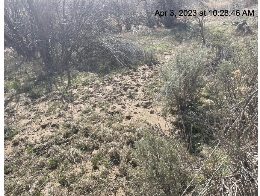
Photo # 4009 Transport of sediment off lease road & into vegetation (approximately 1.6 miles down lease road)