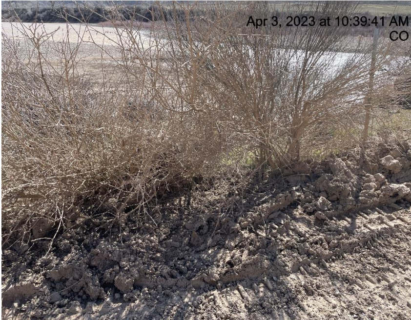
Photo # 4032 Insufficient BMP's/Sediment transported off lease road & into vegetation near the Colorado River (approximately 1.7 – 1.8 miles down lease road)