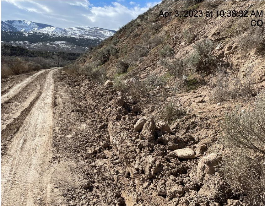
Photo # 4028 Insufficient run on BMP's (approximately 1.6 – 1.7 miles down lease road)