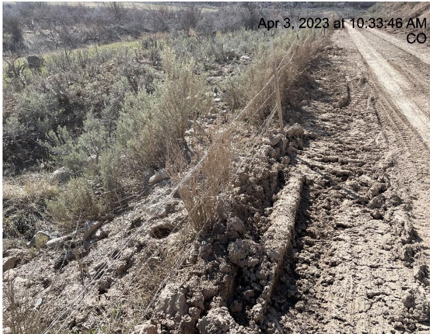
Photo # 4015 Sediment transported off lease road/insufficient BMP's (approximately 1.6 – 1.7 miles down lease road)