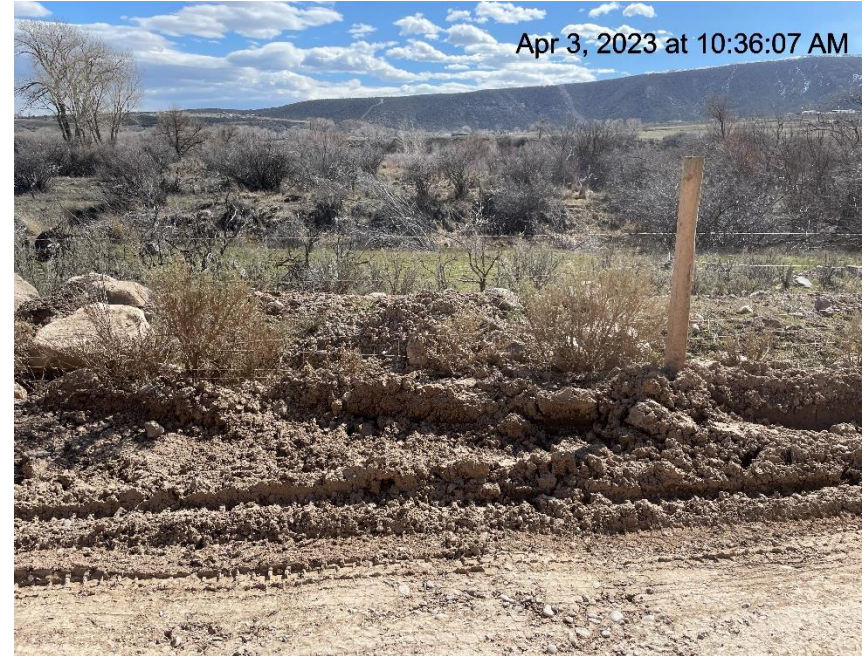
Photo # 4018 Sediment transported off lease road/insufficient BMP's (approximately 1.6 – 1.7 miles down lease road)