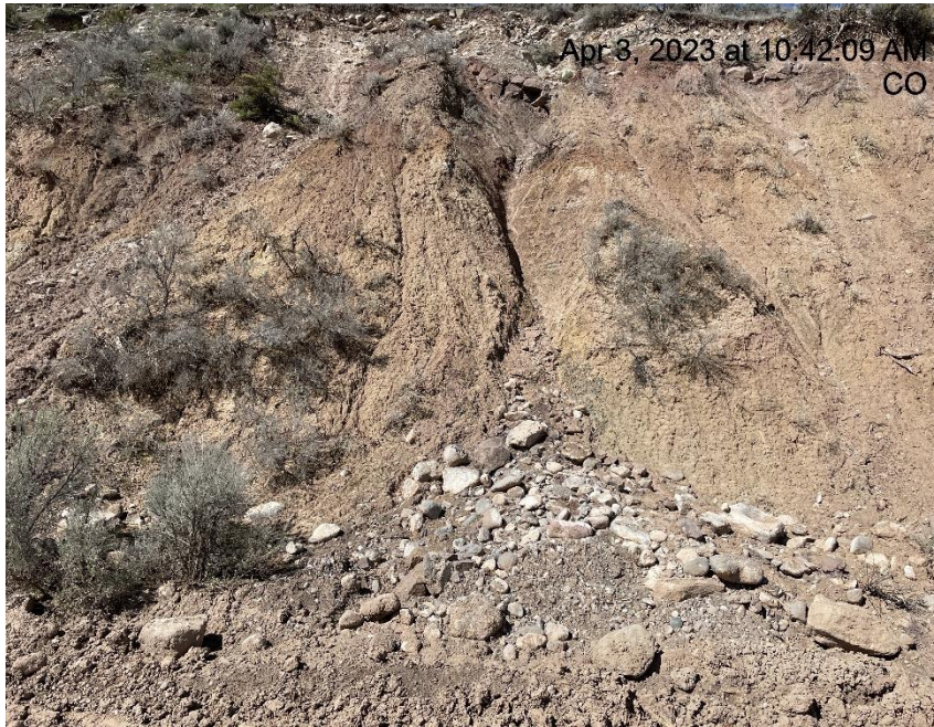
Photo # 4040 Lack of stabilization on slope/Insufficient run on controls/BMP's/transport of sediment (approximately 1.6 – 1.7 miles down lease road)