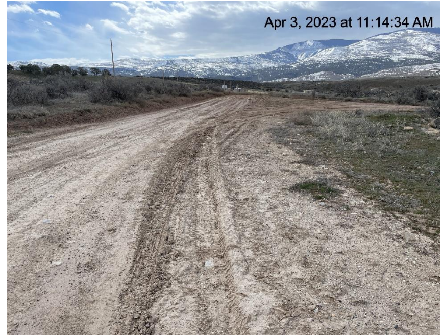
Photo # 4081 Lack of stabilization/Insufficient tracking BMP's (approximately 3.5 miles down lease road)