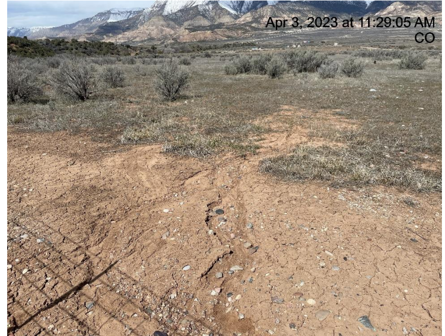
Photo # 4099 Rill erosion & transport of sediment off location (near production tank & containment)