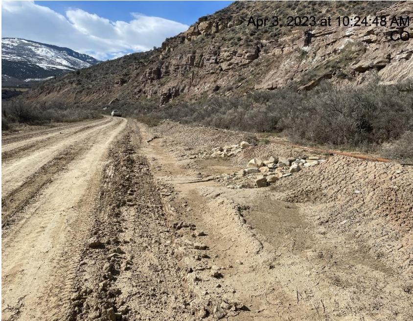
Photo # 4003 Transport of sediment/Insufficient run on controls/BMP's (approximately 1.5 – 1.6 miles down lease road)