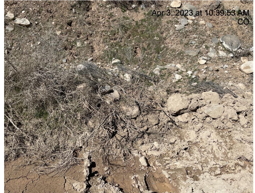
Photo # 4033 Insufficient BMP's/Sediment transported off lease road & into vegetation (approximately 1.7 – 1.8 miles down lease road)