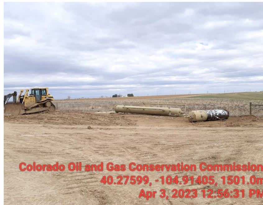
Photo 4 unused equipment vertical separators