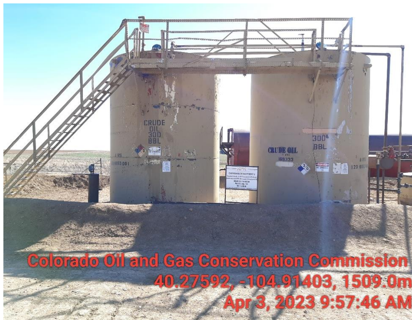
Photo 1 TNK BTRY