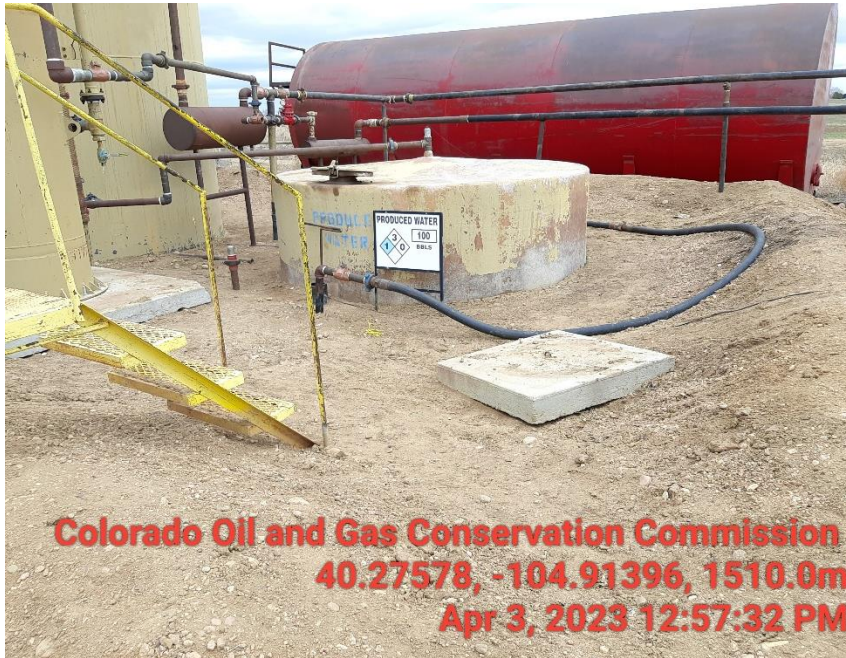
Photo 7 unused equipment cement block