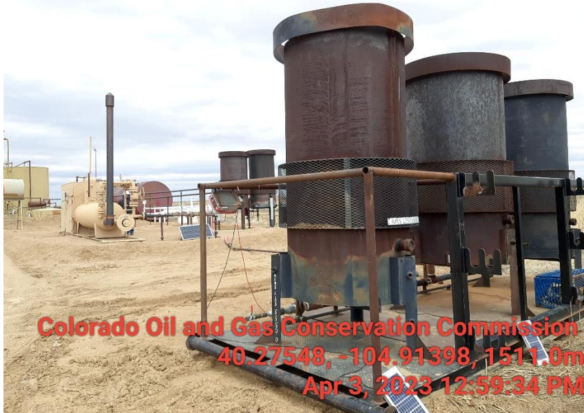
Photo 11 portable EDC unit hooked to line from Crude oil tanks.