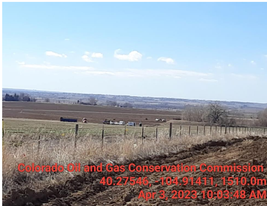
Photo 3 Swabing unit laid down and rusts in road