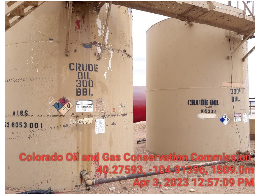
Photo 6 NFPA placards faded on crude oil tanks