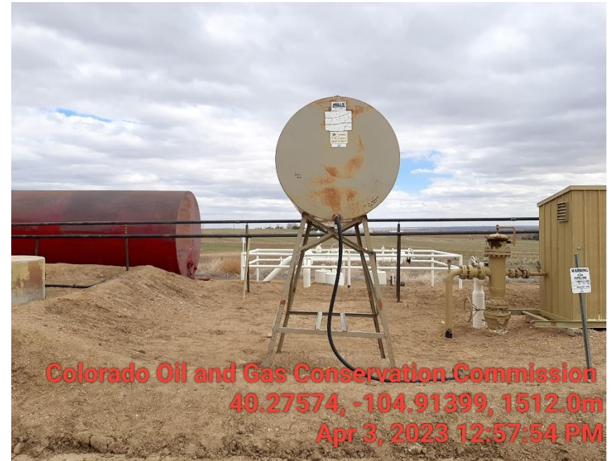
Photo 8 storage tank not Containment BMP