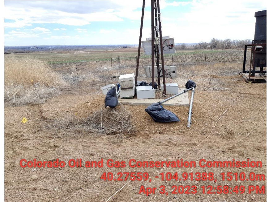
Photo 10 unused equipment poles batteries and boxes.