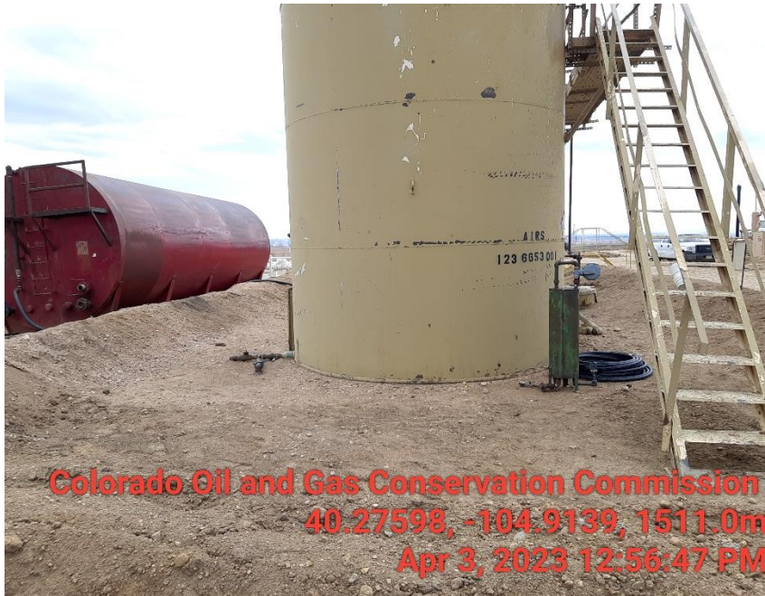
Photo 5 Unused equipment scrubber tank and poly