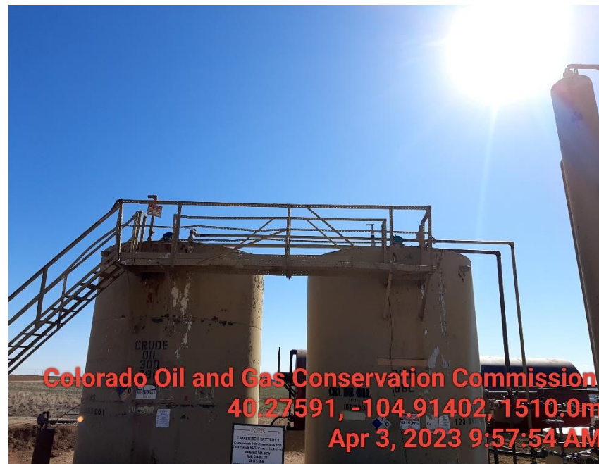
Photo 2 Guage hatches open