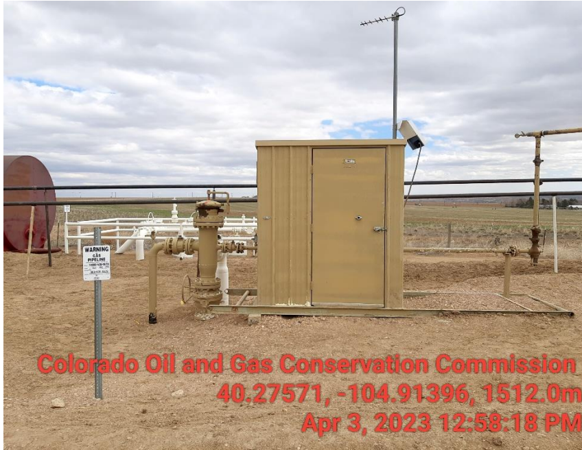
Photo 9 meter house