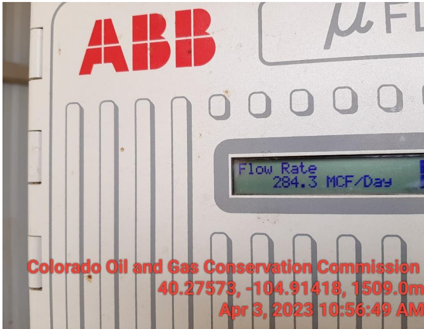
Photo 9 Meter station 235486 showing production