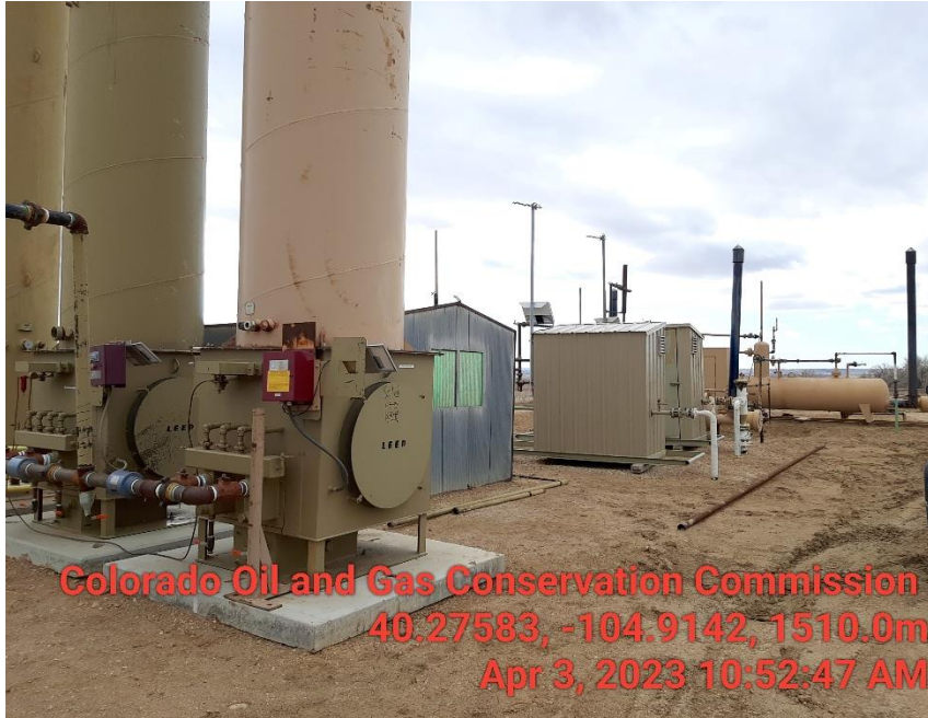
Photo 5 unused equipment pipe and parts on ground