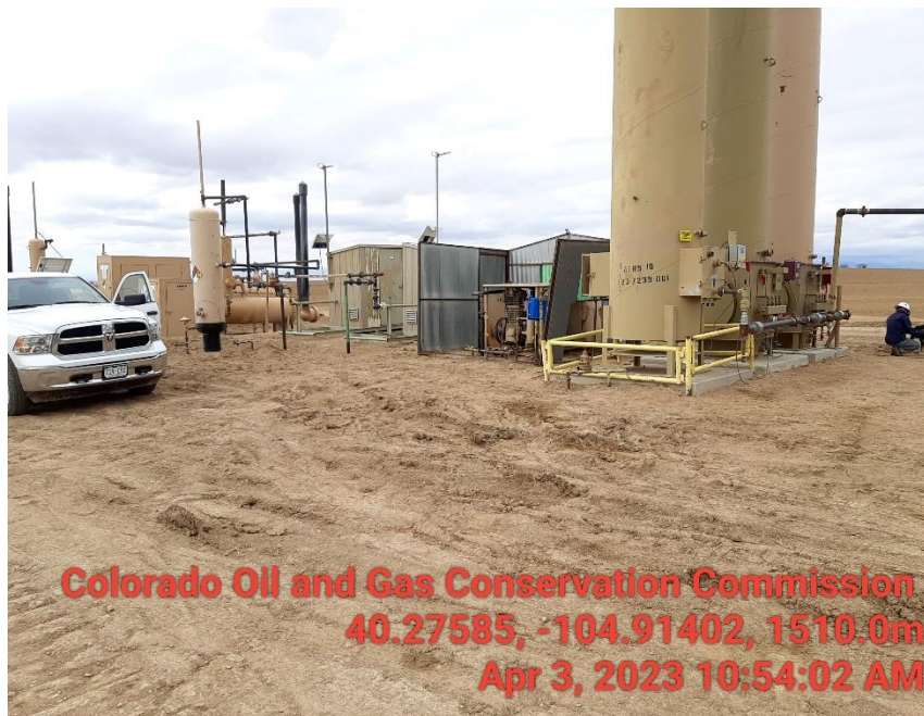
Photo 7 production equipment