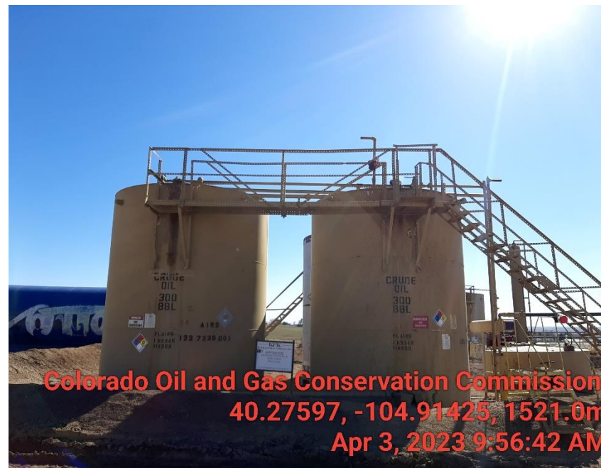
Photo 2 TNK BTRY