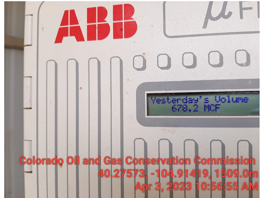
Photo 10 Meter station 235486 showing production