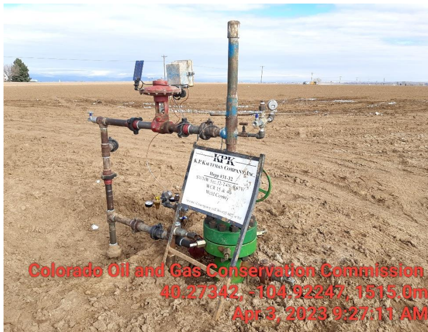
Photo 1 Well head