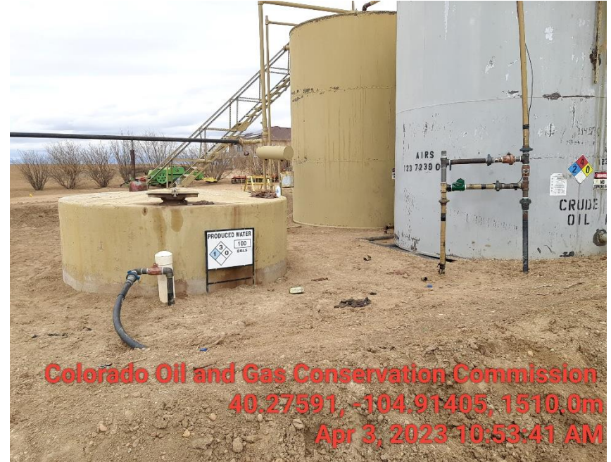
Photo 6 Trash on production tank and in containment.