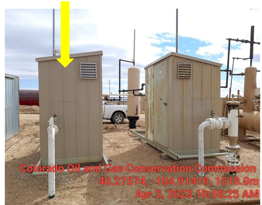
Photo 12 meter house not in operation used for storage.