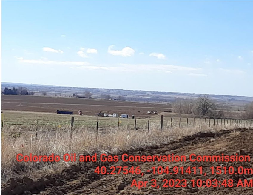
Photo 3 roads deep ruts and swabbing unit laid down.