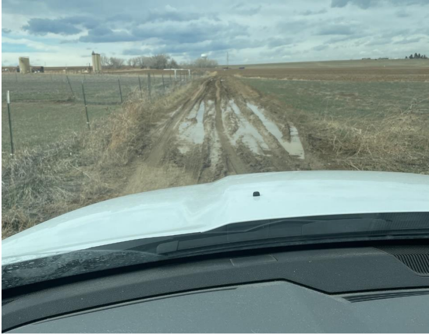
Photo 13 Roads deep ruts and holding water.