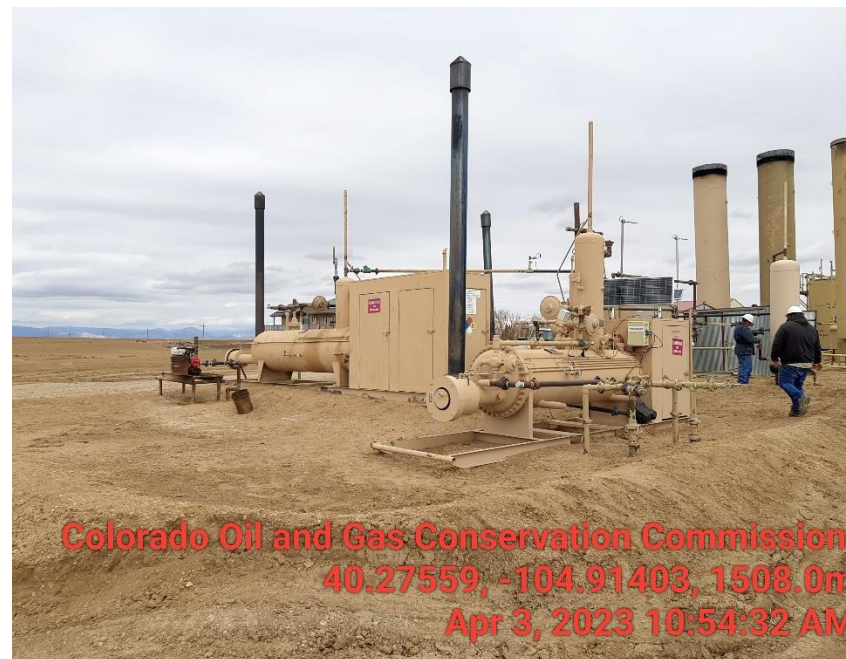
Photo 8 production equipment