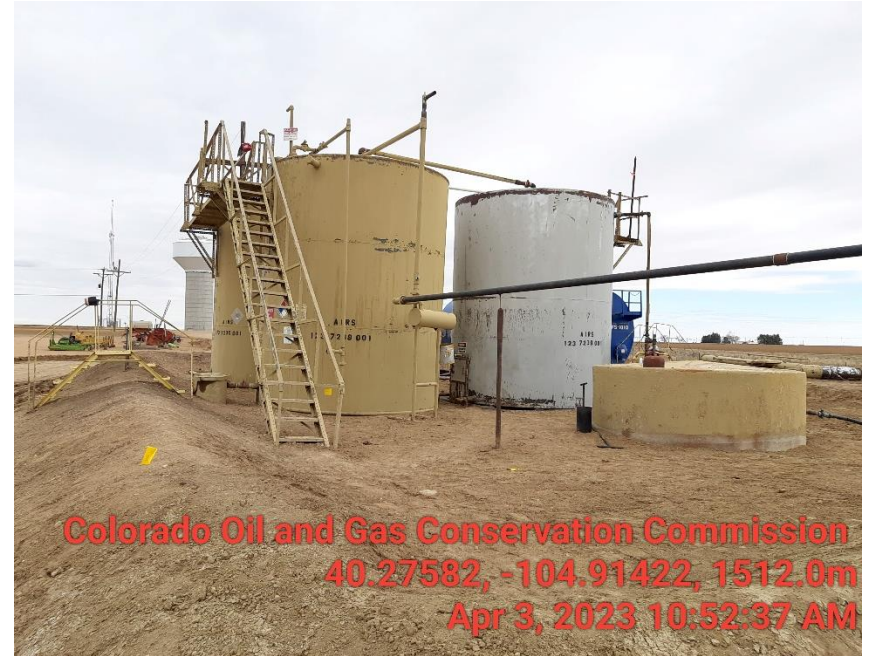
Photo 4 TNK BTRY tank not painted.