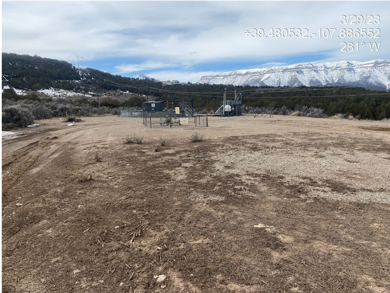
Photo 1. Photo taken from the entrance shows an overview of the location.