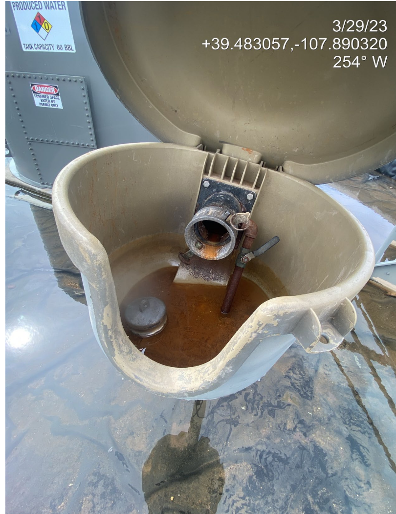
Photo 3. Photo shows a bull plug/cap is not installed on a load line.