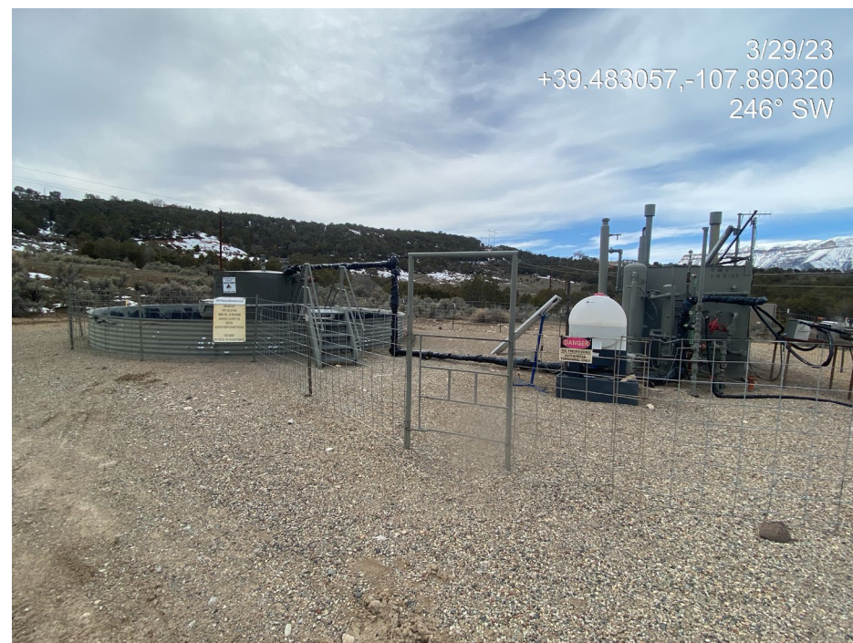
Photo 2. Photos show production areas.