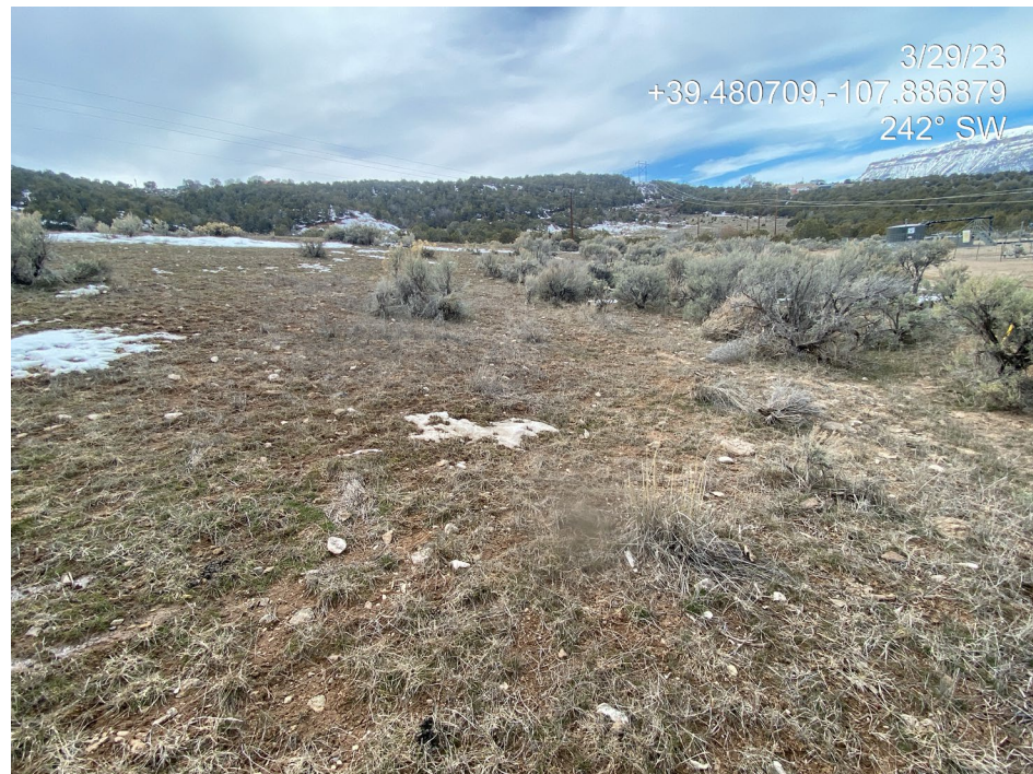
Photo 4. Photos show northern (left) and southern (right) interim areas.