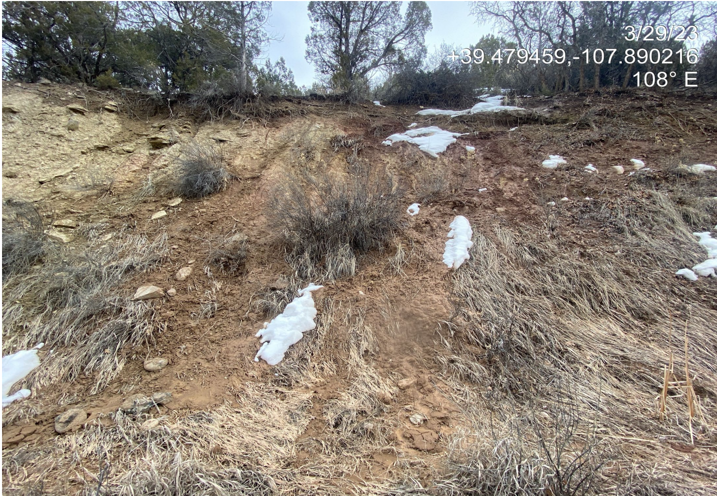
Photo 7. Photo shows sloughed soil accumulating at the base of the southeastern cut slope and covering vegetation. Note also exposed roots at the top of the cut also indicating soil loss.