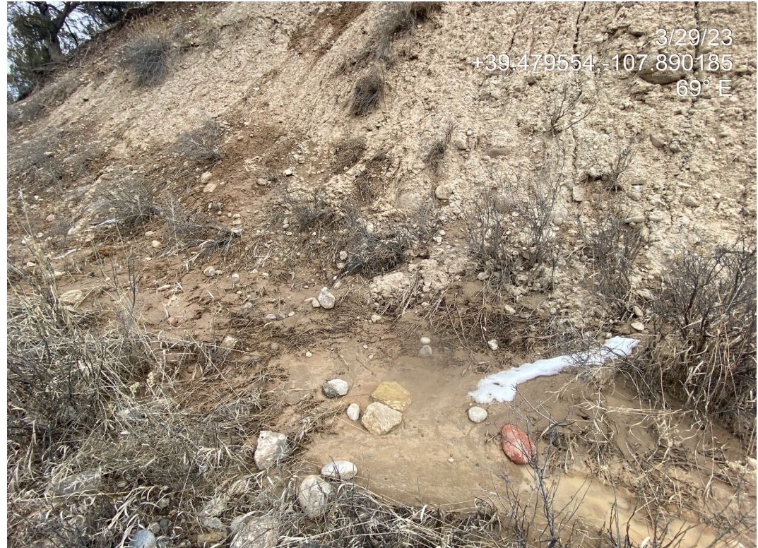
Photo 6. Photos show sediment accumulating at the base of the eastern cut slope. Erosion is resulting in degradation to the slope, smothering vegetation below and contributing sediment loads to stormwater.