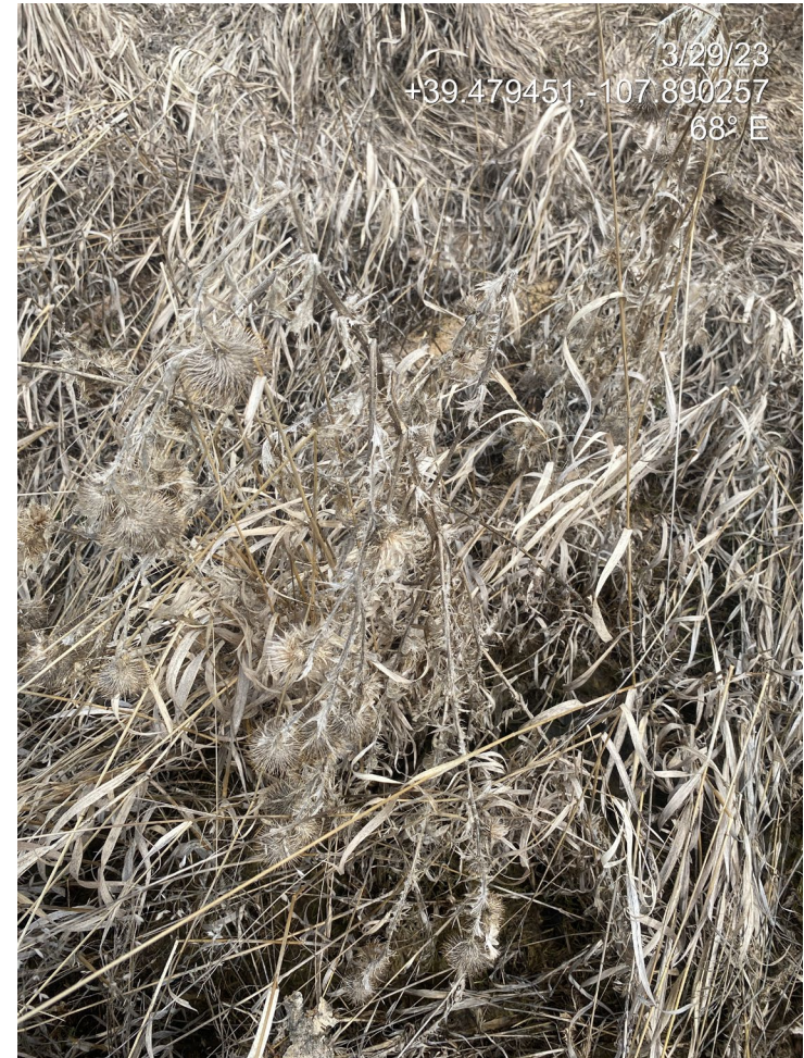
Photo 3. Photos show bull thistle (List B Noxious) in the southern interim area.