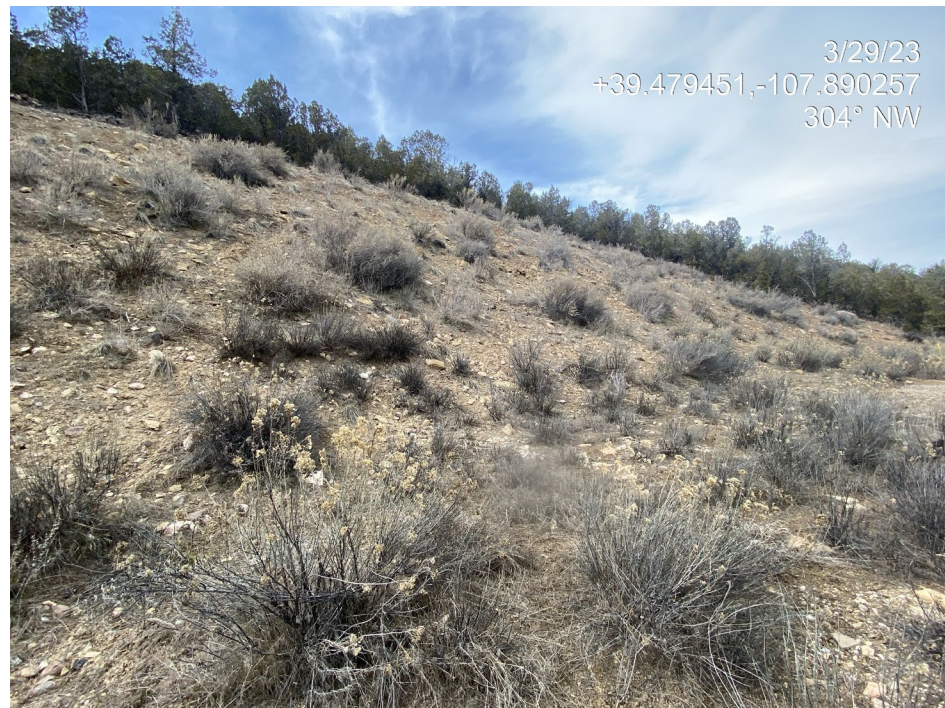
Photo 8. Photos show southern (left) and western (right) interim areas.