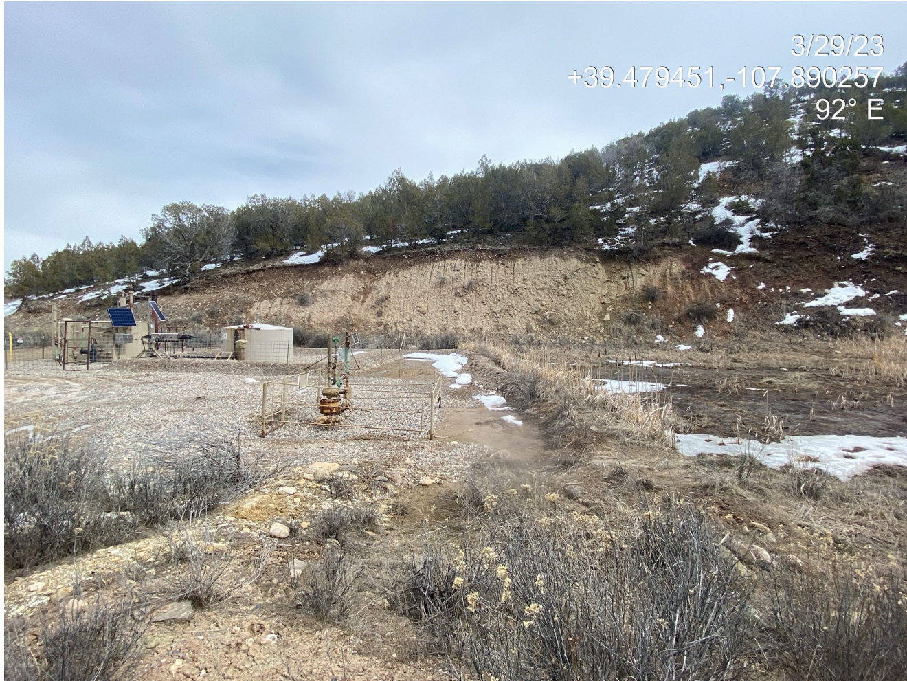
Photo 1. Photo taken from the west shows an overview of the location.