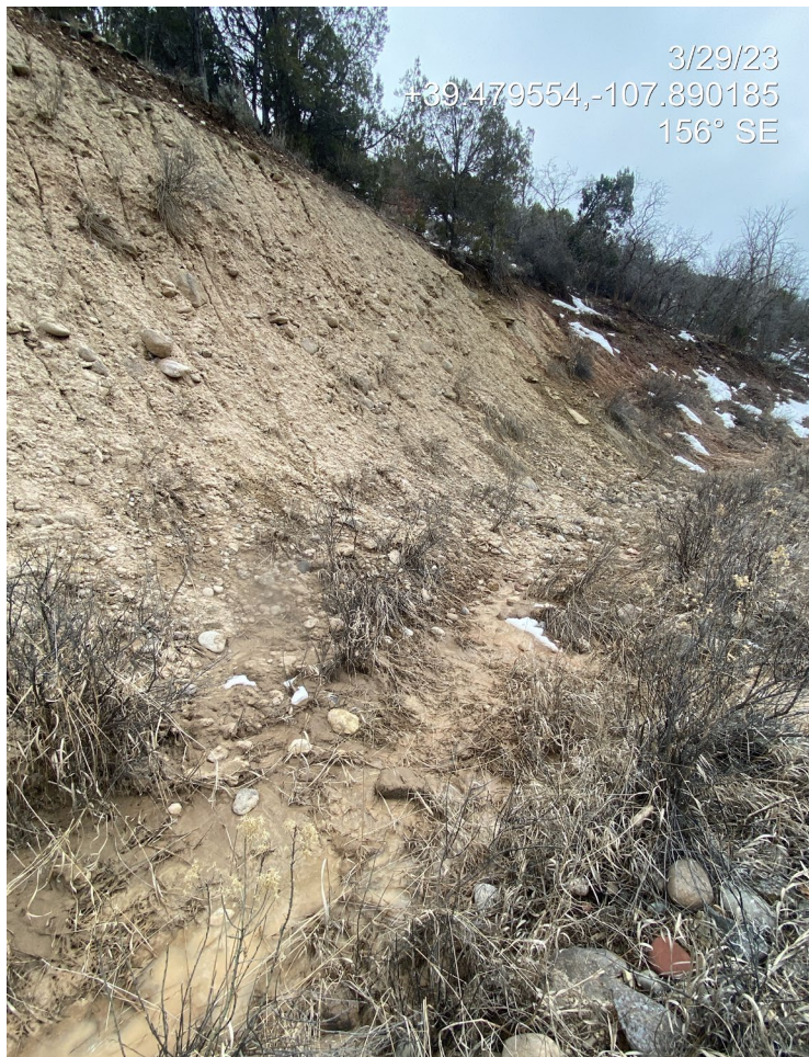
Photo 4. Photo shows the eroding cut to the east and sediment laden stormwater flowing at the base of the cut.