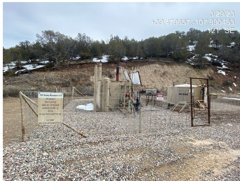
Photo 2. Photos show production areas. Note stained gravel at the wellhead (left).