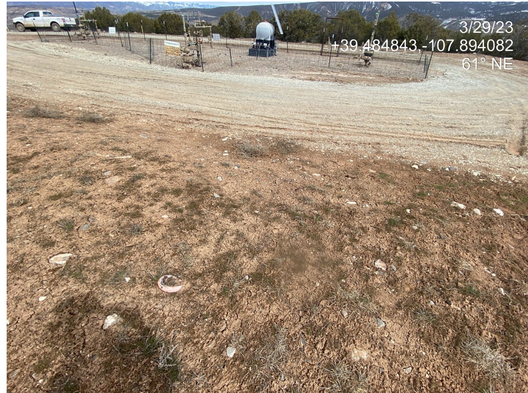
Photo 3. Photos show two (2) unmarked anchors within the tank battery berm (left) and in the western interim area.