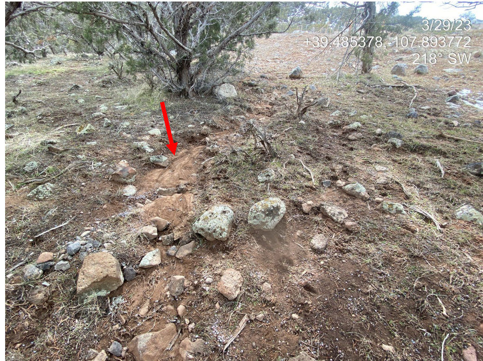
Photo 5. Photos show an example of rill erosion on the fill slope to the east of the location (left) continuing offsite into reference areas in the form of rill erosion and sediment deposition (right).