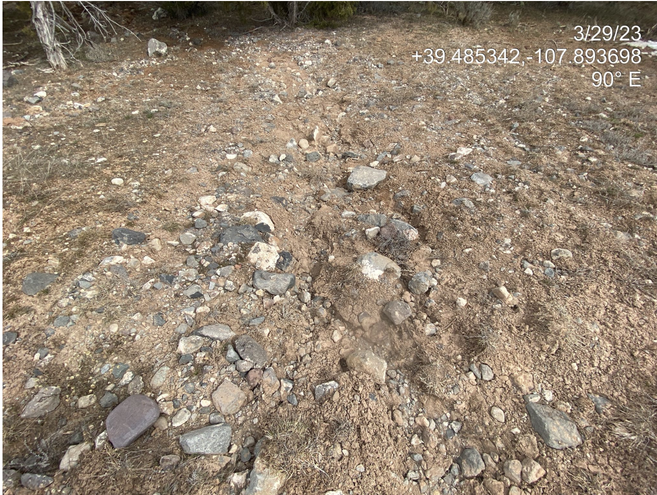
Photo 6. Photo shows an example of erosion on the fill slope to the east of the location.