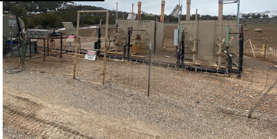
Photo 2. Photos show production areas.