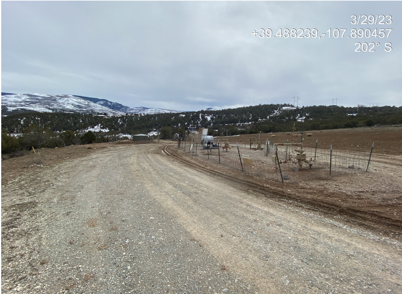
Photo 1. Photo taken from the entrance shows an overview of the location.