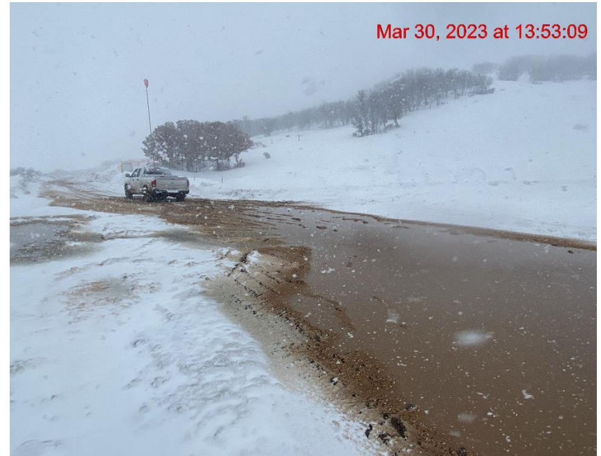
Lack of Stabilization w/ Inadequate Tracking BMP – Photo #01793