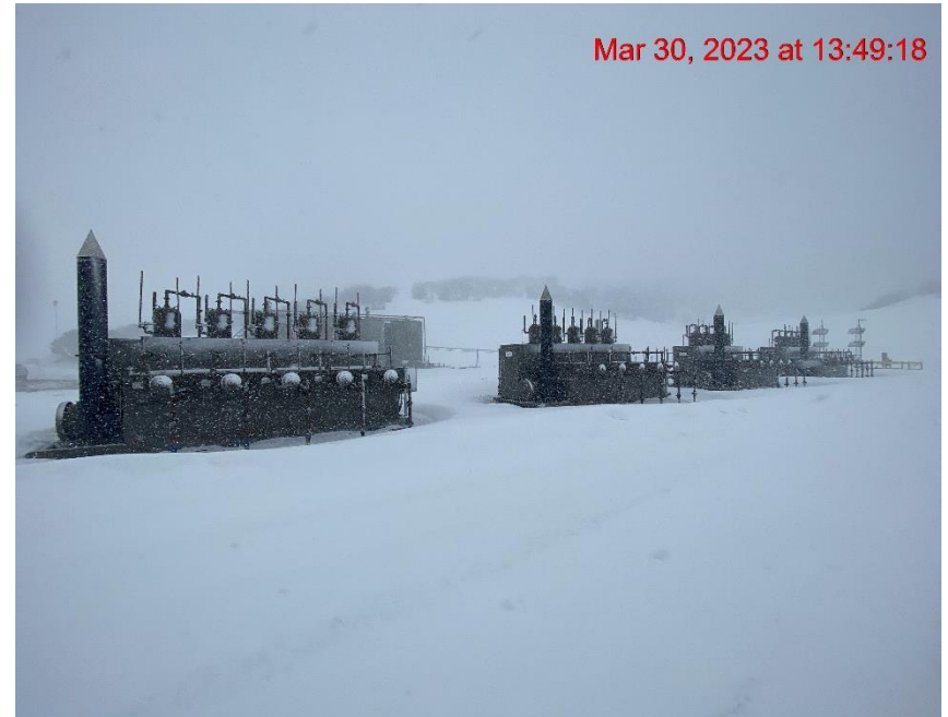
Separators – Photo #01787