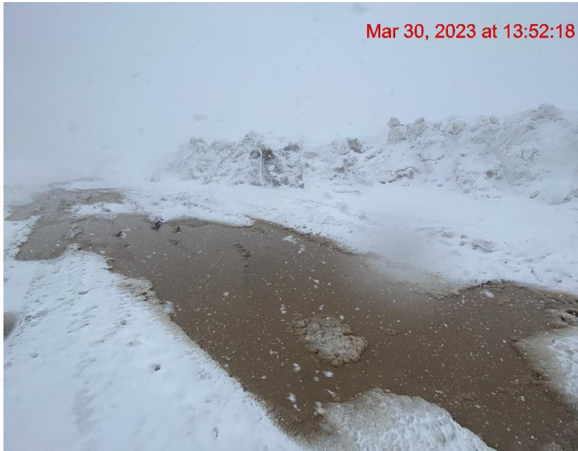
Lack of Stabilization w/ Inadequate Tracking BMP – Photo #01791