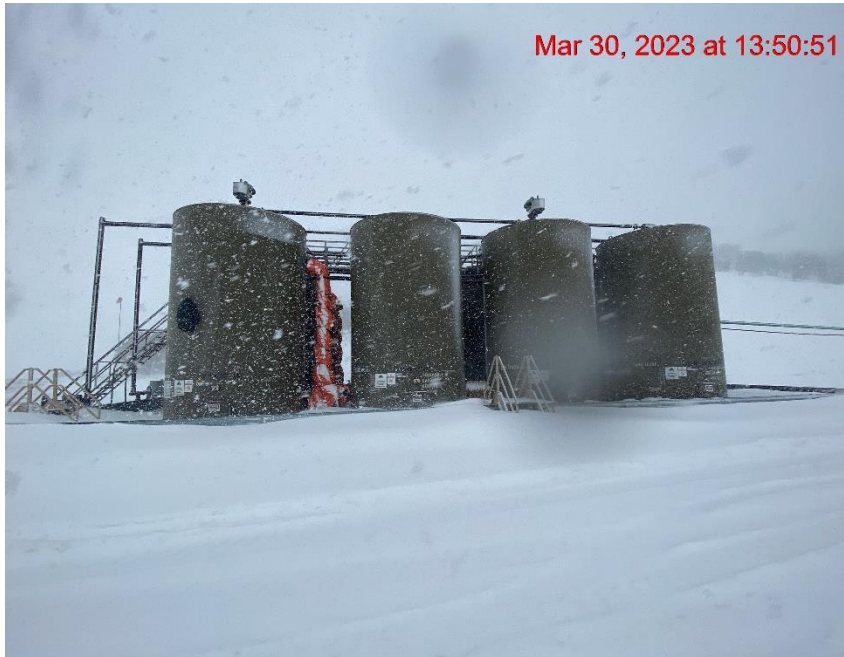
Tank Battery – Photo #01789