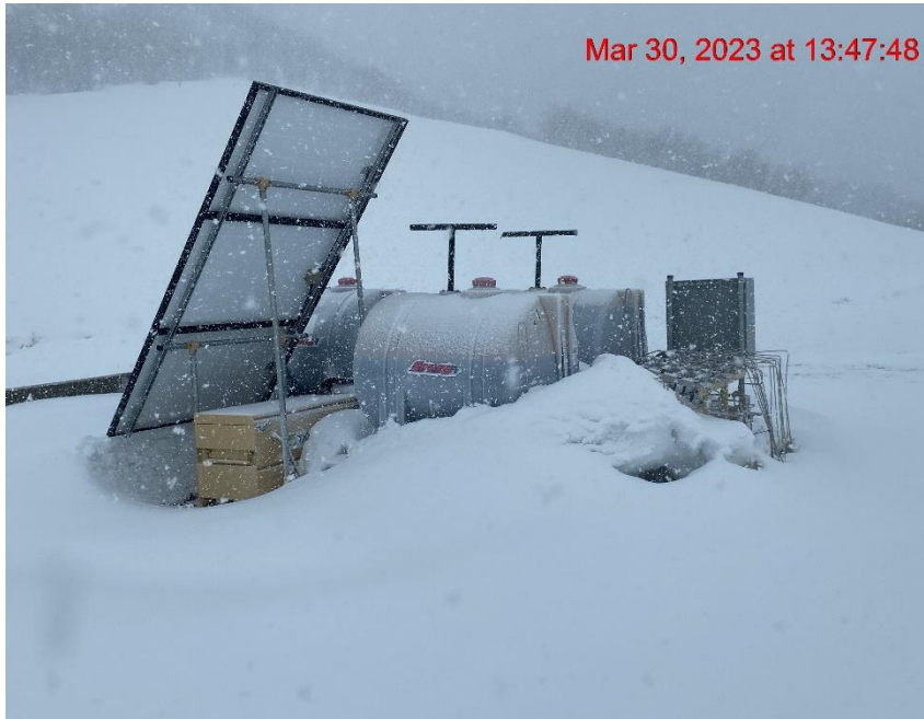
Inadequate Chemical Secondary Containment – Photo #01786