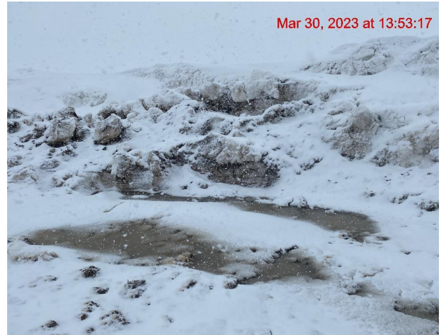
Degradation/Sediment Transport – Photo #01794