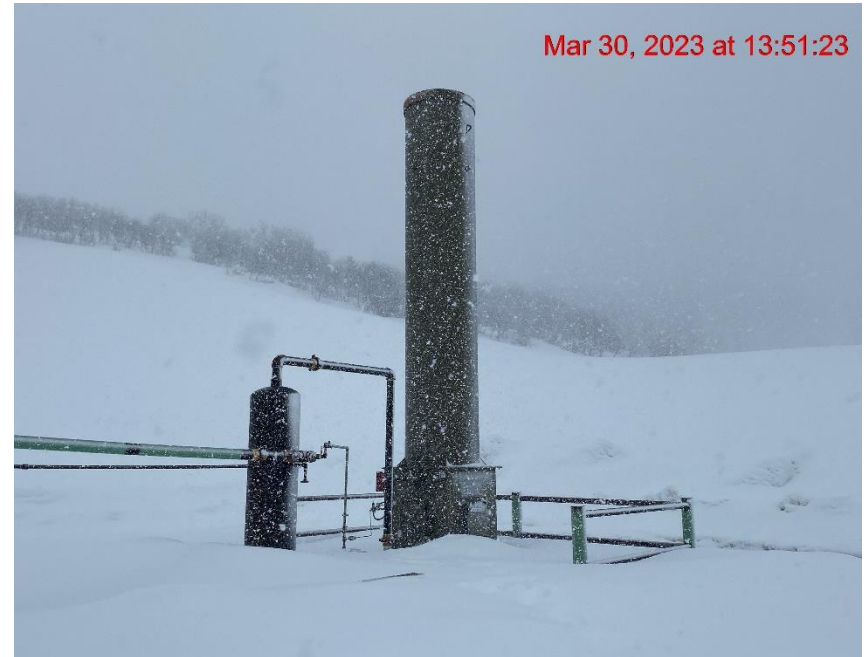
ECD – Photo #01790