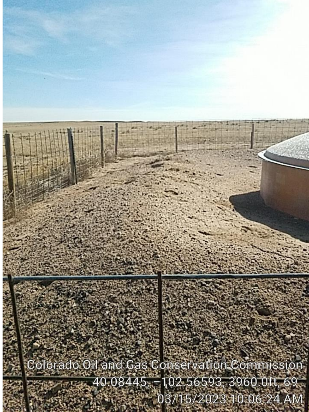
Animal holes in berms.

Colorado Oil and Gas Conservation Commission 40.08445, -102.56593, 3960.0ft, 69° 03/15/2023 10:06:24 AM