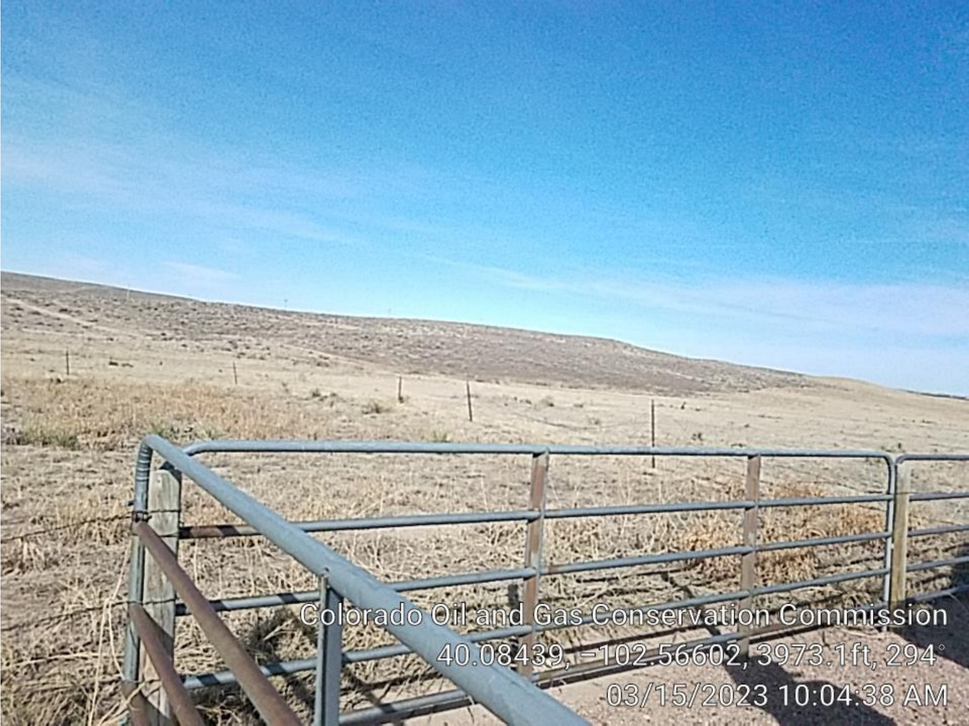
Fenced off, reclaimed area north of well.

Colorado Oil and Gas Conservation Commission 40.08439, -102.56602, 3973.1ft, 294° 03/15/2023 10:04:38 AM