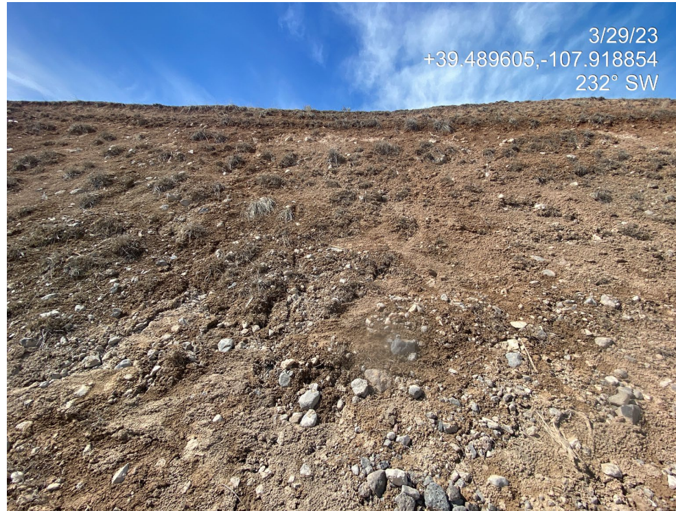
Photo 6. Photos show two large rills becoming gullies (left) and rill erosion and widespread pedestaling (right) on the western cut slope.