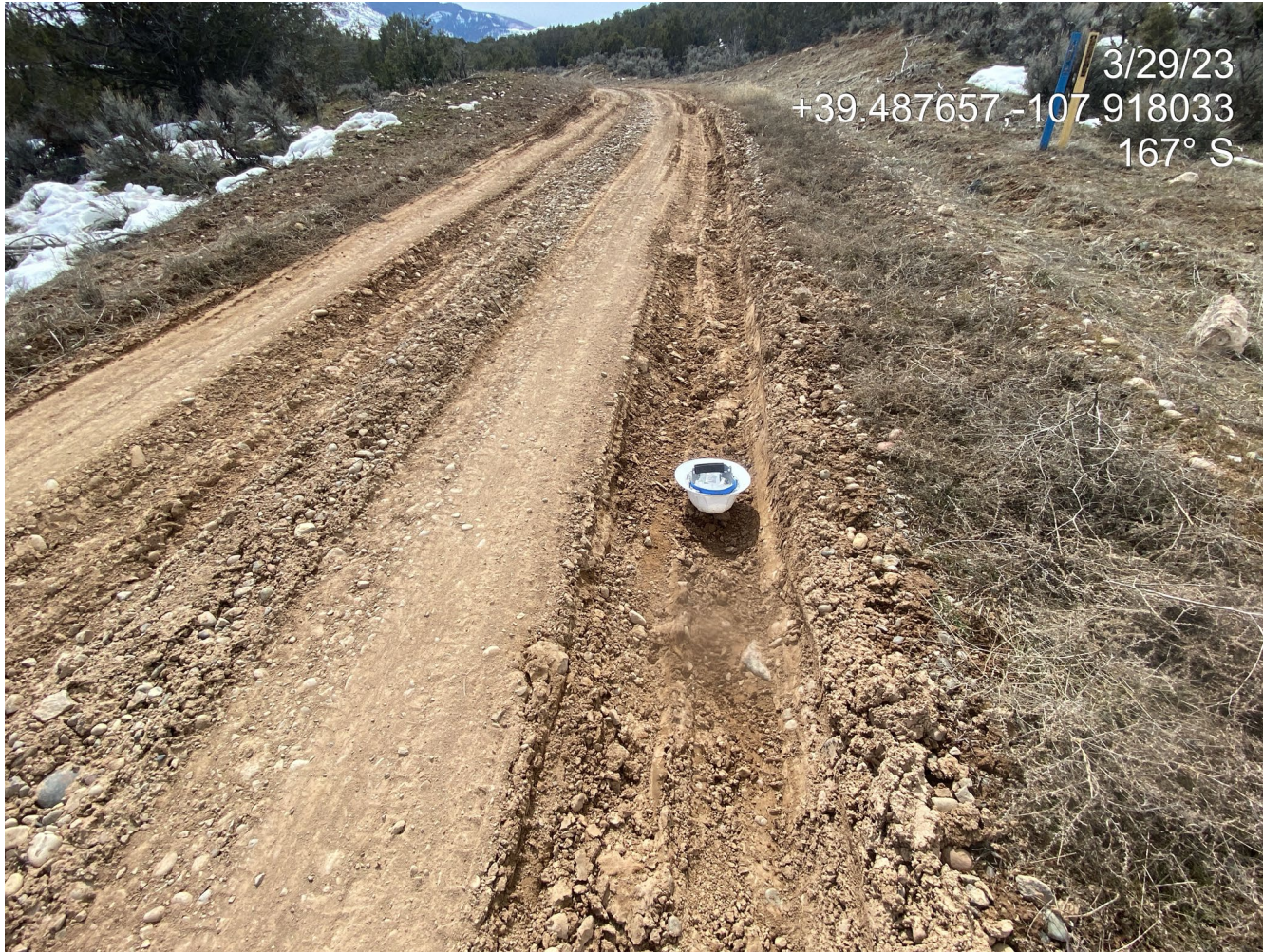
Photo 4. Photo shows lack of stabilization on the access road to the south of the location.