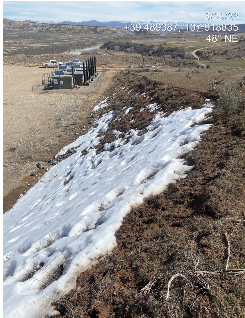
Photo 8. Photo shows an overview of the cut slope at the south of the location.