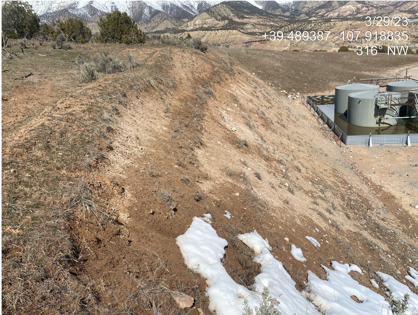
Photo 5. Photo shows an overview of the cut slope at the west of the location.