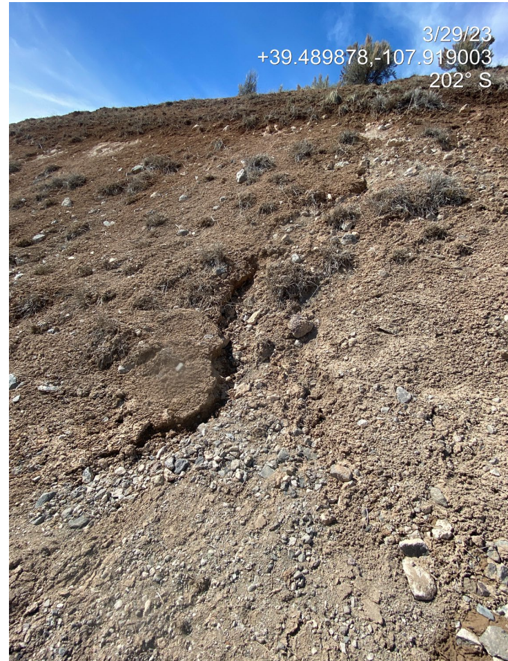
Photo 7. Photos taken to the west of the battery show the cut slope on 9/30/2021 (left) and on 3/29/23 (right). Erosion has progressed to form a large rill on the slope. Note three sagebrush at top of slope for reference.