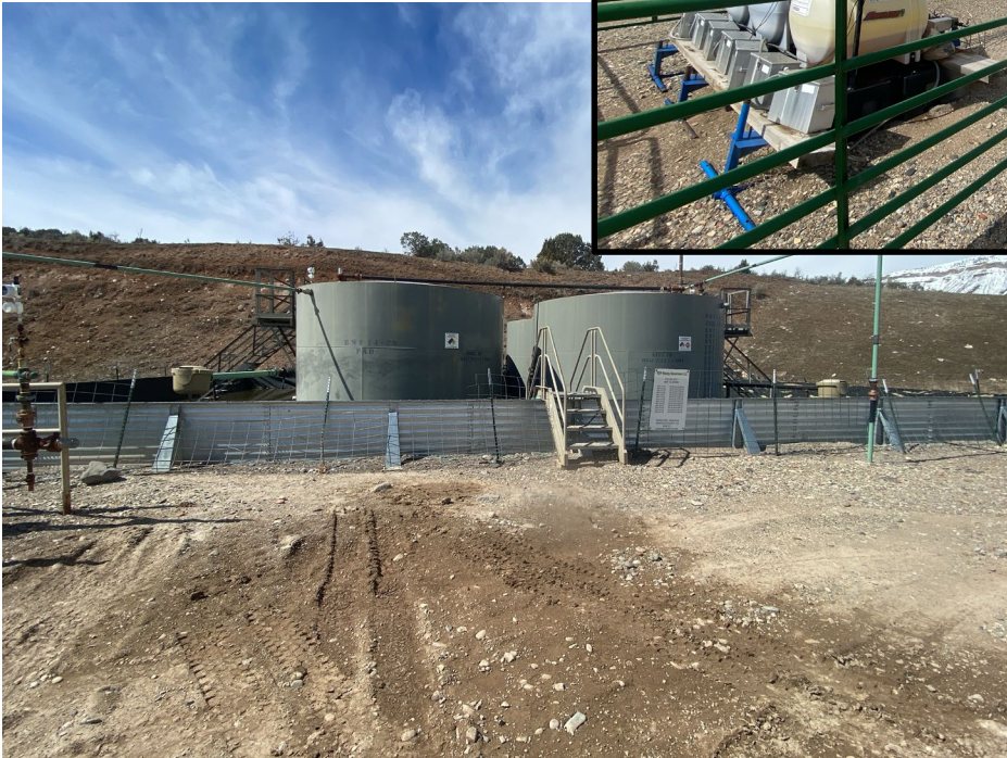
Photo 2. Photos show production areas.