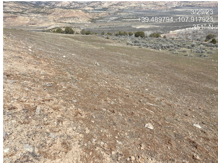
Photo 10. Photos show interim areas to the west (left) and east (right).