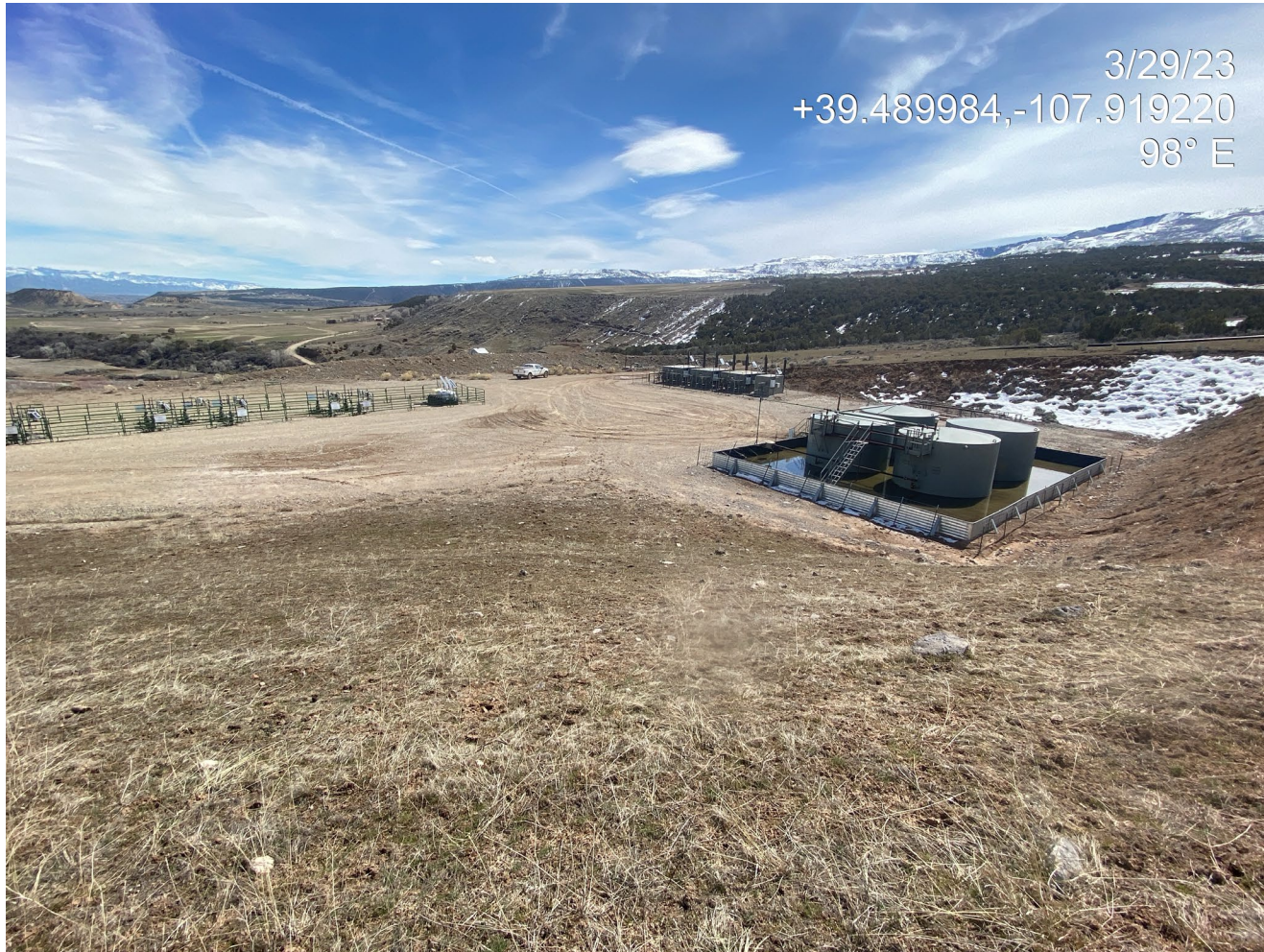
Photo 1. Photo taken from the west shows an overview of the location.