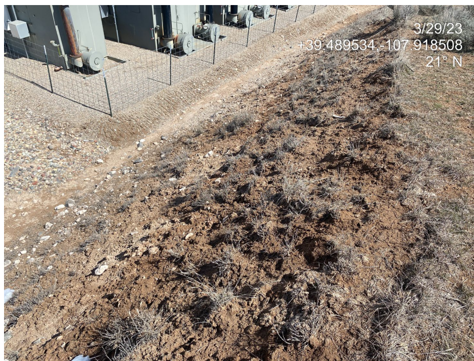
Photo 9. Photos show pedestal erosion throughout the cut slope at the south of the location.