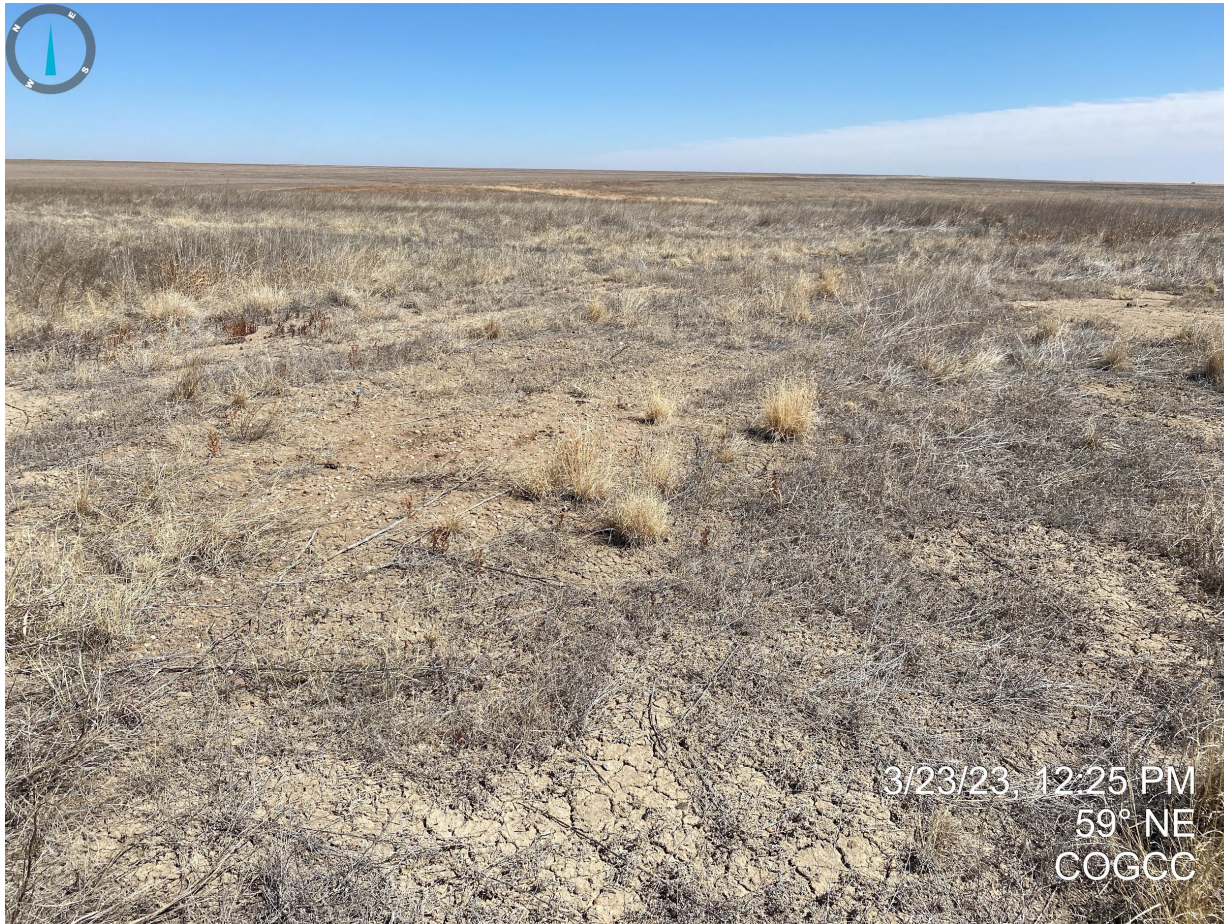
Photo 12. Facing northeast from the PA well. Photo illustrates that road base/gravel remain on location and presence of undesirable vegetation (e.g. kochia).