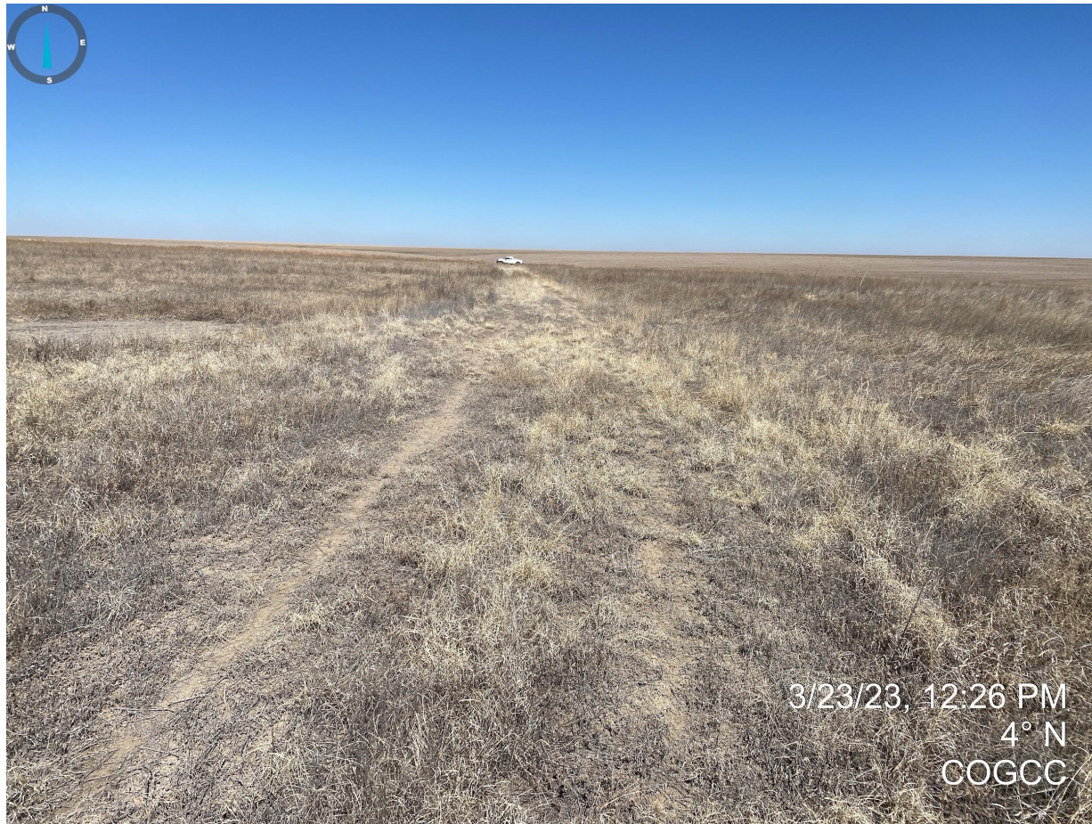
Photo 14. Facing north from PA well; access road has not been reclaimed.