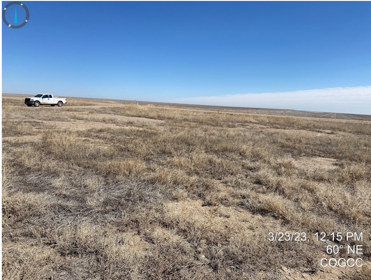
Photo 5. Facing northeast from the center/western portion of the location. Overview of location with presence of undesirable vegetation and bare areas where road base/gravel remains.