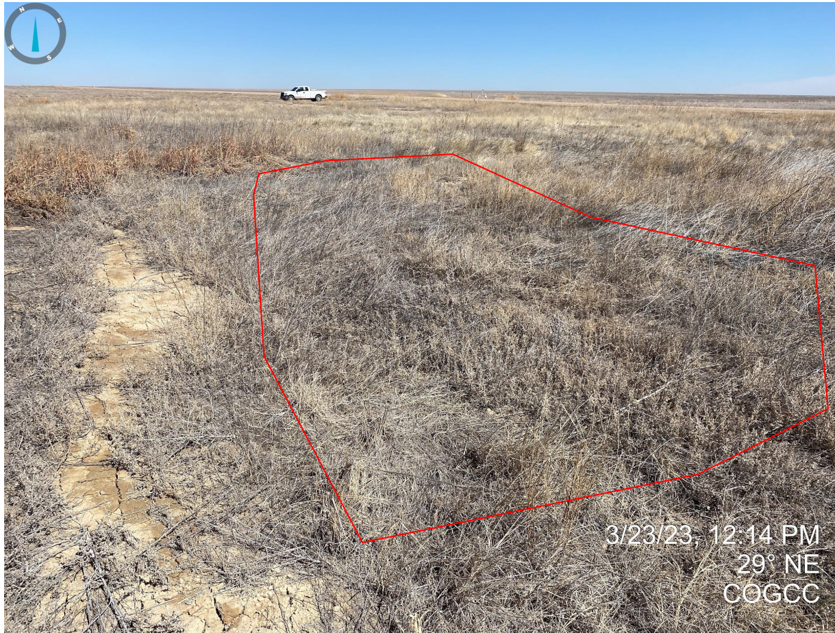
Photo 4. Facing northeast from the southwestern portion of the location. Photo illustrates subsidence (red) and presence of undesirable vegetation (e.g. kochia) observed near the former tank location.