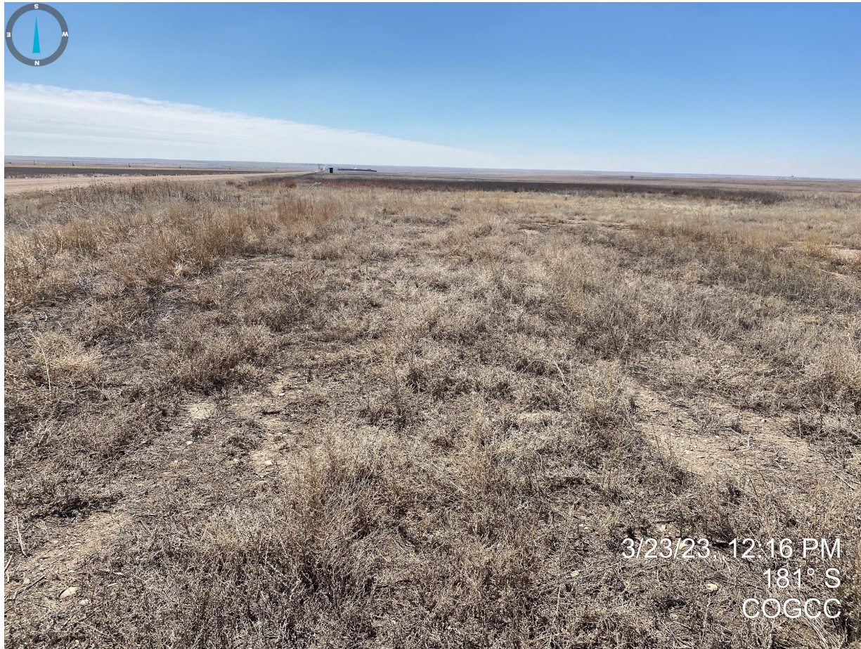
Photo 7. Facing south from approximate center of location. Location is predominantly undesirable vegetation (e.g. kochia).