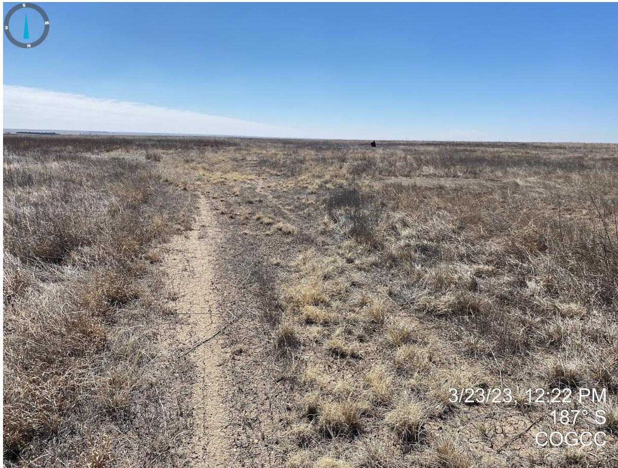
Photo 8. Facing south near PA well API 063-06192. Photo illustrates that the access road to the well has not been reclaimed with the presence of road base and gravel throughout.