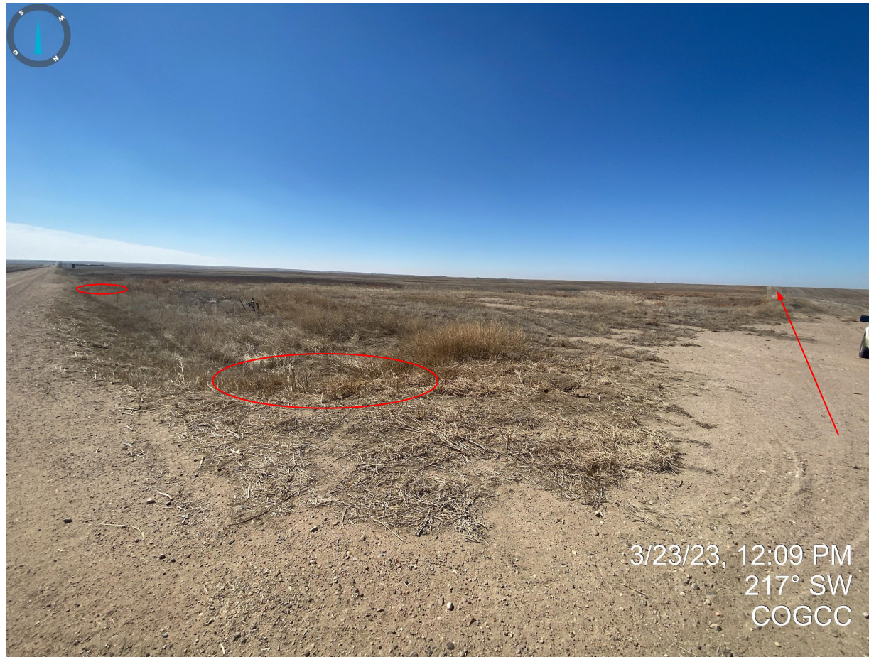
Photo 1. Facing southwest at location entrance. Photo provides an overview of the location in its present state, at the time of inspection. It does not appear any reclamation work has been attempted since the last inspection on 08/28/2019 (Doc #696200704). Culvert and access road remain, highlighted in red.