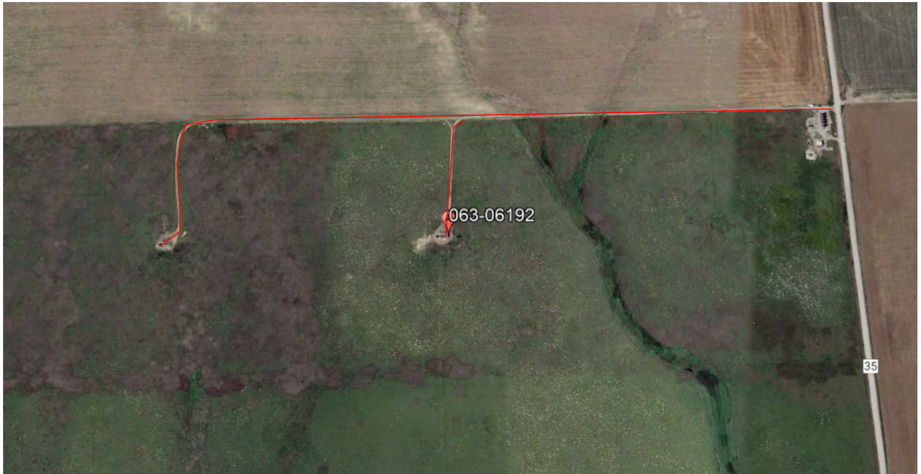
Photo 15. Google Earth aerial imagery illustrating the access roads (red) that remain and will need to be reclaimed per Rule 1004. Previous inspection (Doc #696200704) provided photos showing that the lease/access road did not exist pre-oil and gas development.