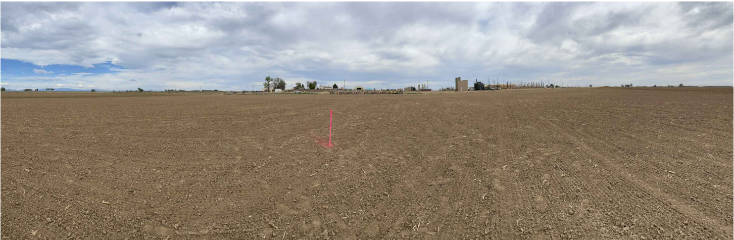
SOUTH VIEW (PANORAMIC)