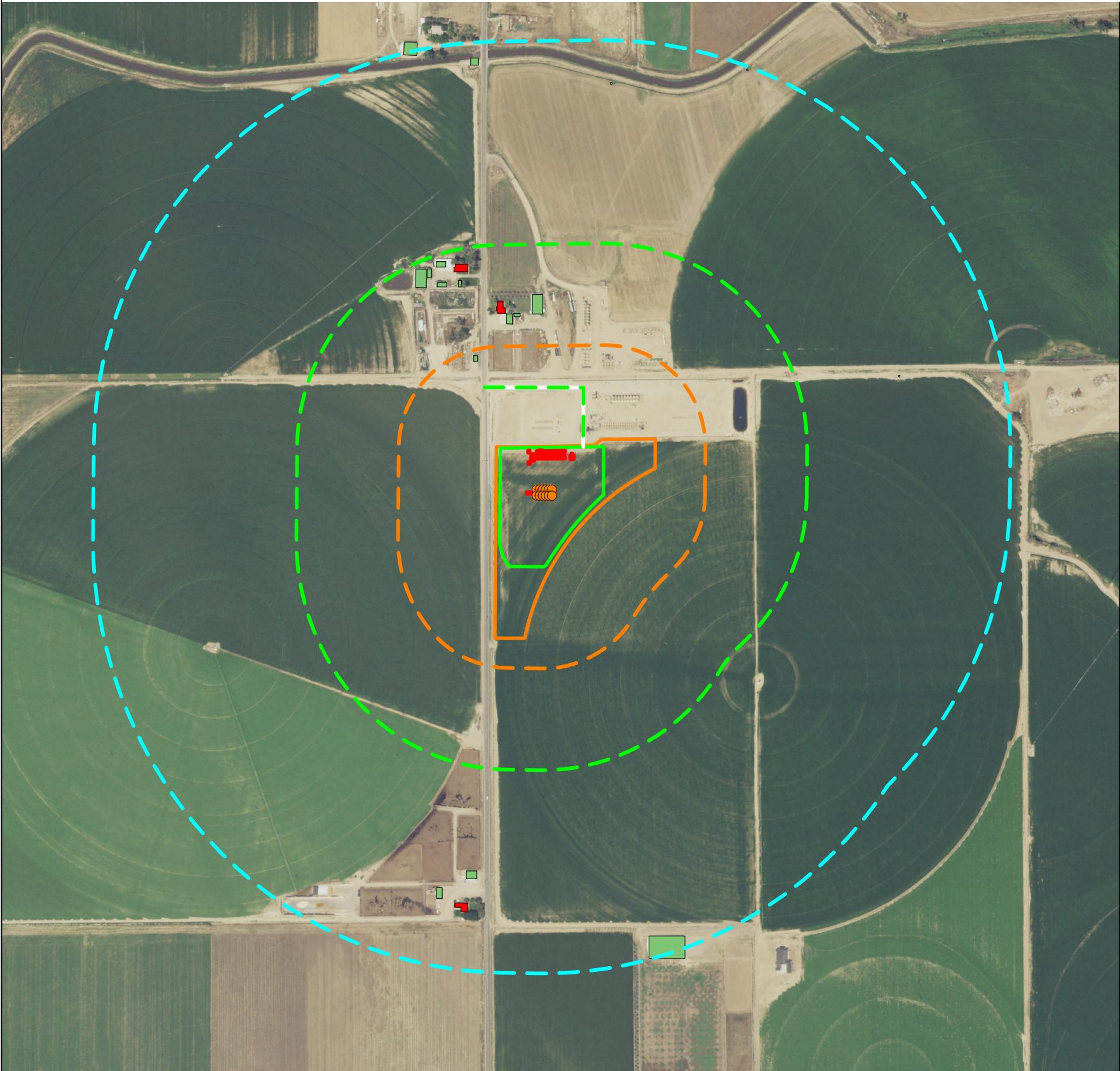
CULTURAL TABLE: (NUMBER OF FEATURES FOUND WITHIN EACH RADIUS AS MEASURED FROM THE WORKING PAD SURFACE)