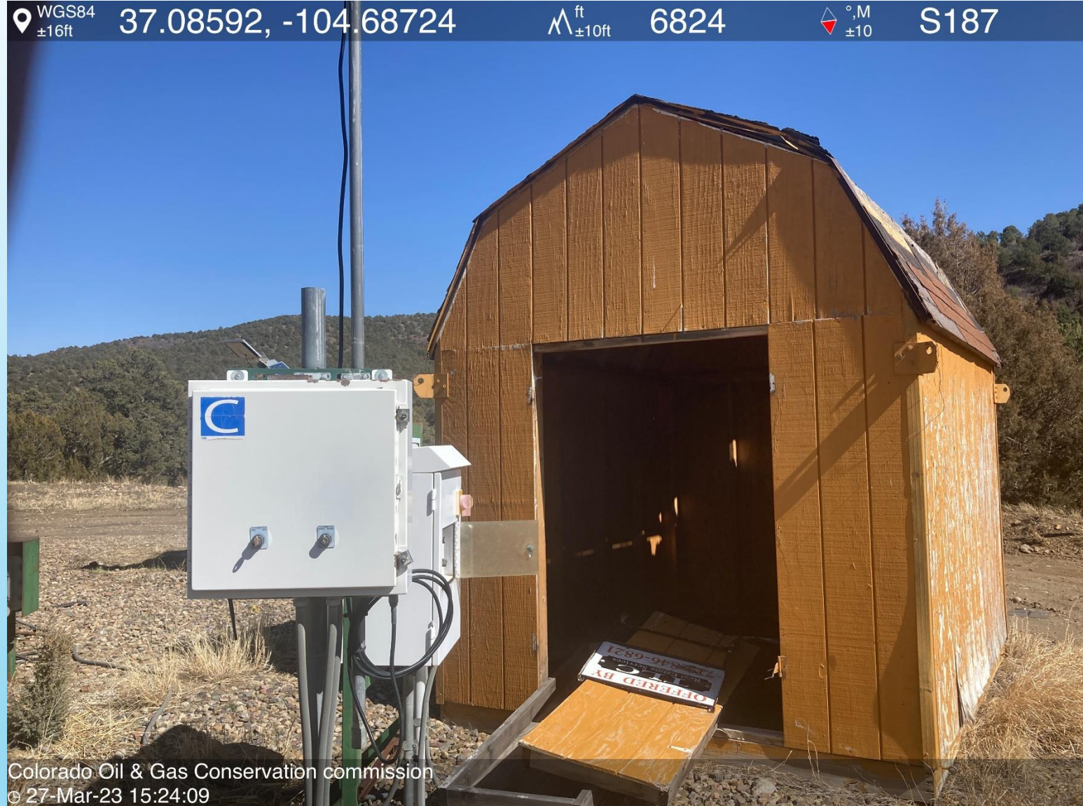
Colorado Oil & Gas Conservation commission © 27-Mar-23 15:24:09