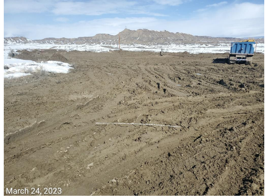
Photo 1: Photos 1-5 provide examples showing BMPs to stabilize, as well as to minimize degradation, tracking and off-site sediment transport remain missing or insufficient. 6 foot measuring stick for reference.