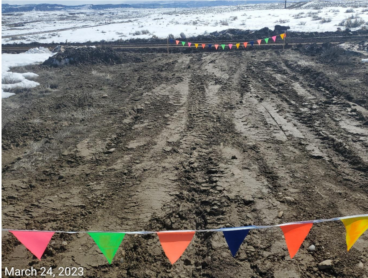
Photo 12: Photo shows the 2 nd point of access that was developed due to off-site vehicle travel from the Location/access road. Photo shows Operator has placed fencing at the disturbance to prevent further offsite travel.