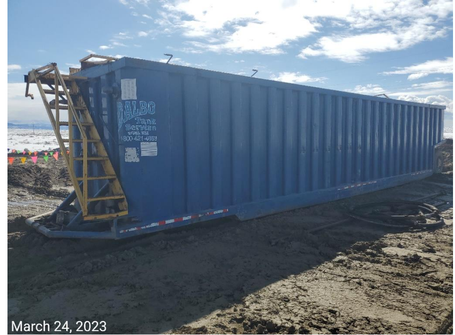
Photo 3: See comments under photo 1. Photo also shows an additional tank not previously observed has been brought onto the Location; tank missing signage per Rule 605.h.