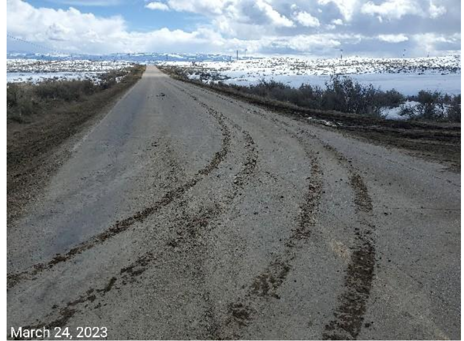
Photo 6: See comments under photo 1. Photo shows tracking/rutting and off-site sediment transport onto Highway 64 from the access road has continued