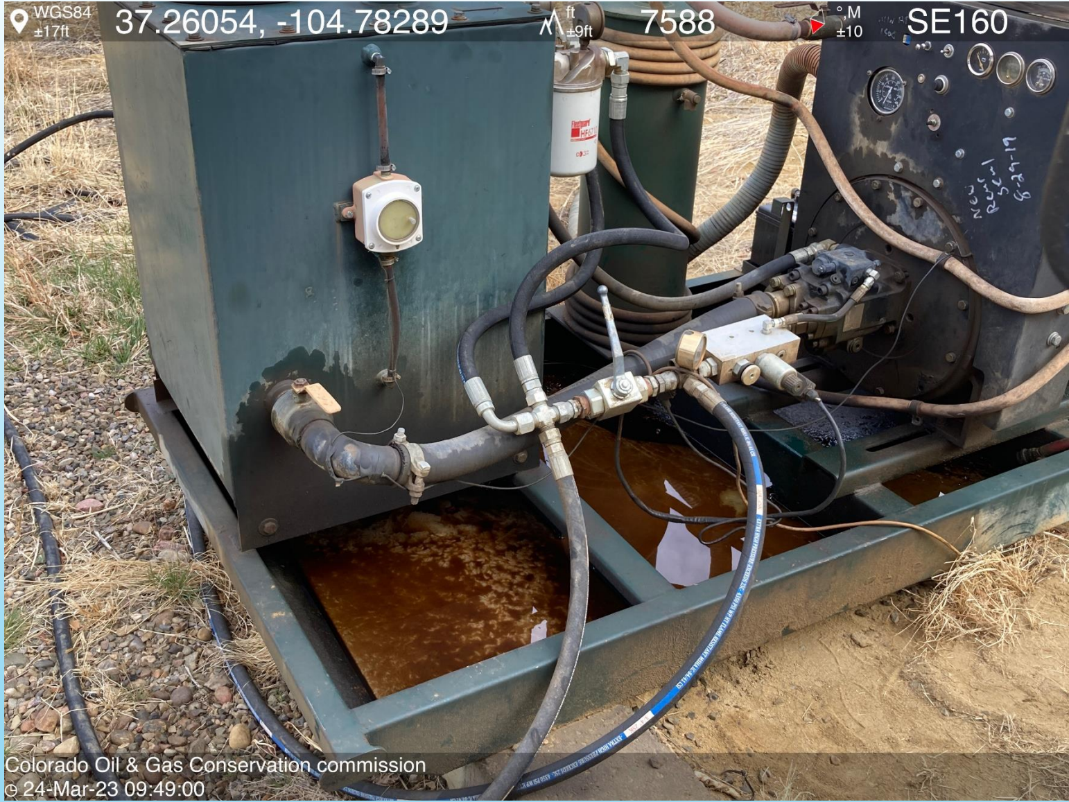
Colorado Oil & Gas Conservation commission © 24-Mar-23 09:49:00