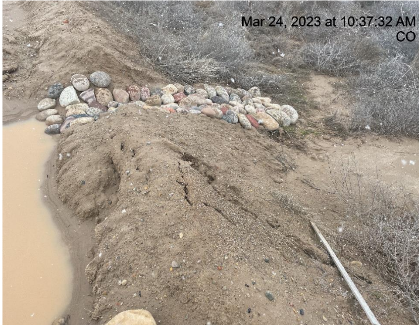
Photo # 3135 Tunnel erosion through berm & transport of sediment off location (east side of pad)