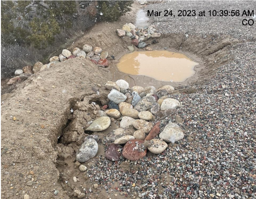
Photo # 3149 Sediment Trap needs maintenance (east side of location)