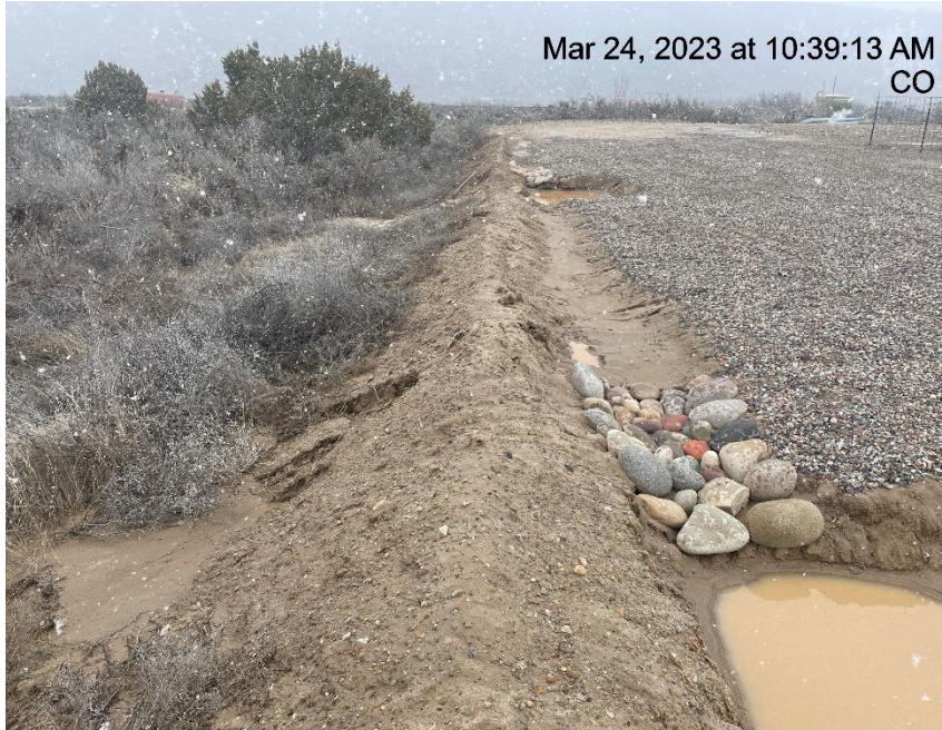
Photo # 3146 Tunnel erosion through berm & transport of sediment off location (east side of pad)