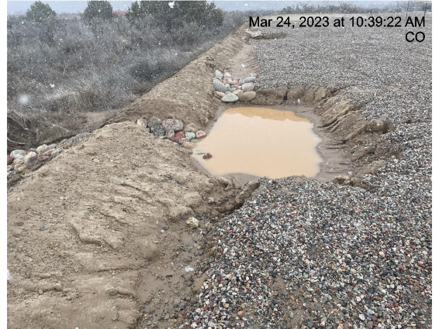
Photo # 3147 Sediment Trap needs maintenance (east side of location)