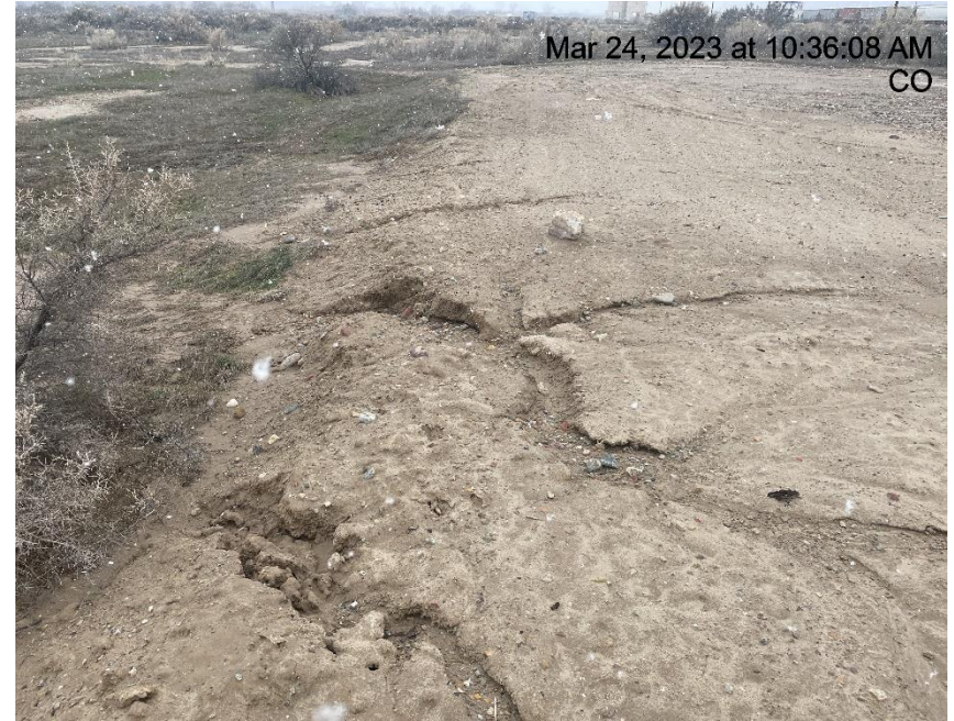
Photo # 3128 Rill erosion/transport of sediment off location (south side of pad)