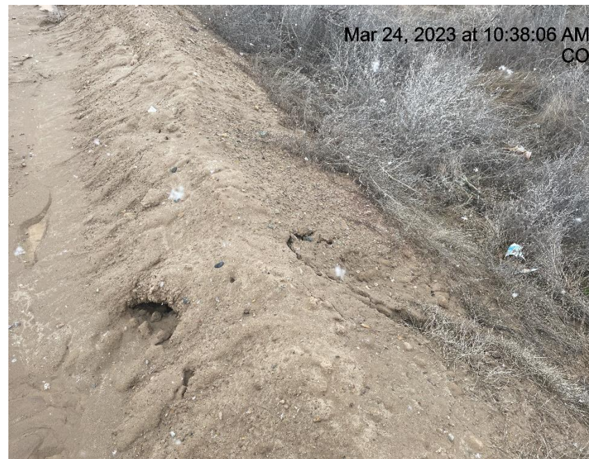
Photo # 3139 Tunnel erosion through berm & transport of sediment off location (east side of pad)