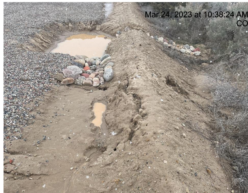
Photo # 3141 Tunnel erosion through berm & transport of sediment off location (east side of pad)