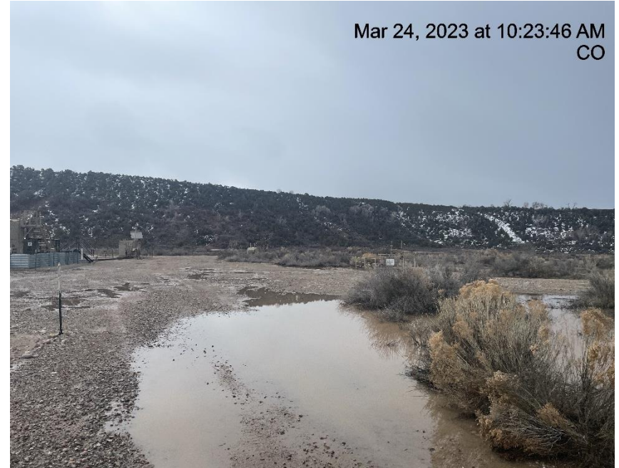
Photo # 3109 Insufficient run on controls/BMP's (Access road & entrance to location)