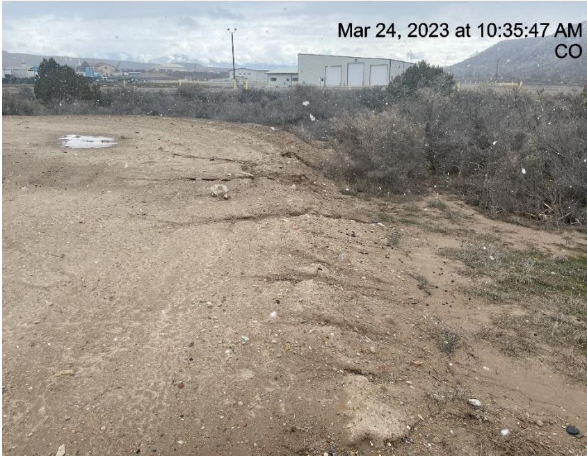
Photo # 3127 Rill erosion/transport of sediment off location location (south side of pad)