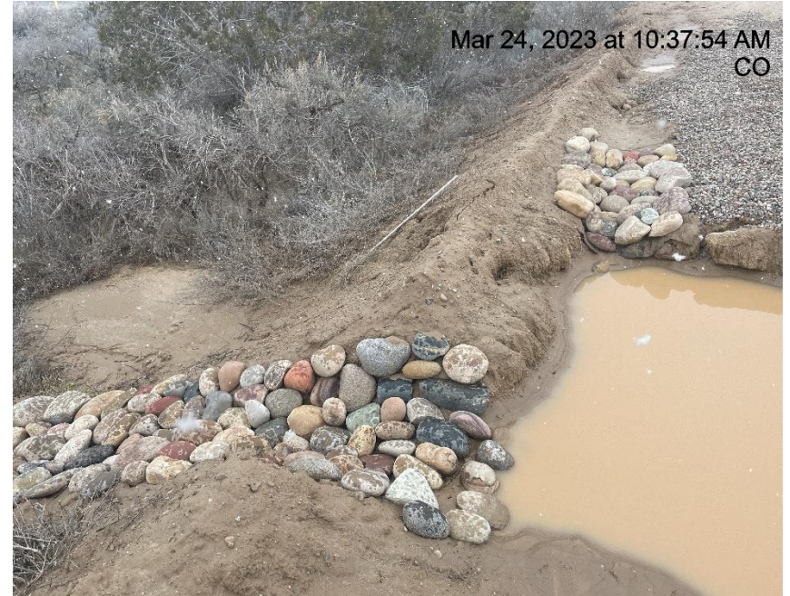
Photo # 3137 Tunnel erosion through berm & transport of sediment off location (east side of pad)