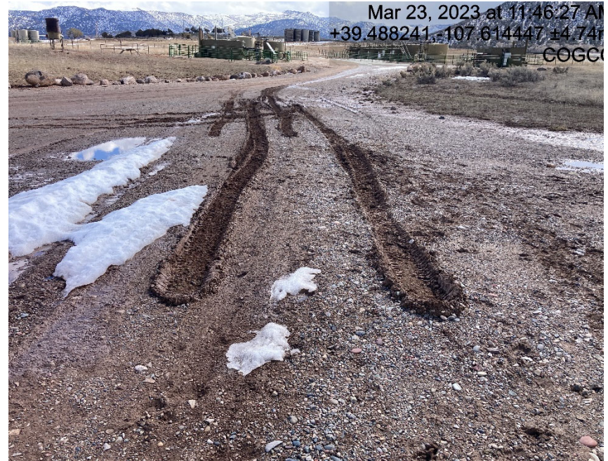
Lack of stabilization/compaction