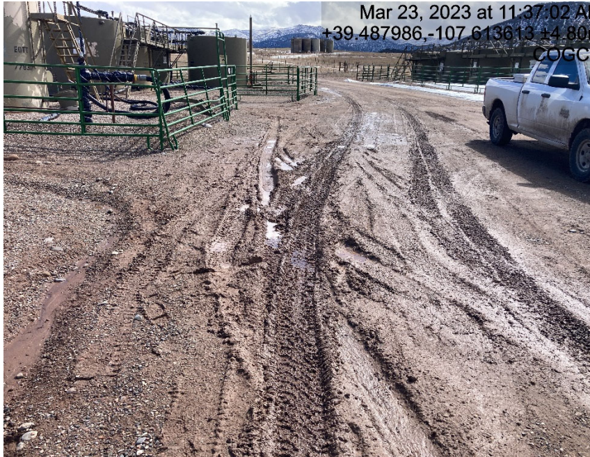
Lack of stabilization/compaction