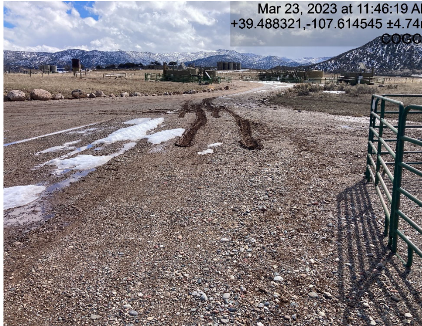
Lack of stabilization/compaction