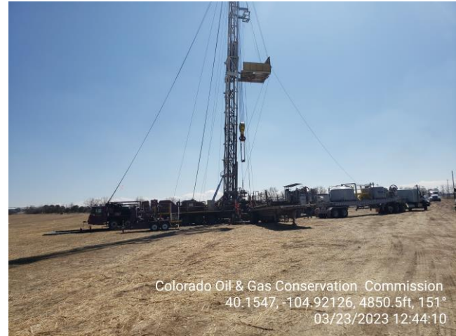
Photo 1 Location entrance.