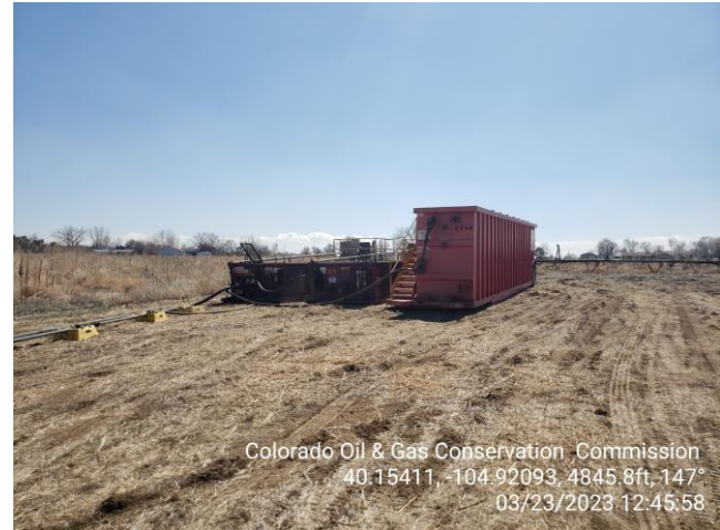
Photo 5 Nextier Cement Equip., water truck.