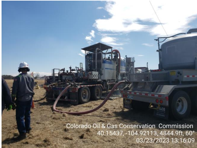
Photo 9 Nextier Cement pump.