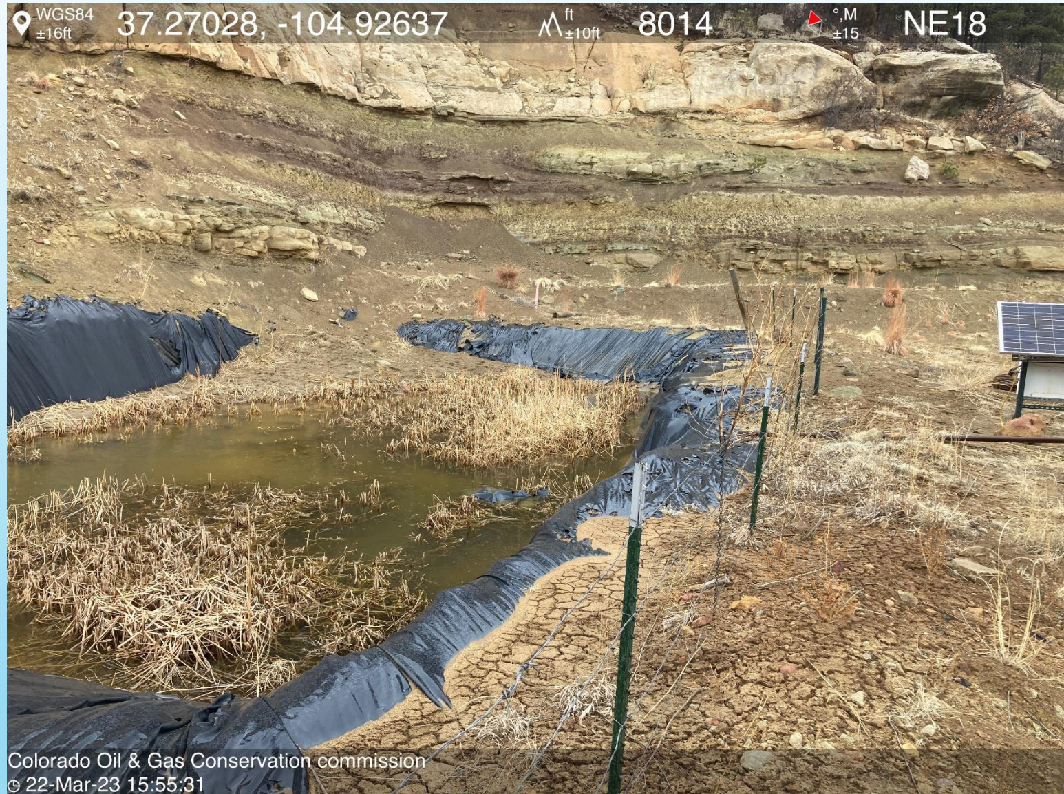
PHOTO 6: ANOTHER IMAGE OF DETERIORATING LINER NOTED IN PREVIOUS SLIDE.