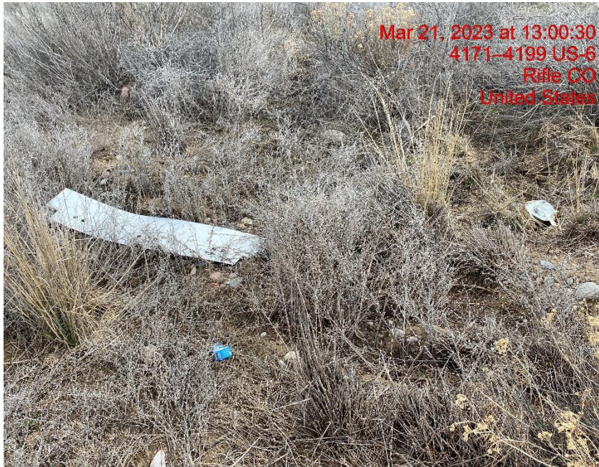
Trash – Photo #01499