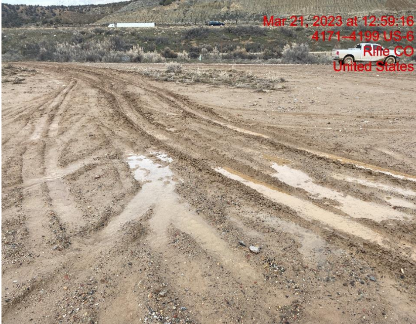
Lack of Stabilization – Photo #01497