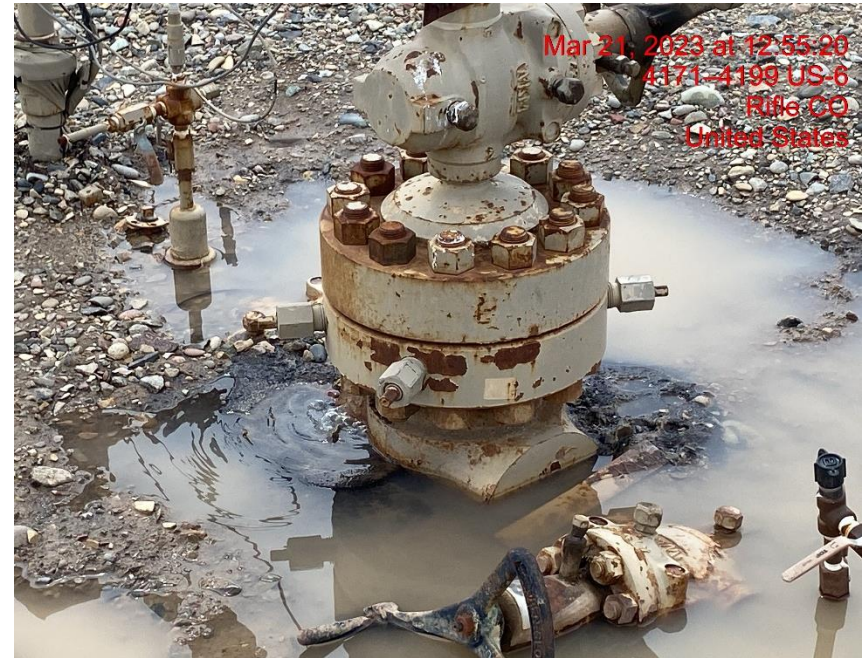
Casing Flange Leak – Photo #01494