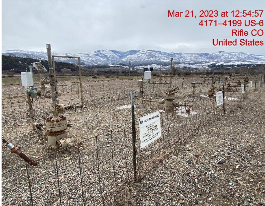
Wellheads – Photo #01493