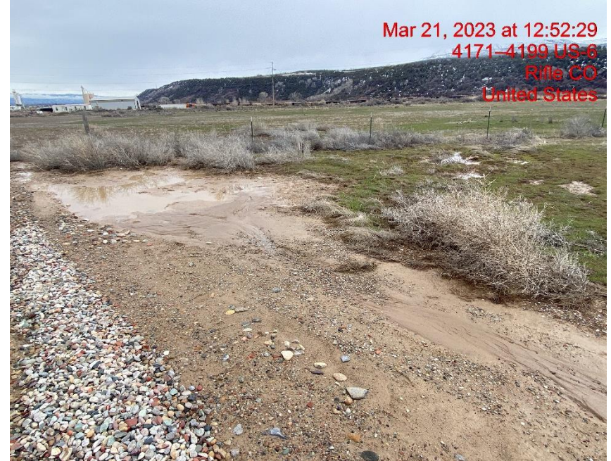
Transport of Sediment – Photo #01492