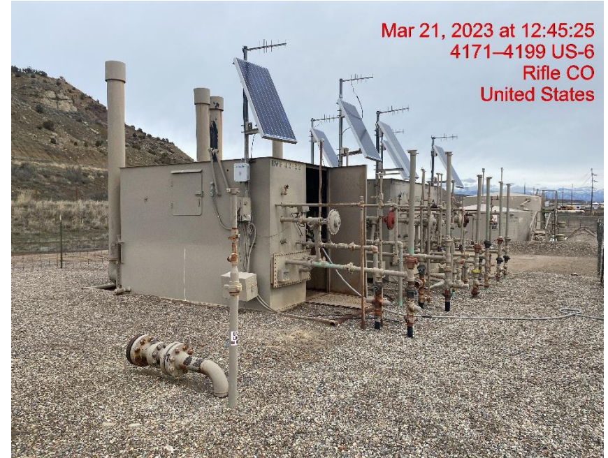
Separators – Photo #01485