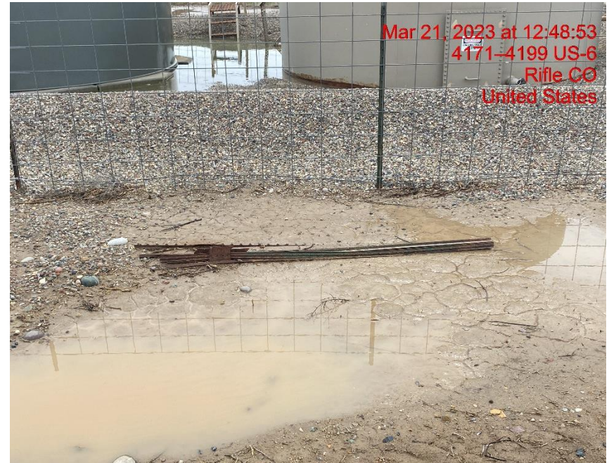
Debris – Photo #01488