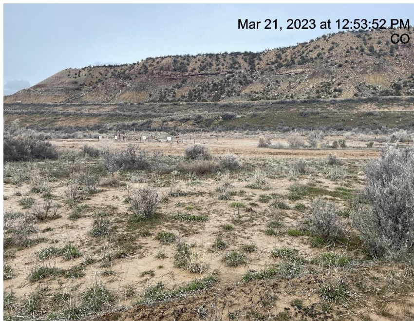
Photo # 2787 Sediment encroaching on & choking off vegetation (S/SE area of location)