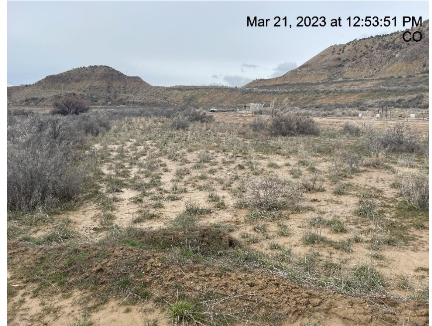
Photo # 2786 Berm needs maintenance/sediment encroaching on & choking off vegetation (S/SE area of location)