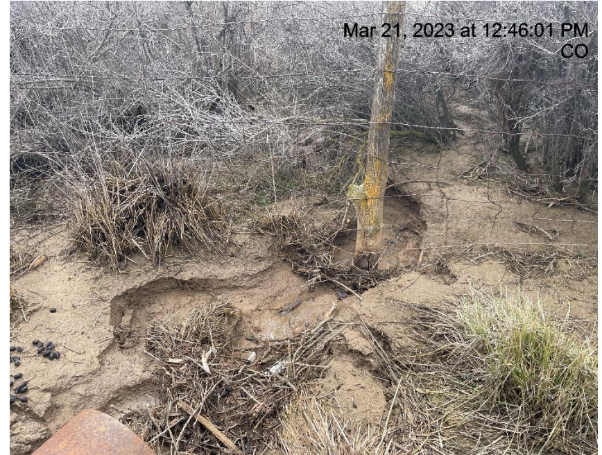
Photo # 2762 Gully erosion at culvert insufficient BMP's (Culvert is near entrance to location)