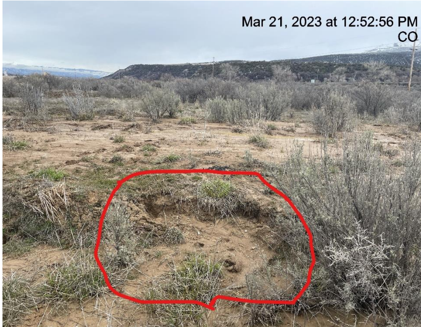
Photo # 2781 Berm needs maintenance/sediment encroaching on & choking off vegetation (S/SE area of location)