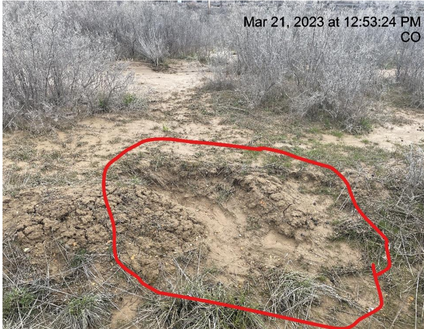
Photo # 2784 Berm needs maintenance/sediment encroaching on & choking off vegetation (S/SE area of location)