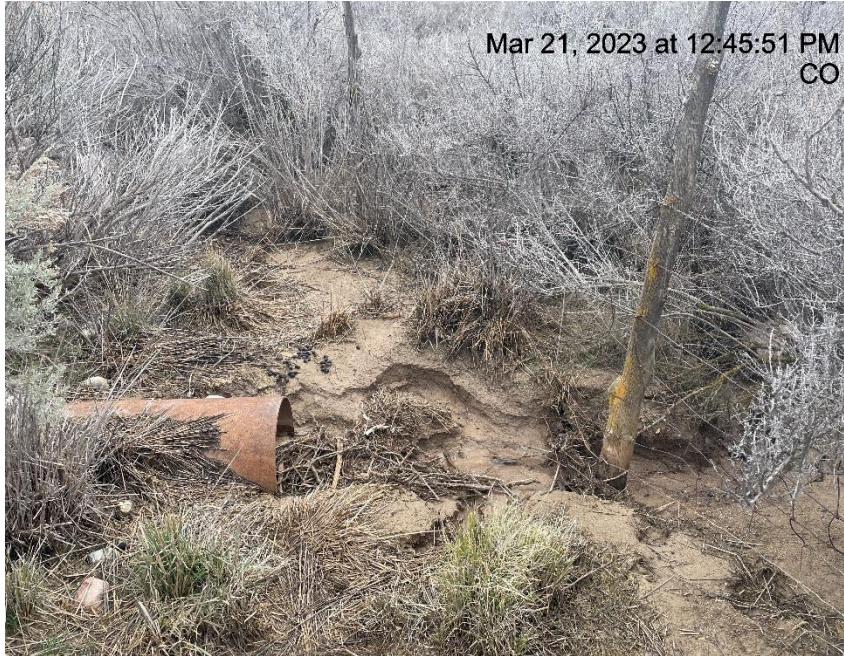
Photo # 2761 Culvert needs maintenance (Culvert is near entrance to location)