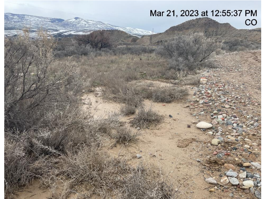
Photo # 2793 Transport of sediment off location/encroaching on & choking off vegetation (south side of location)