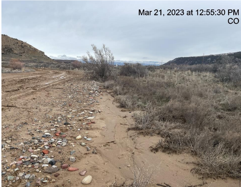
Photo # 2792 Rill erosion & transport of sediment off location (South side of location)