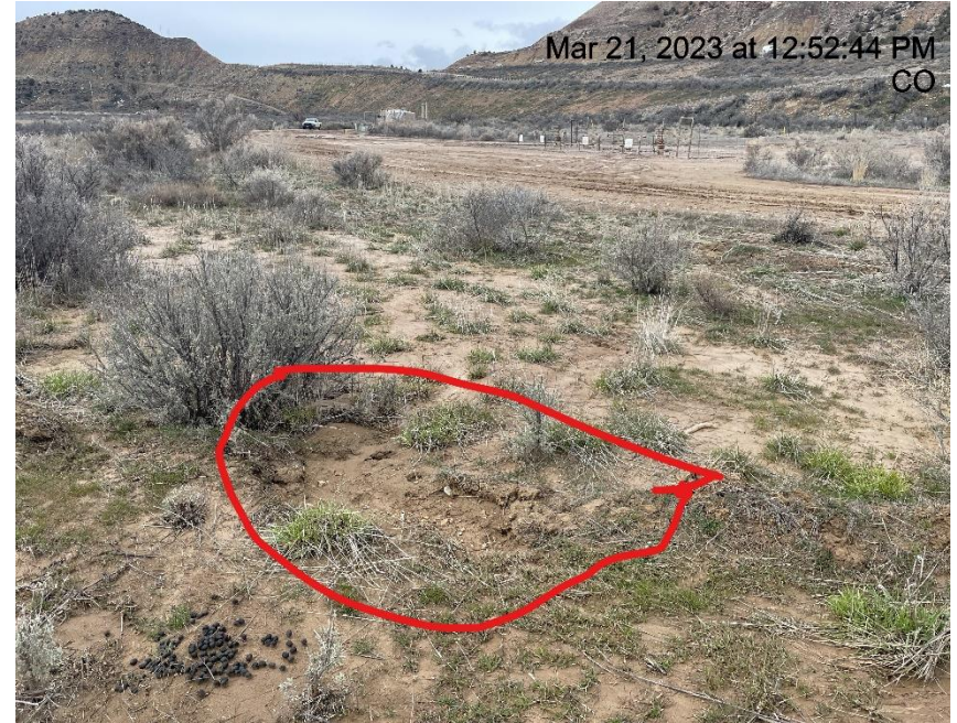
Photo # 2780 Berm needs maintenance/sediment encroaching on & choking off vegetation (S/SE area of location)