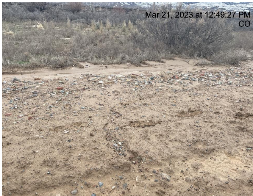
Photo # 2770 Rill erosion & transport of sediment off location (south side of location)