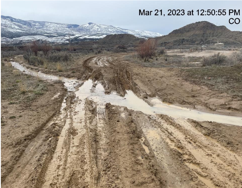
Photo # Degradation of roadway/insufficient BMP's (east side of location)