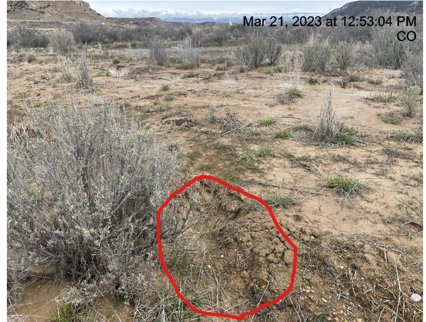
Photo # 2782 Berm needs maintenance/sediment encroaching on & choking off vegetation(S/SE area of location)