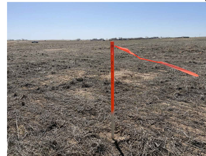
VIEW 4 — SOUTHEAST