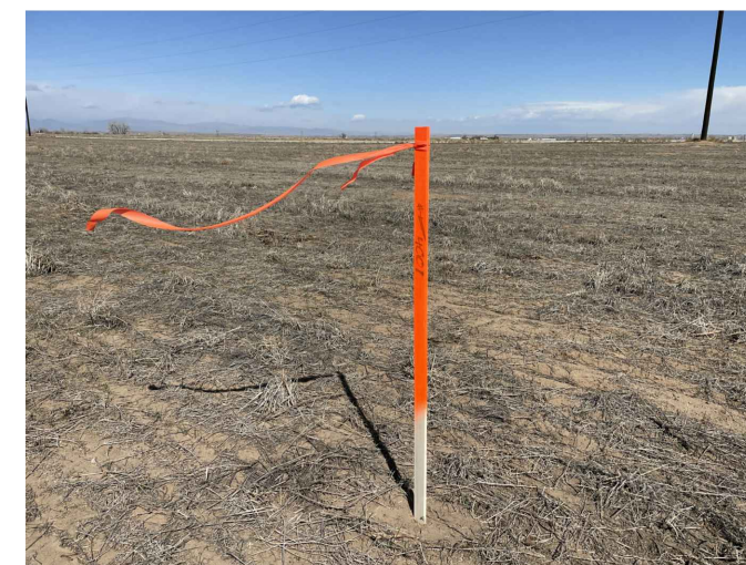
VIEW 8 — NORTHWEST