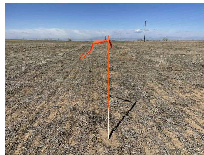
VIEW 7 — WEST