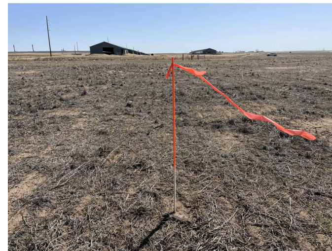
VIEW 3 — EAST