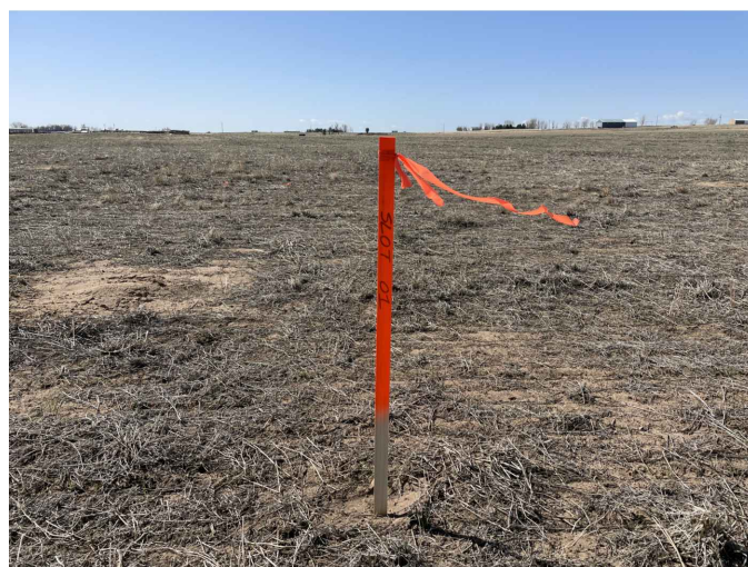
VIEW 5 — SOUTH