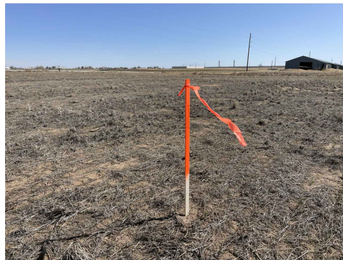
VIEW 2 — NORTHEAST