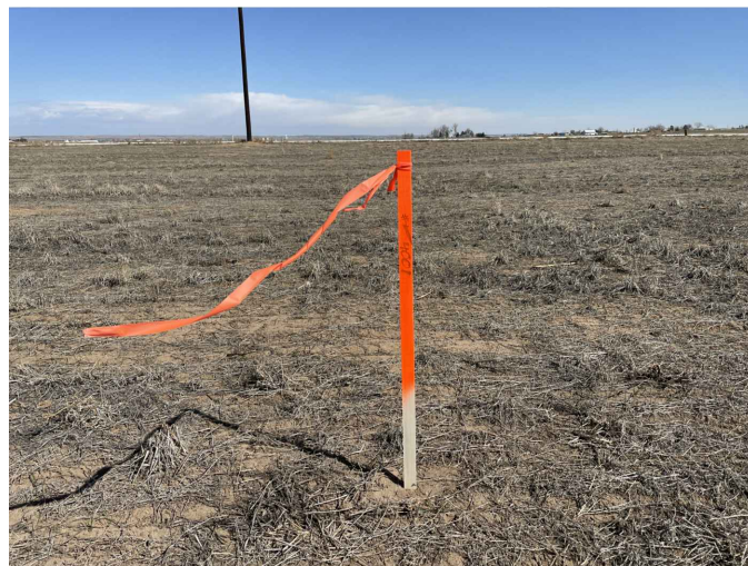
VIEW 1 — NORTH

Q: E2SW4, W2SE4 SECTION: 3 TOWNSHIP: 3N RANGE: 66W 6TH. P.M. WELD COUNTY, CO DATE: 4/15/2022