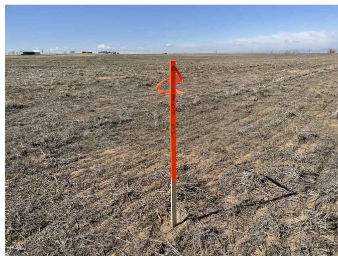
VIEW 6 — SOUTHWEST