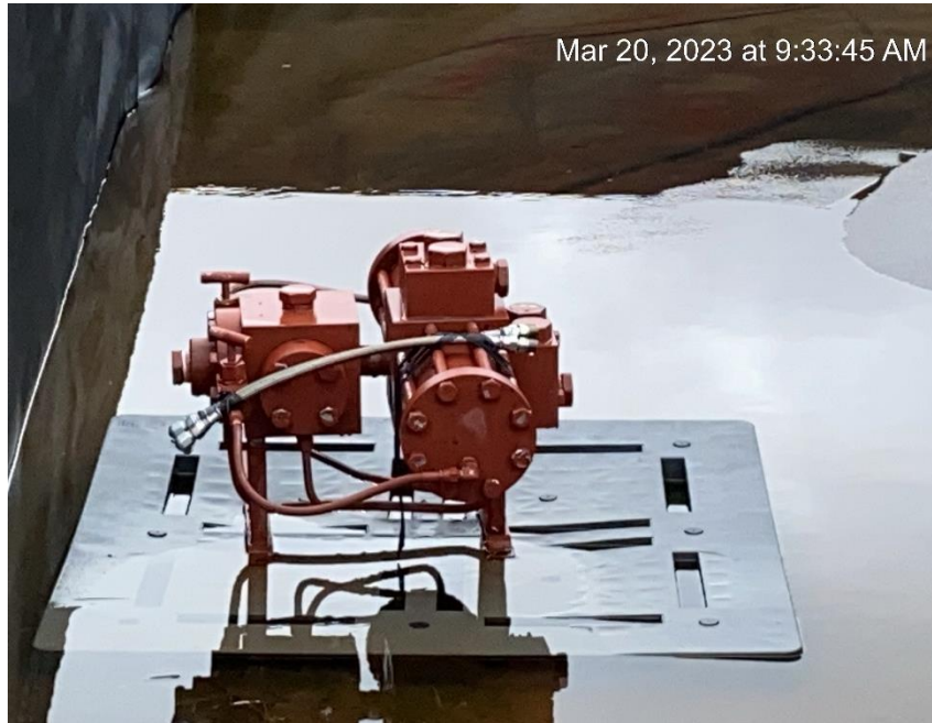
Unused equipment inside Dehy containment