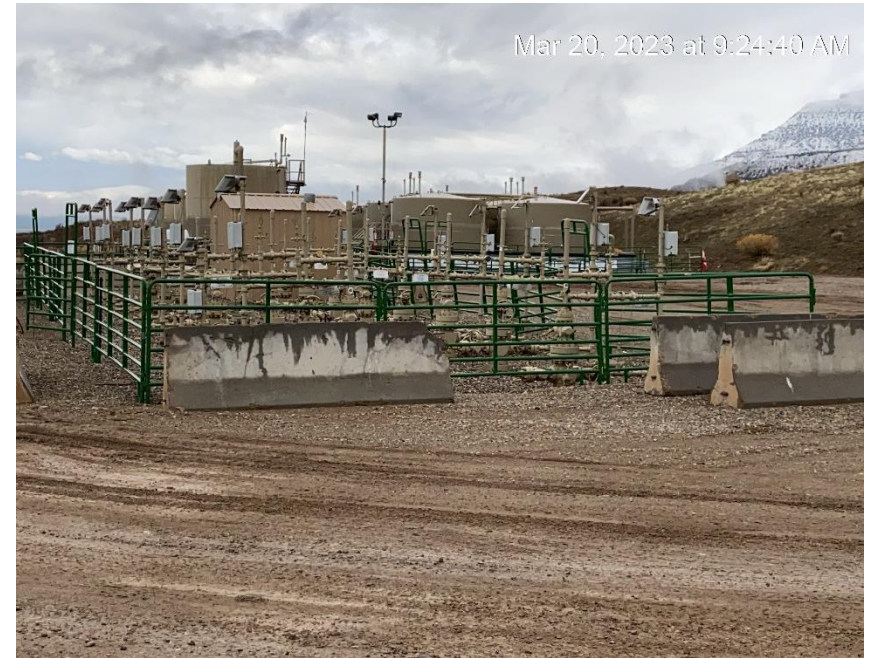
Middle of location looking West