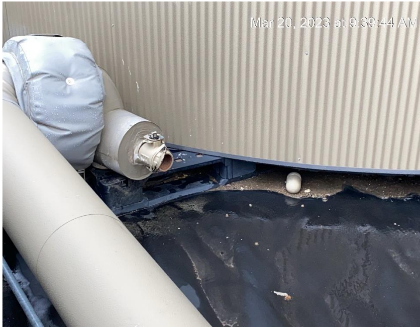
Debris. Open end tank valve.