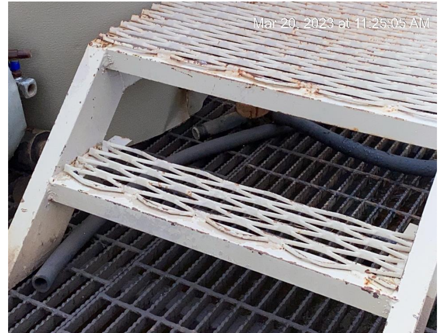
Debris at filter skid.