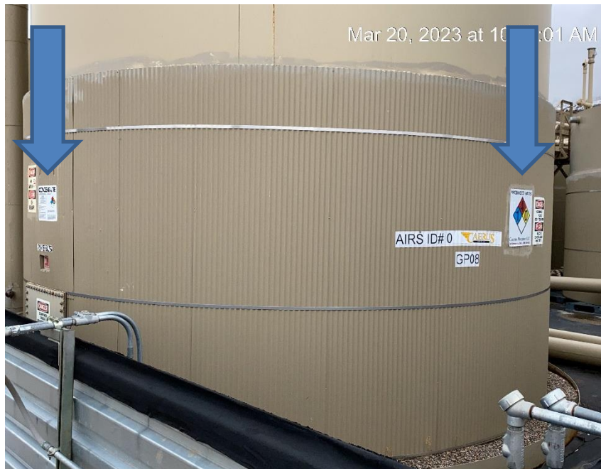
Condensate or Produced Water? Conflicting labels