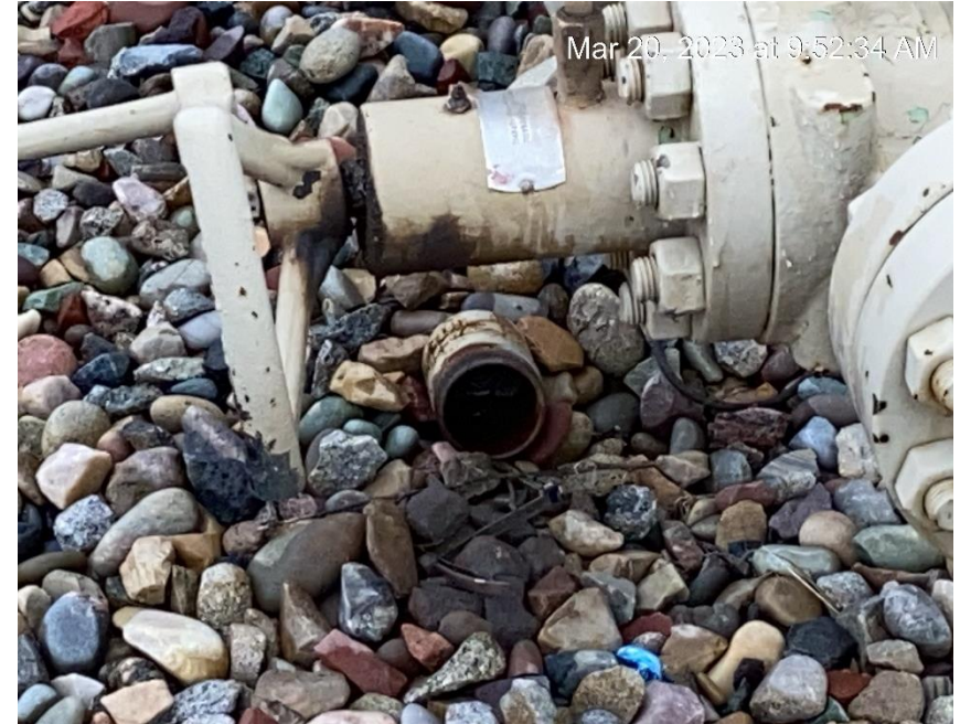
Debris at wellhead