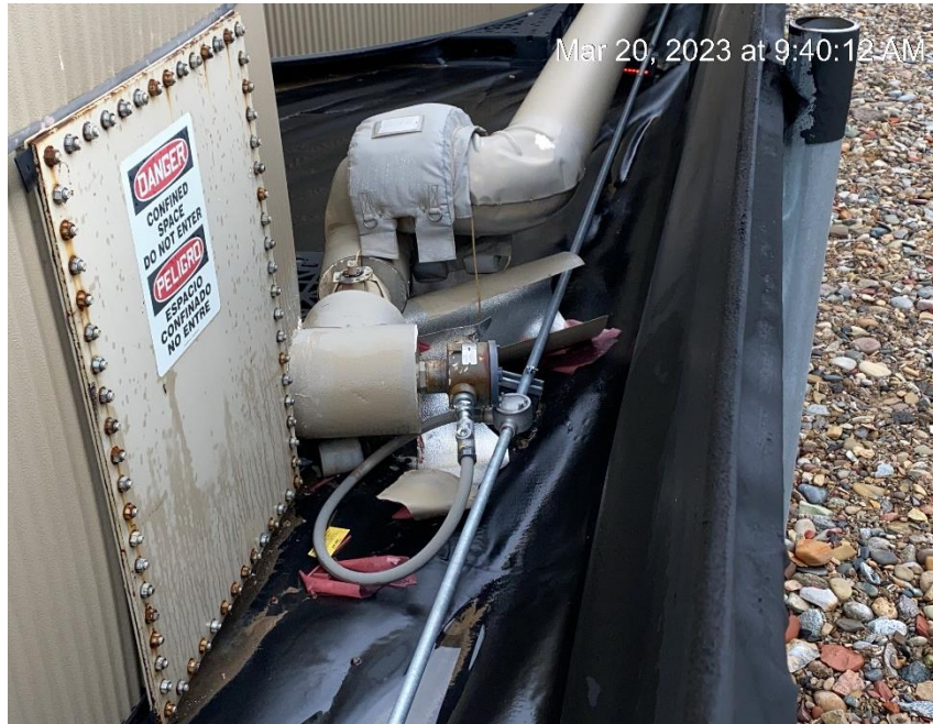
Debris inside tank containment