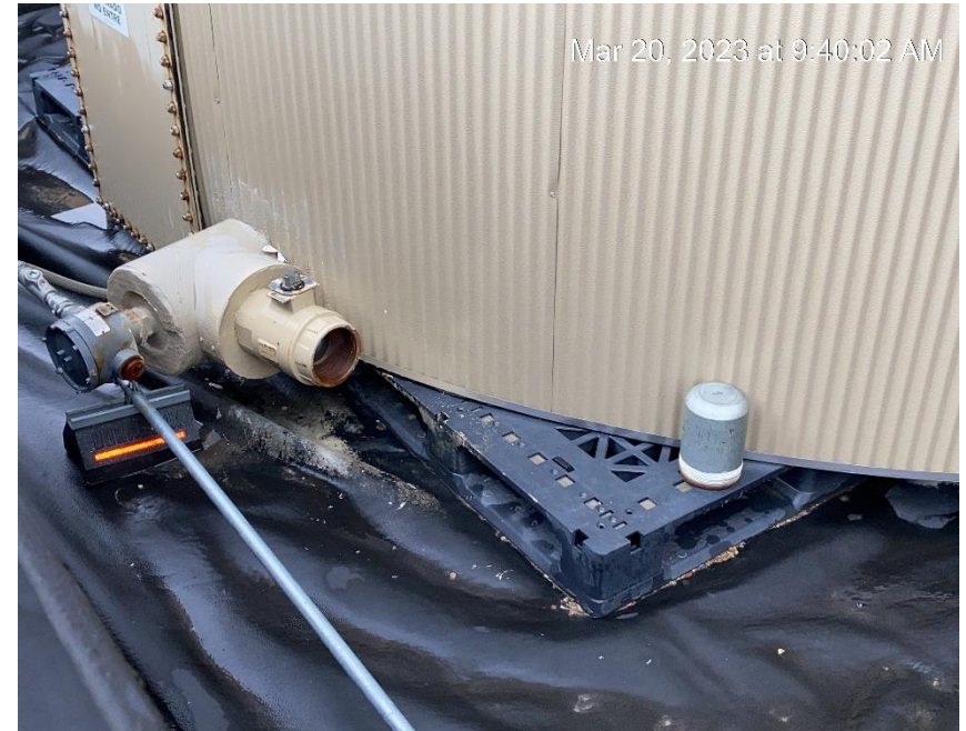
Debris. Open end tank valve.