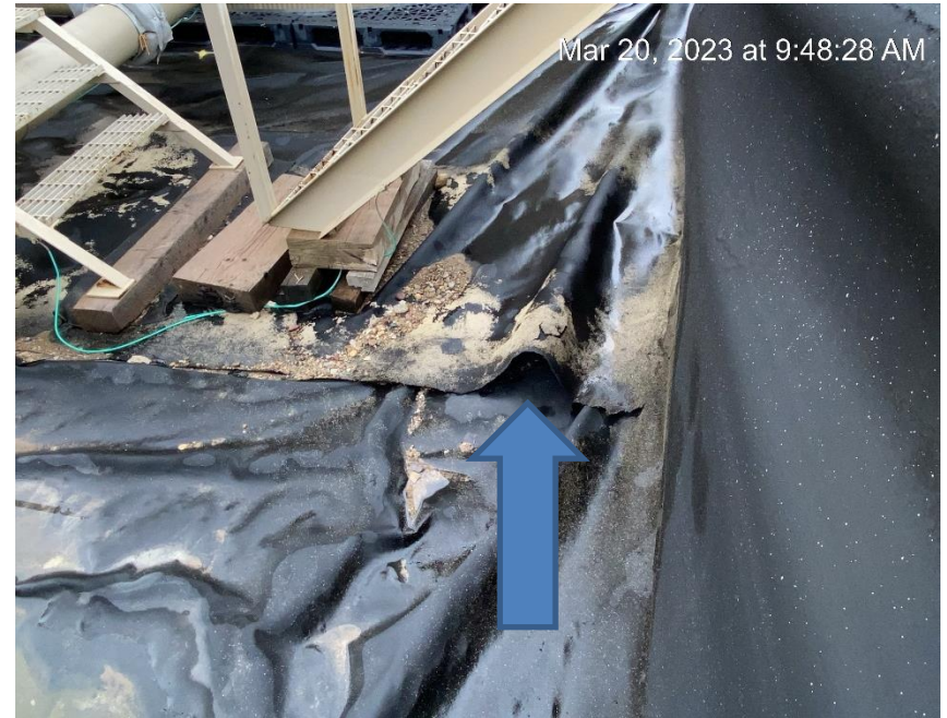
Liner pulled apart inside of containment