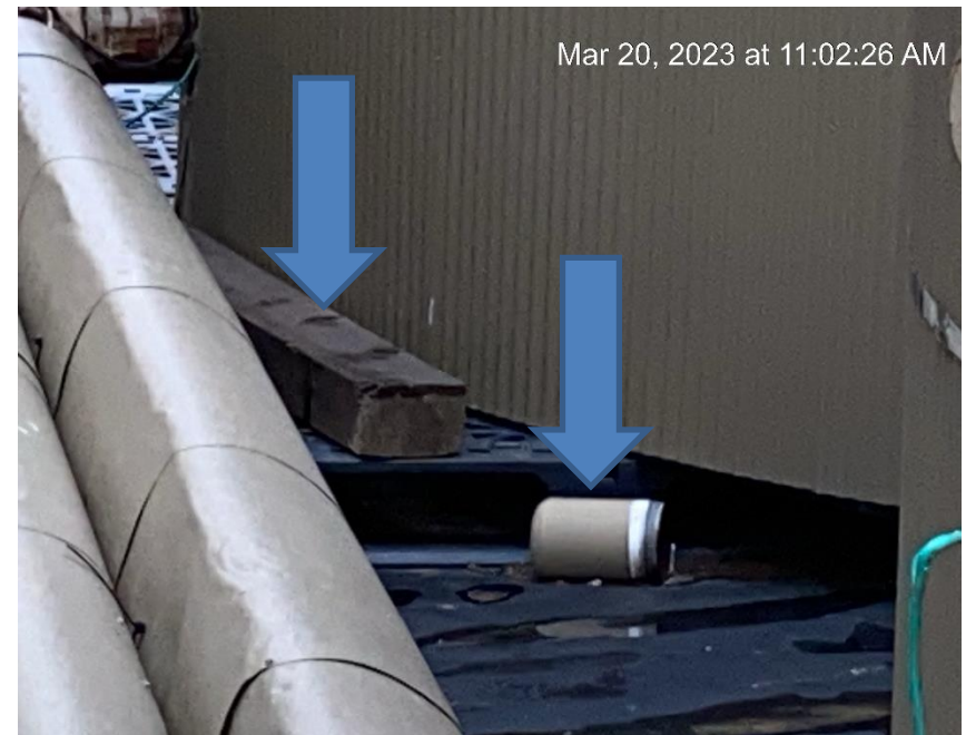
Debris inside tank containment