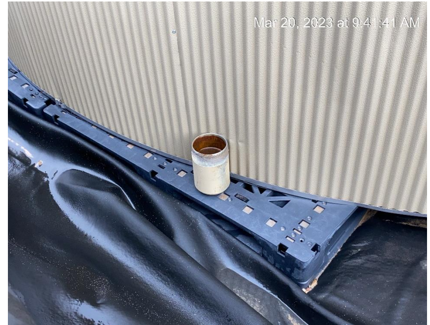
Debris inside tank containment