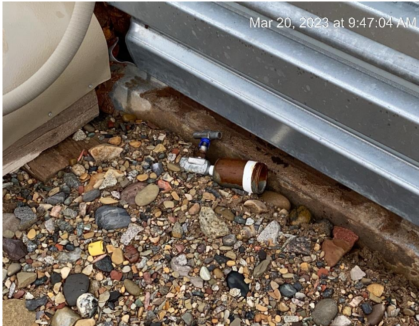
Debris outside tank containment