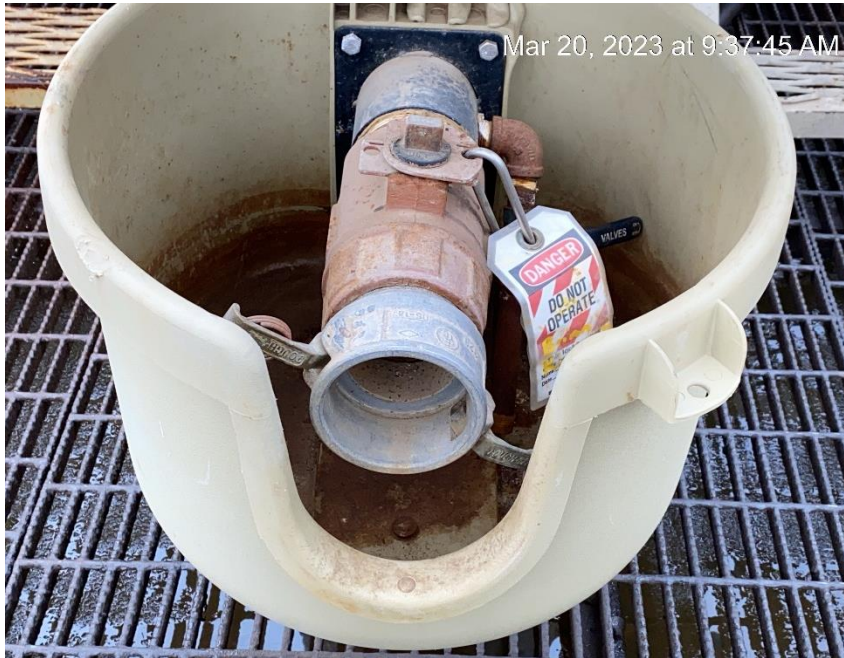
Open end loadline