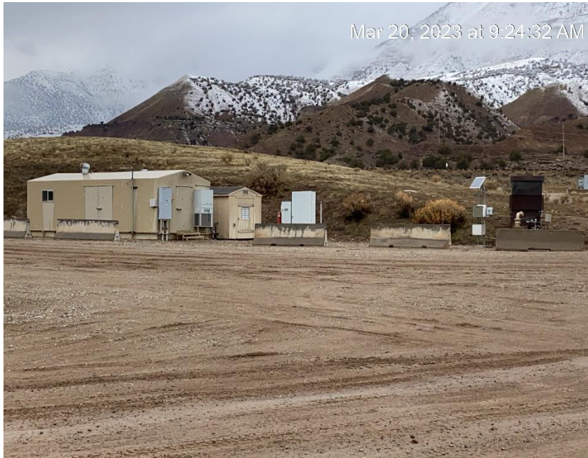
Middle of location looking Northwest