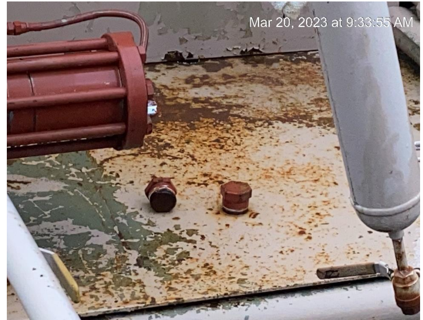
Debris on Dehy skid