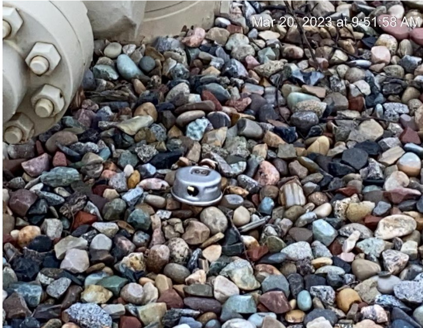
Debris at wellhead