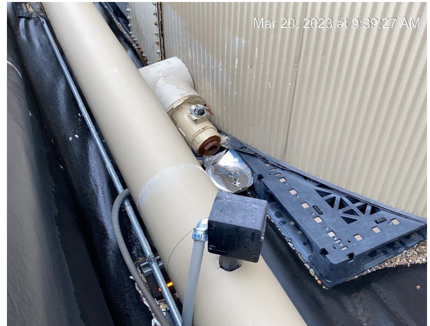
Debris. Open end tank valve.