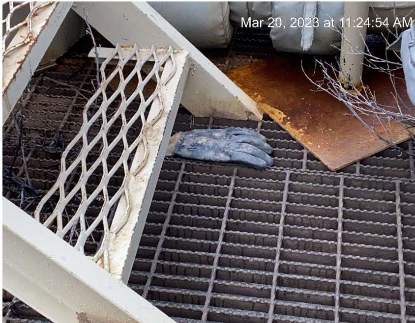
Debris at filter skid.