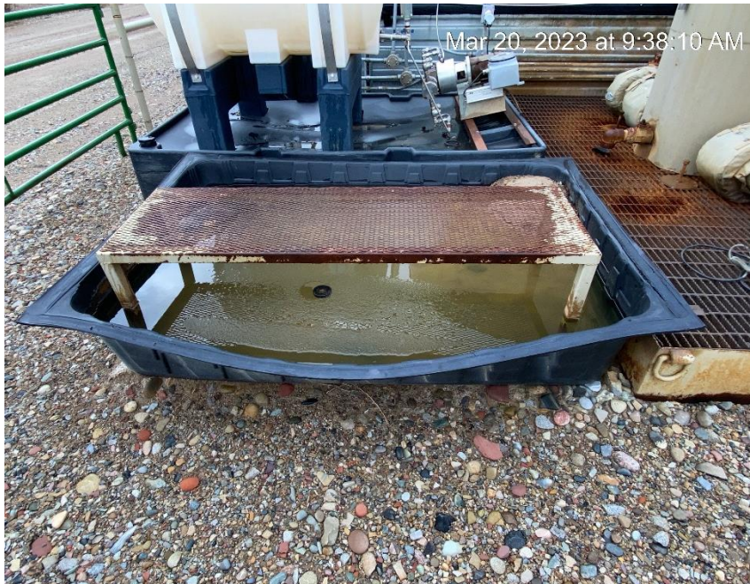
Unused equipment. Containment open to wildlife.