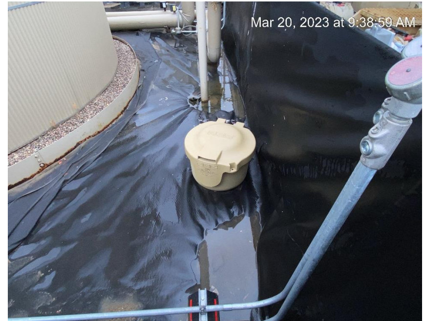
Unused equipment inside tank battery