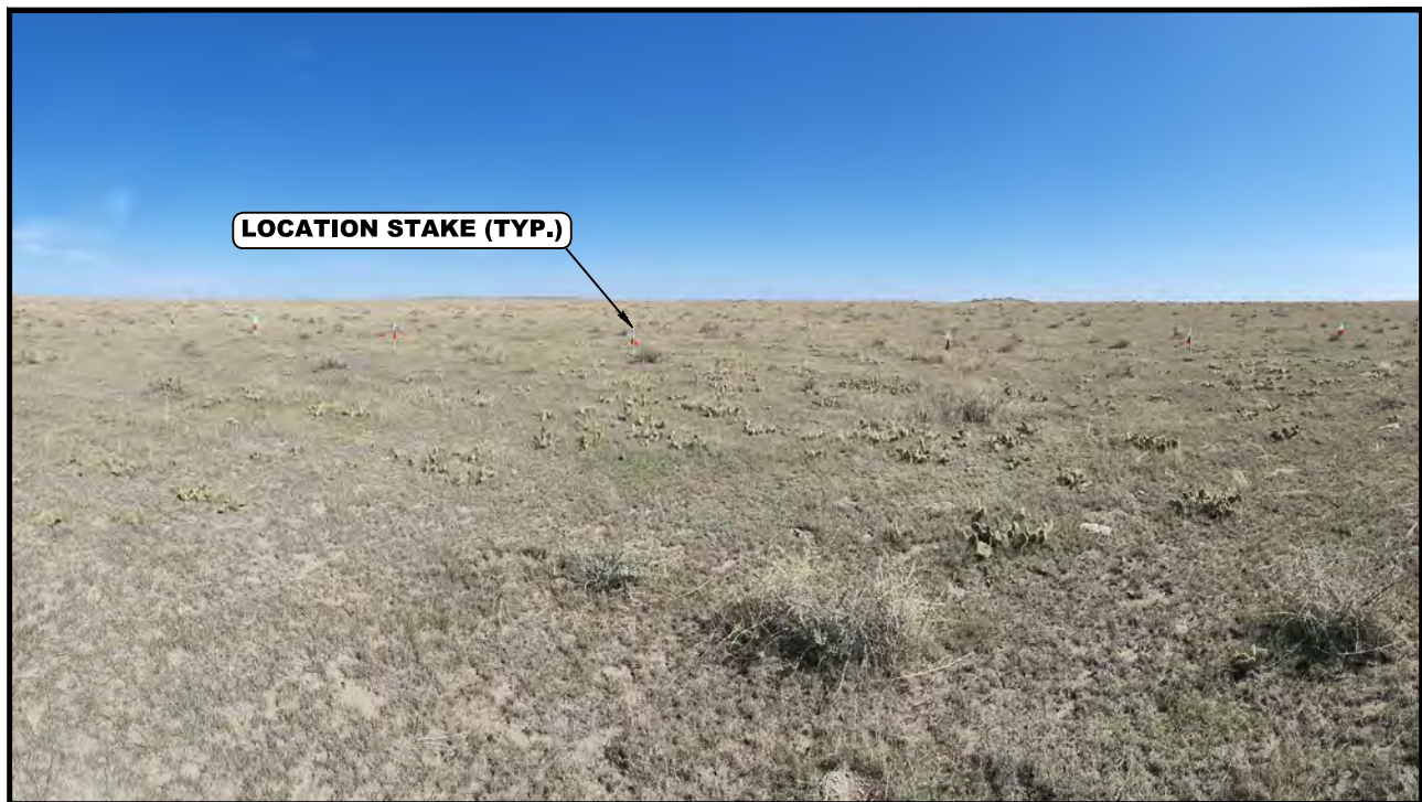
PHOTO: VIEW OF PROPOSED LOCATION