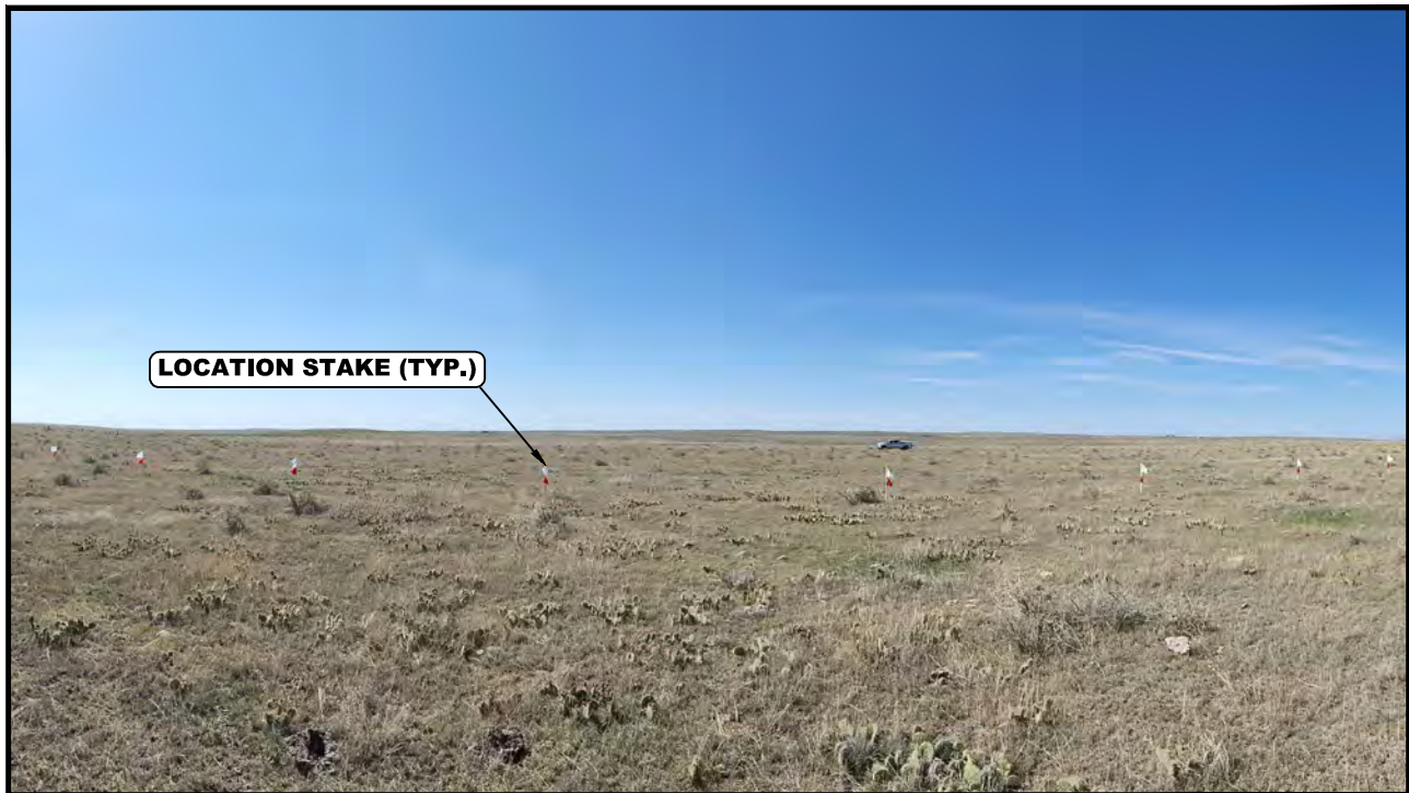
PHOTO: VIEW OF PROPOSED LOCATION