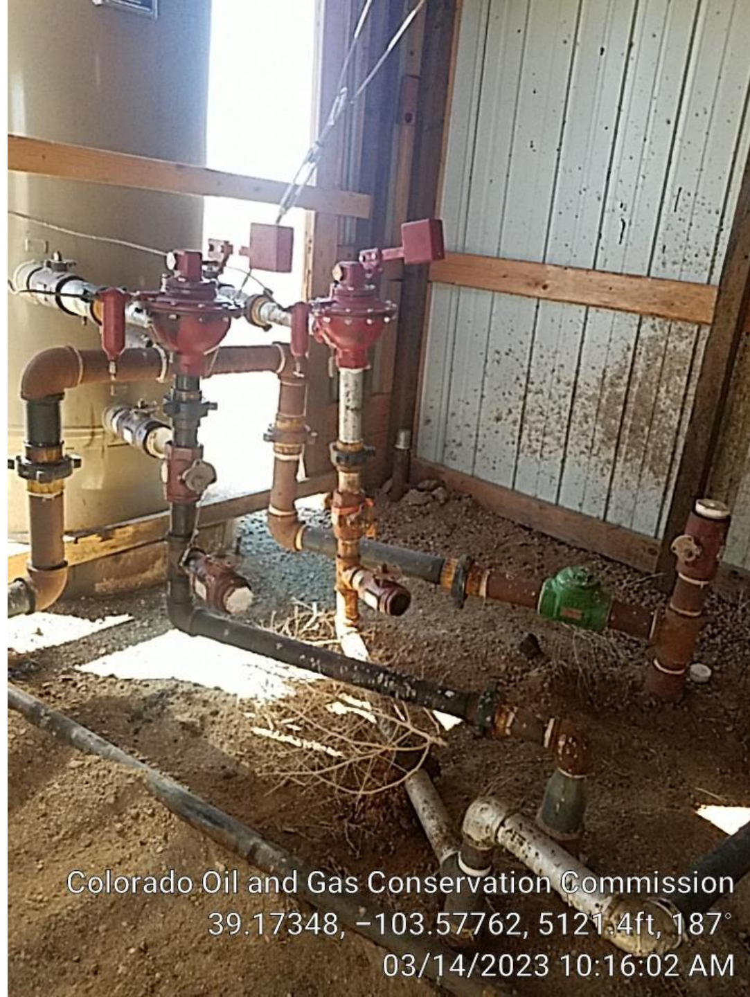
Stained soil in treater shed.

Colorado Oil and Gas Conservation Commission 39.17348, -103.57762, 5121.4ft, 187° 03/14/2023 10:16:02 AM