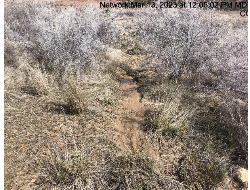
Photo #9224 Sediment trap insufficient. Sediment is being transport off location.