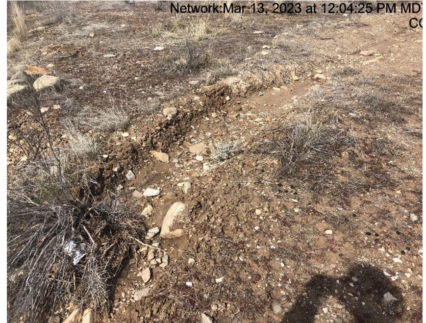
Photo #9222 Sediment trap insufficient. Sediment is being transport off location.