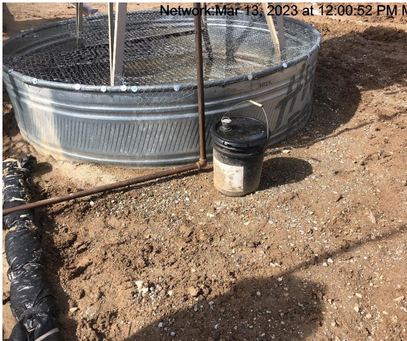
Photo #9210 Spill prevention and control BMPs not being implemented