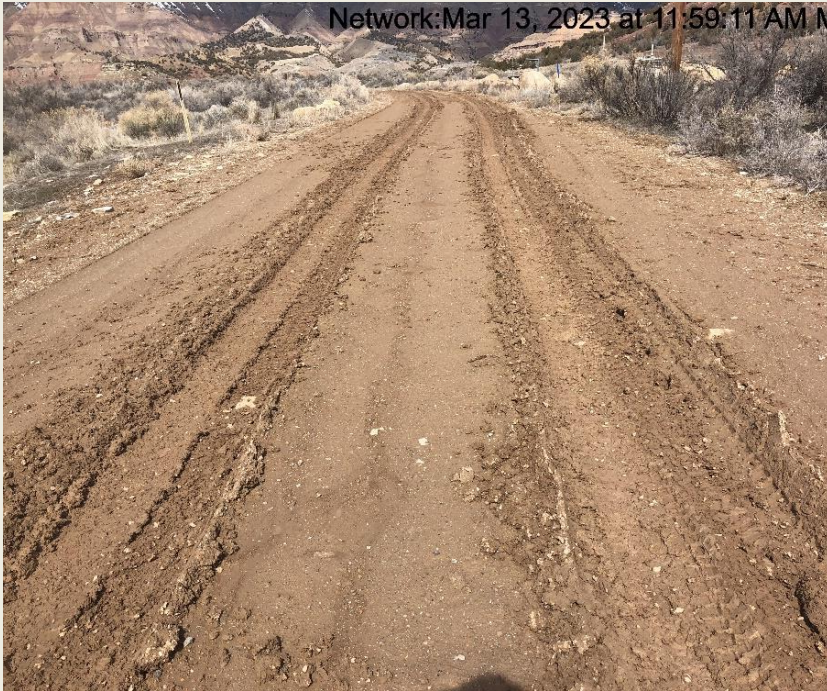
Access road and Location entrance.