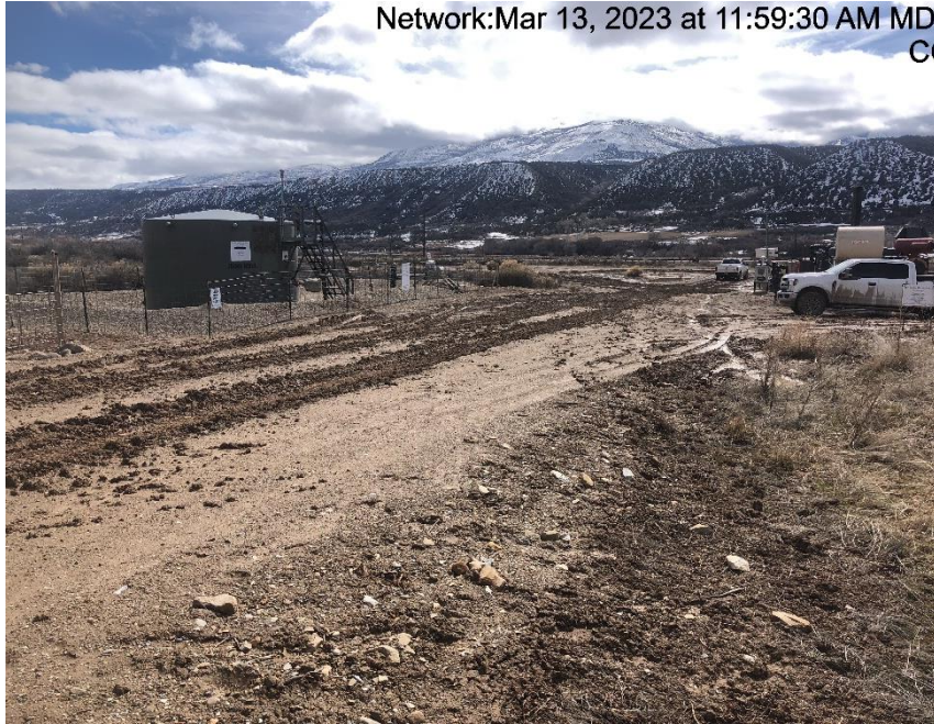
Photo #9205 Insufficient tracking BMP at entrance to location to minimize the transport of sediment.