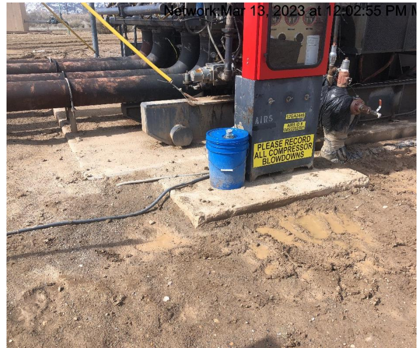
Photo #9216 Spill prevention and control BMPs not being implemented