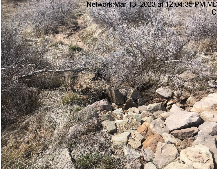
Photo #9223 Sediment trap insufficient. Sediment is being transport off location.