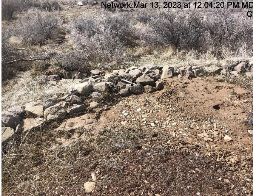
Photo #9221 Sediment trap insufficient. Sediment is being transport off location.