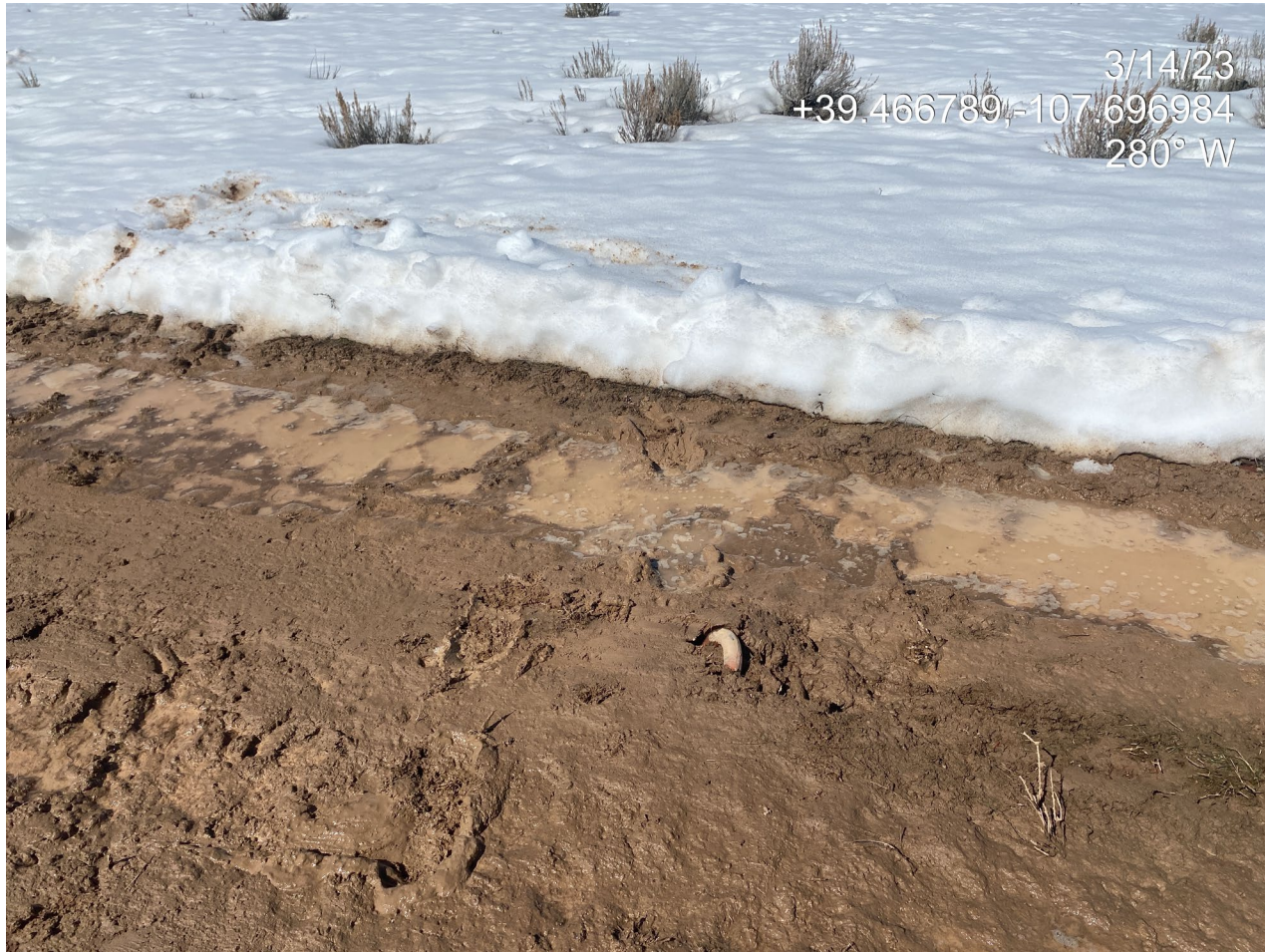
Photo 2. Photo shows an unmarked anchor at the northeast of the location.