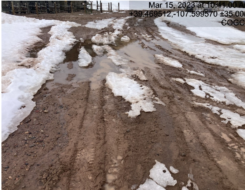
Lack of stabilization/compaction/no evidence of tracking BMP's