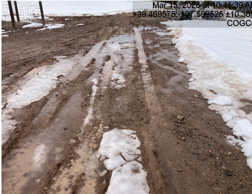
Lack of stabilization/compaction/no evidence of tracking BMP's