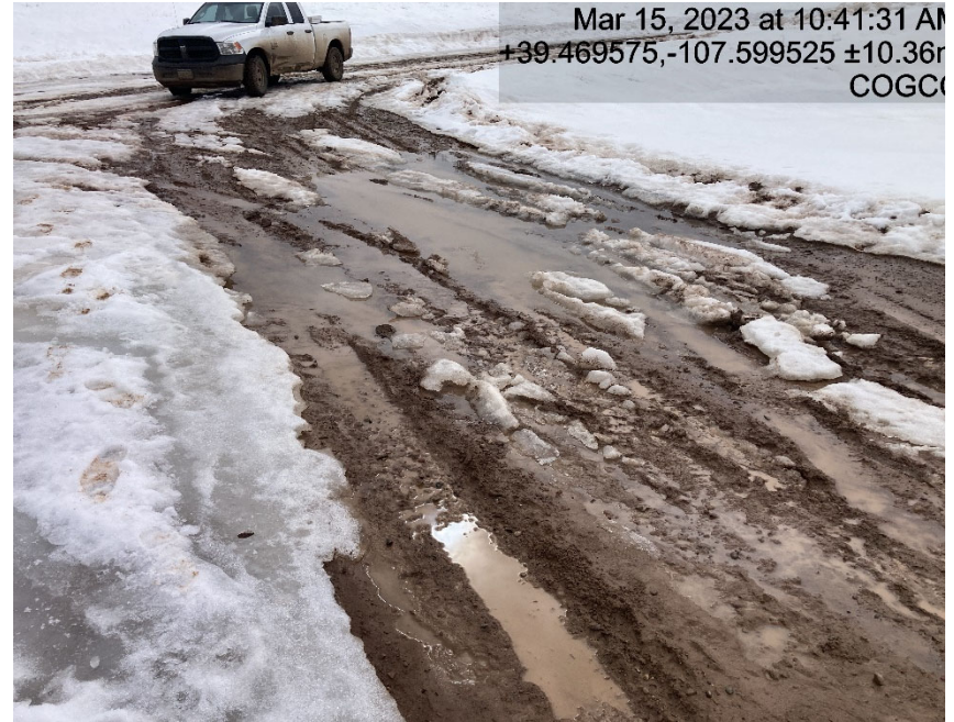
Lack of stabilization/compaction/no evidence of tracking BMP's