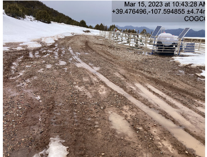
Lack of stabilization/compaction/no evidence of tracking BMP's