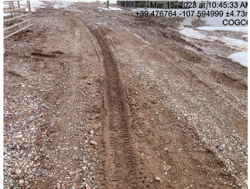
Lack of stabilization/compaction/no evidence of tracking BMP's