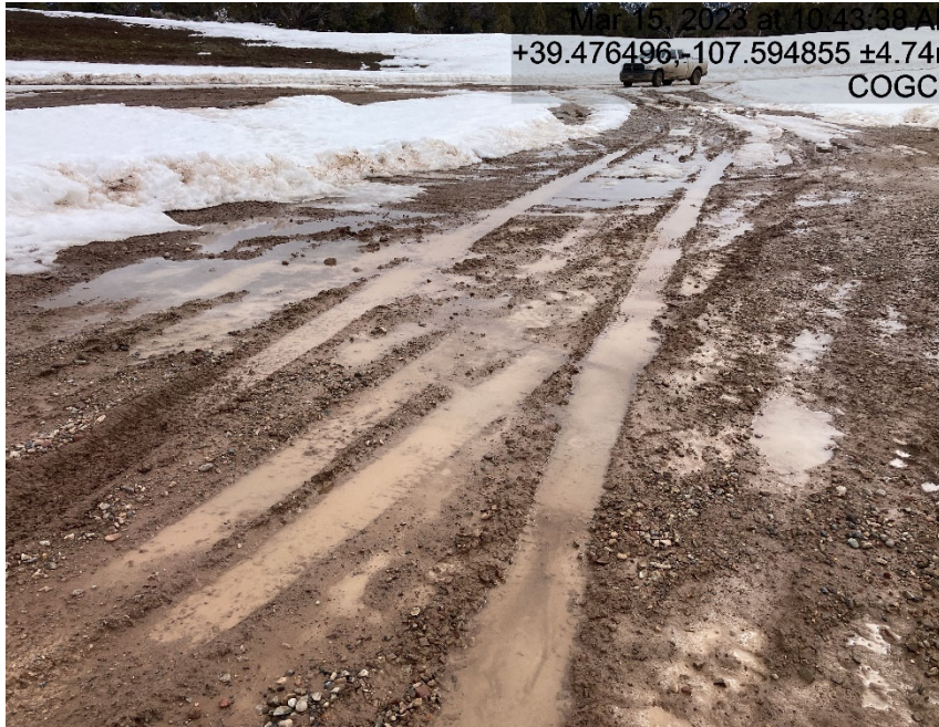
Lack of stabilization/compaction/no evidence of tracking BMP's