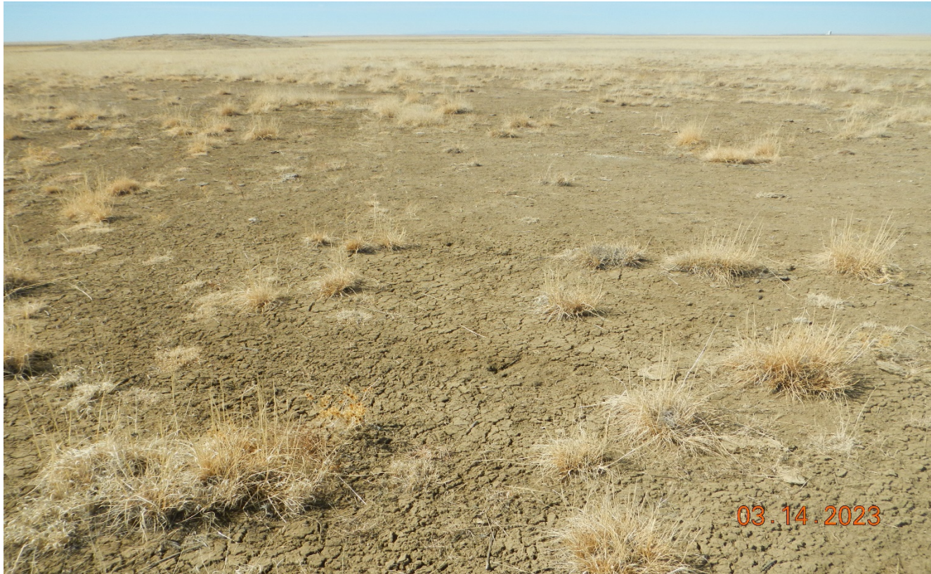
Photo 4. Center of the location facing west.