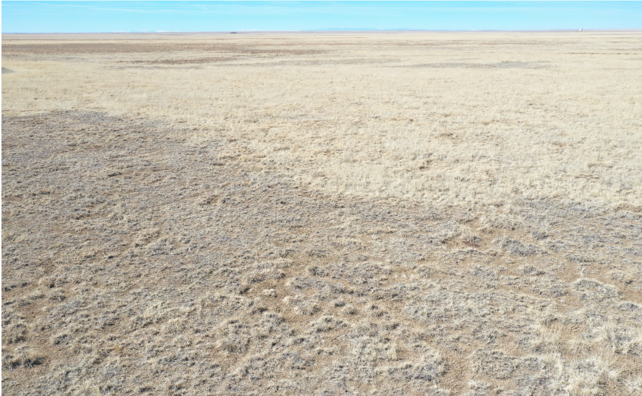
Photo 7. Drone aerial image facing west at the surrounding undisturbed uniform vegetation cover.