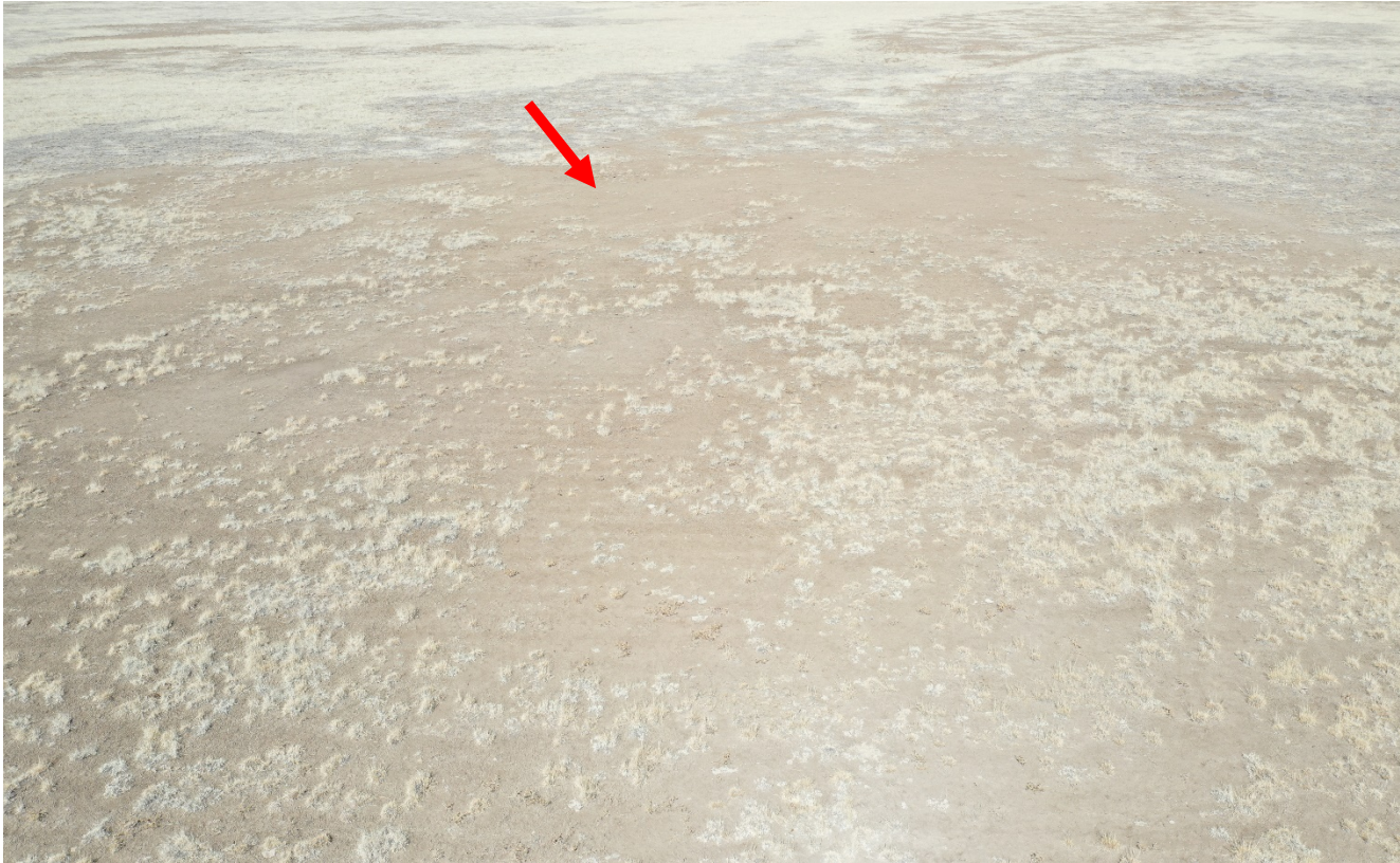
Photo 6. Drone aerial photo facing north toward the location. The northern portion of the disturbed location at red arrow is mostly bare soil.