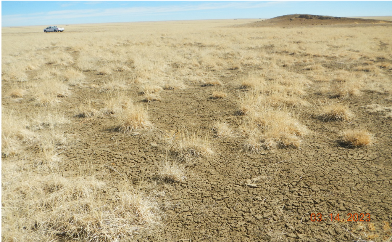
Photo 2. Center of the location facing east.