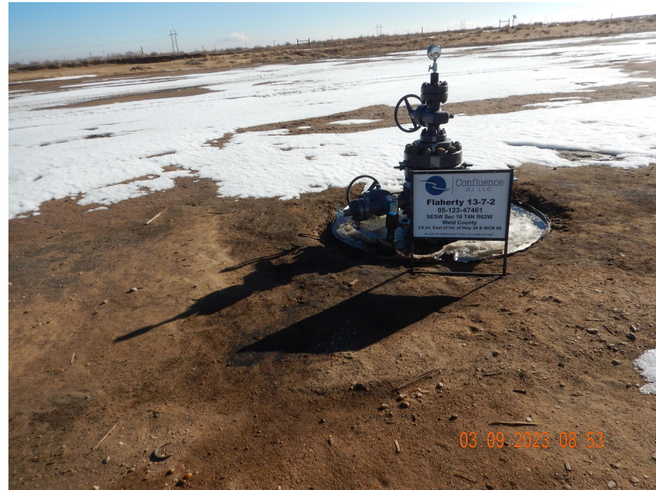
Photo 10. Photo taken from one of the wellheads, facing East. Photo illustrates oily stained soil.