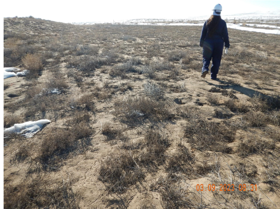
Photo 4. Photo taken from the southwestern location, facing South. Photo illustrates both the establishment of desirable vegetation and weeds- see Photo 5.