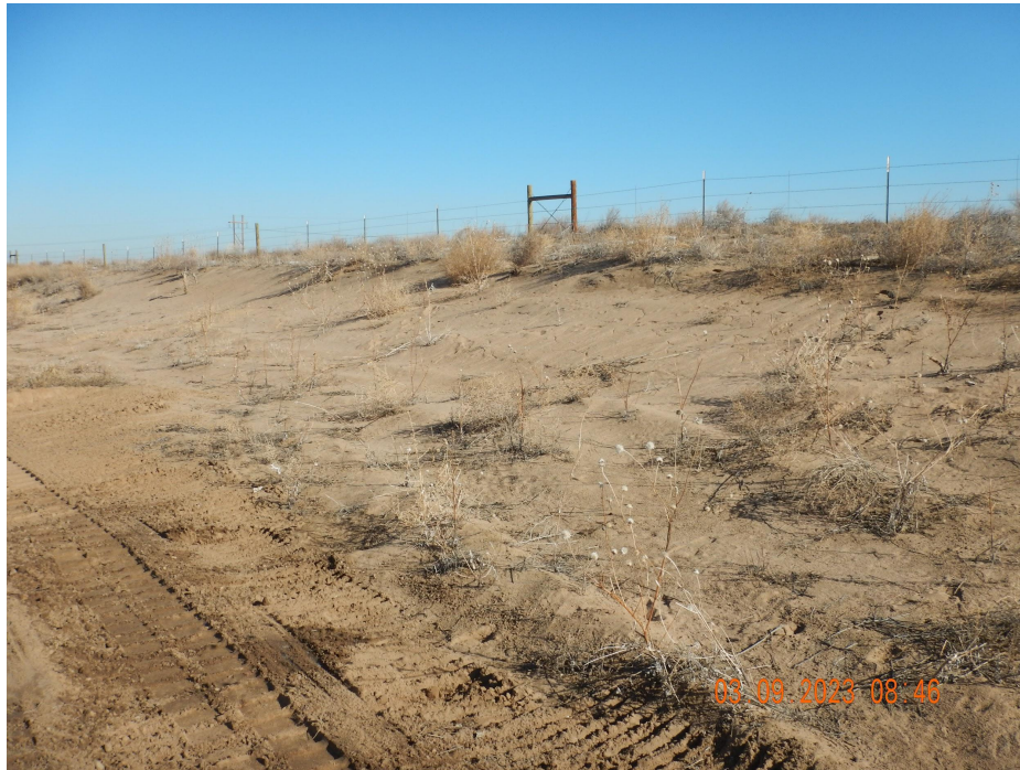
Photo 7. Photo taken from the southeastern location, facing North. Photo illustrates the cut slope has not been stabilized and wind erosion is evident- see Photo 8.