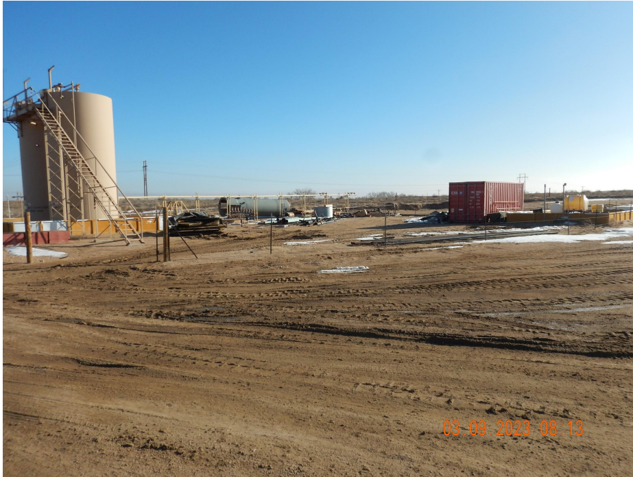
Photo 1. Photo taken from the northeastern location, facing East. Photo illustrates the Operator is storing unused equipment.