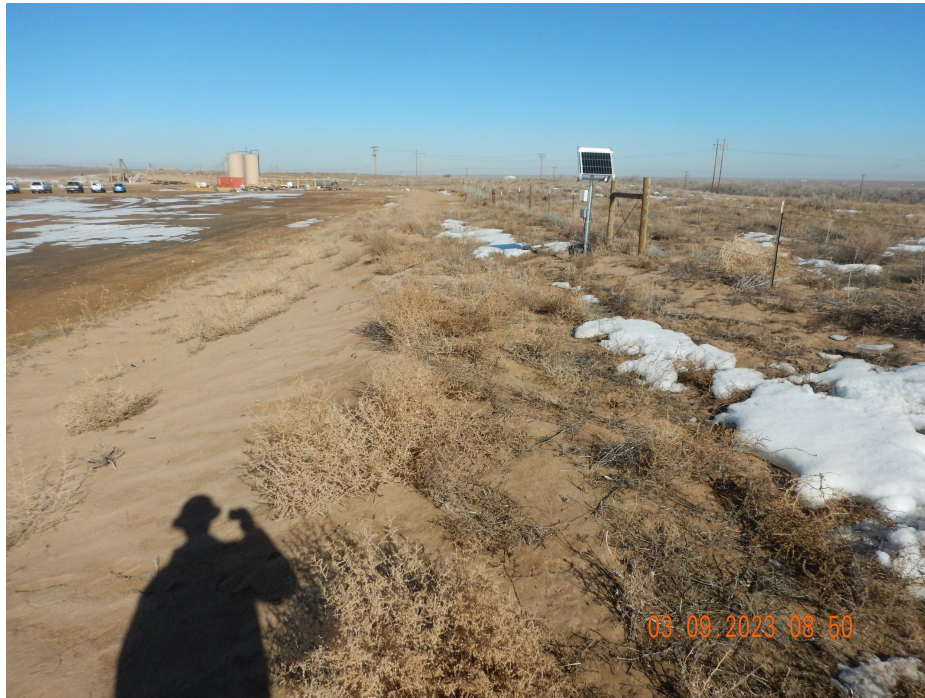
Photo 9. Photo taken from the eastern location, facing North. Photo illustrates weed establishment and weed maintenance needed along the eastern perimeter/cut slope.