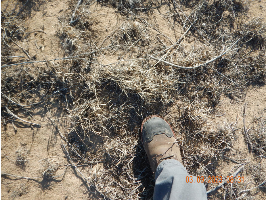
Photo 5. Close up photo illustrating desirable vegetation- Blue grama.