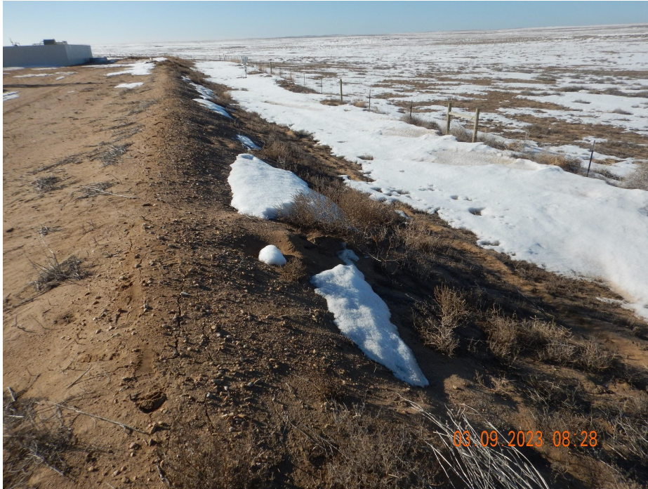
Photo 3. Photo taken from the western location, facing South. Photo illustrates weed establishment and weed maintenance needed along the western fill slope.