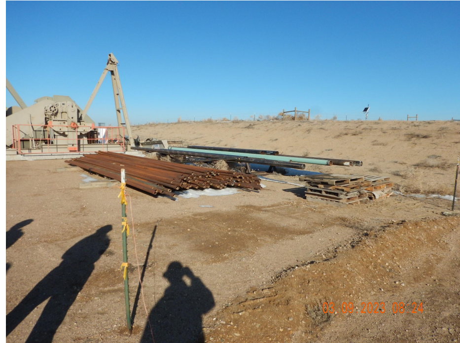
Photo 2. Photo taken from the northern location, west of the access road, facing Northwest. See comments under Photo 1.