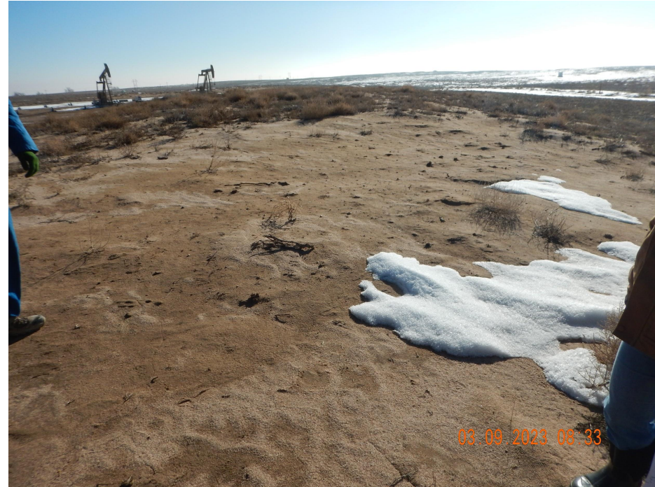
Photo 6. Photo taken from the topsoil stockpile, facing East. Photo illustrates bare ground and wind erosion with the establishment of weeds.