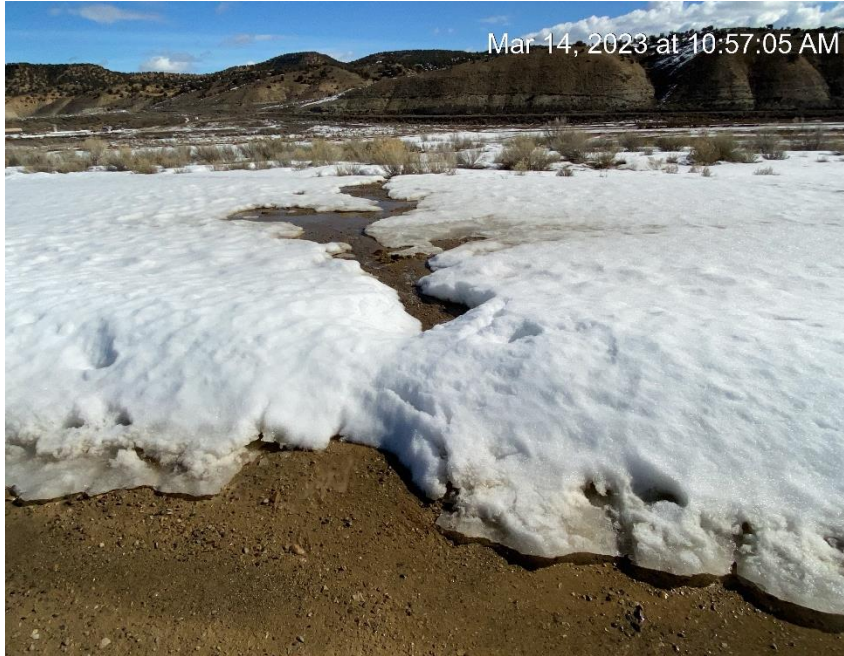
Stormwater BMPs not in place and maintained