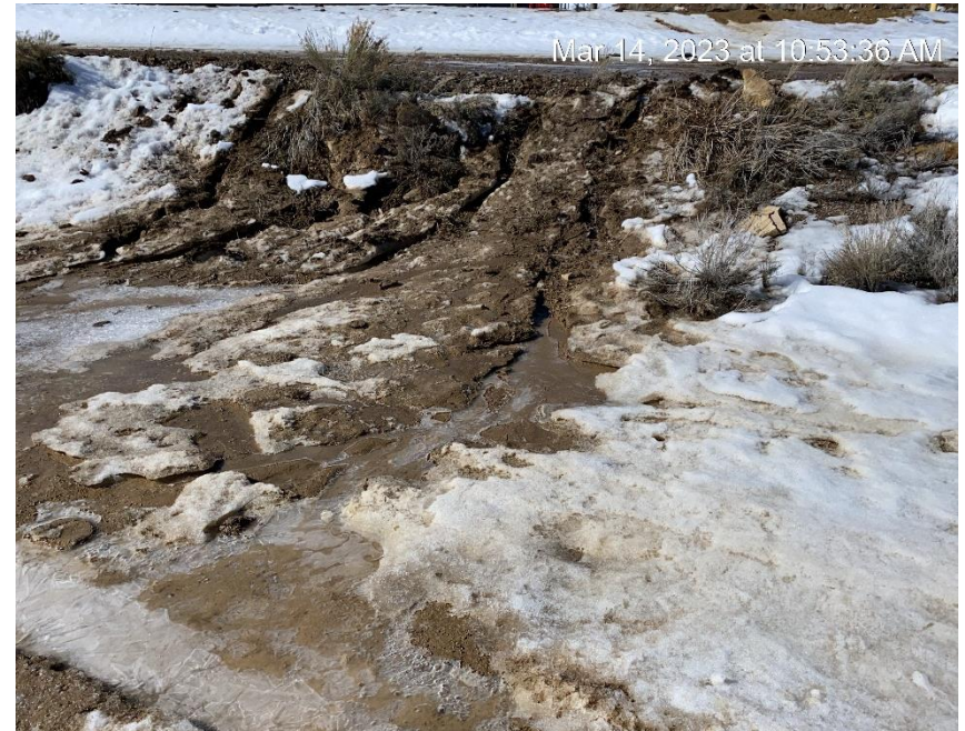
Erosion from upper lease road