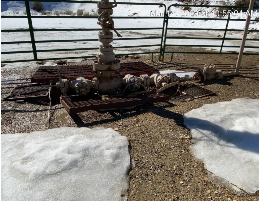
Cellar covers not maintained.