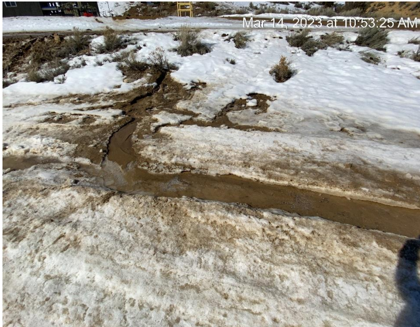
Erosion from upper lease road