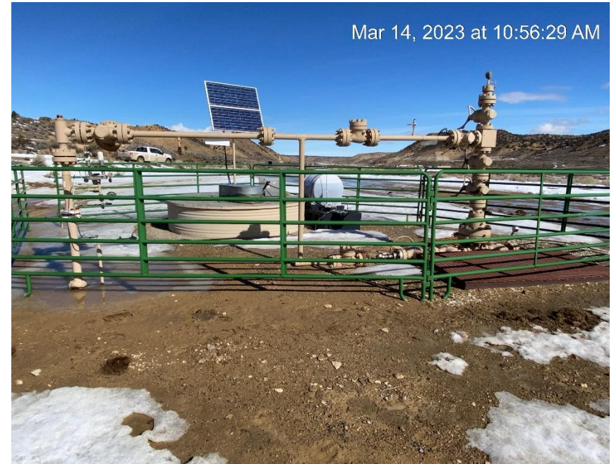
To entrance to location