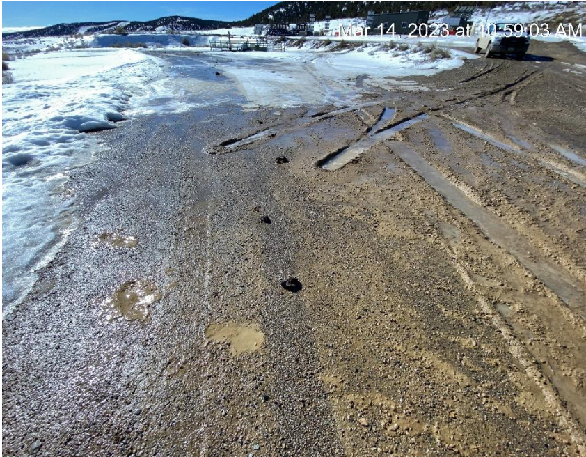
Location lacks stabilization.