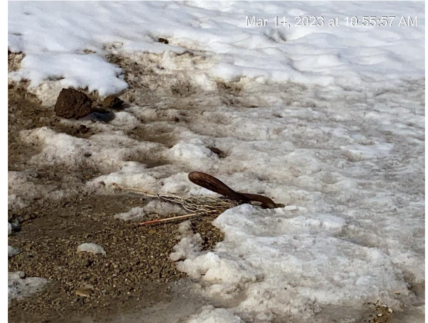
Unmarked guy line anchor.