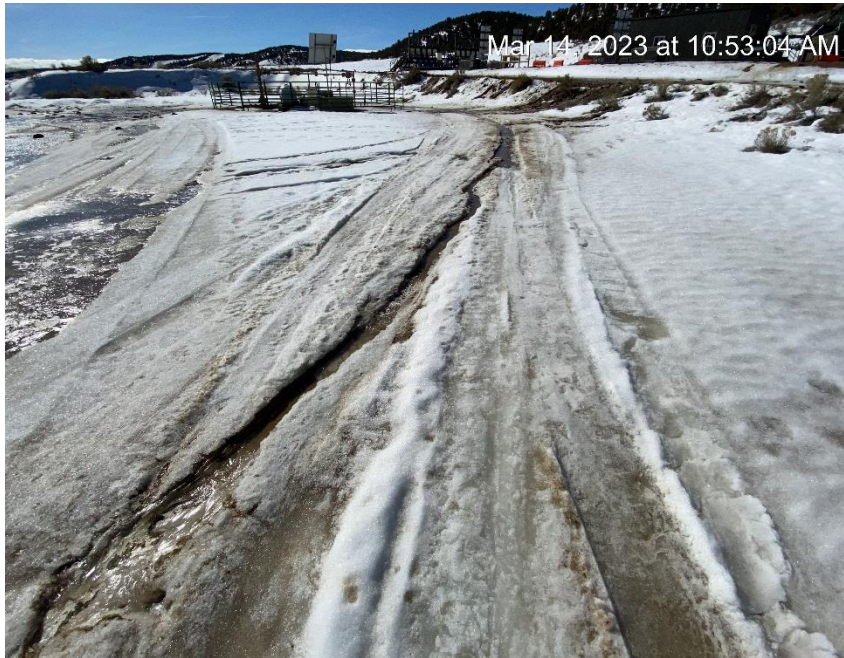
From entrance to location