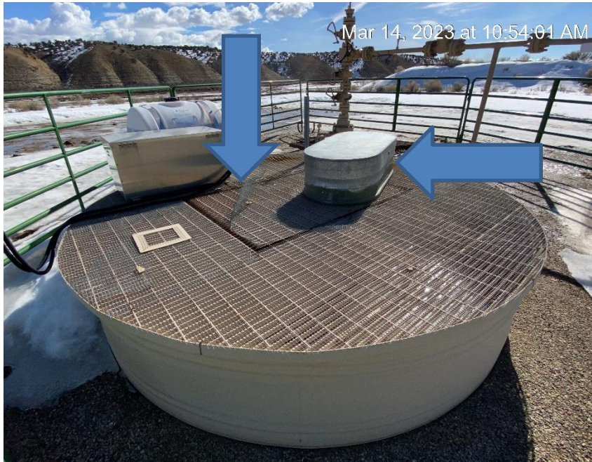
Debris, wire screen repair