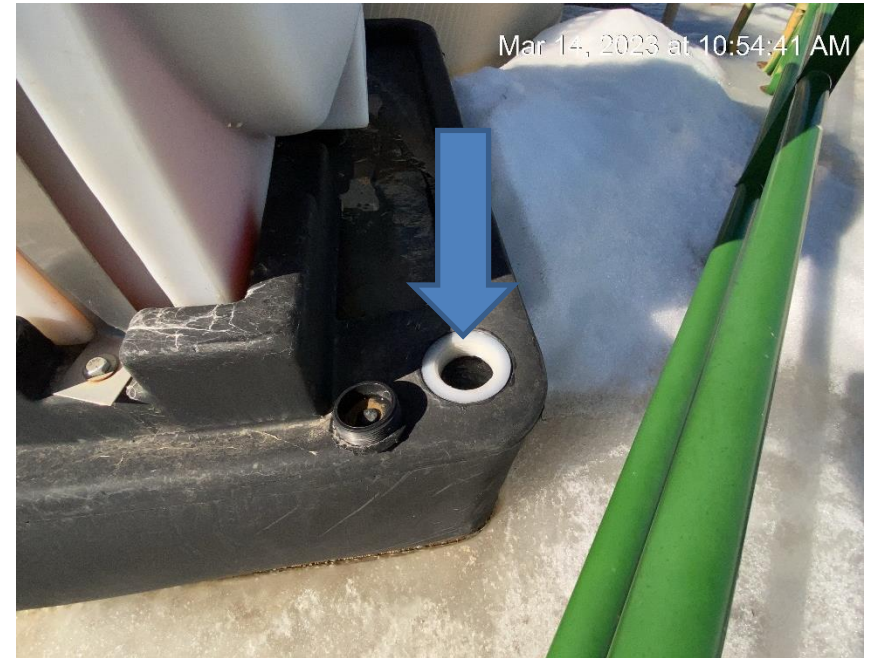
Chemical containment full of liquid