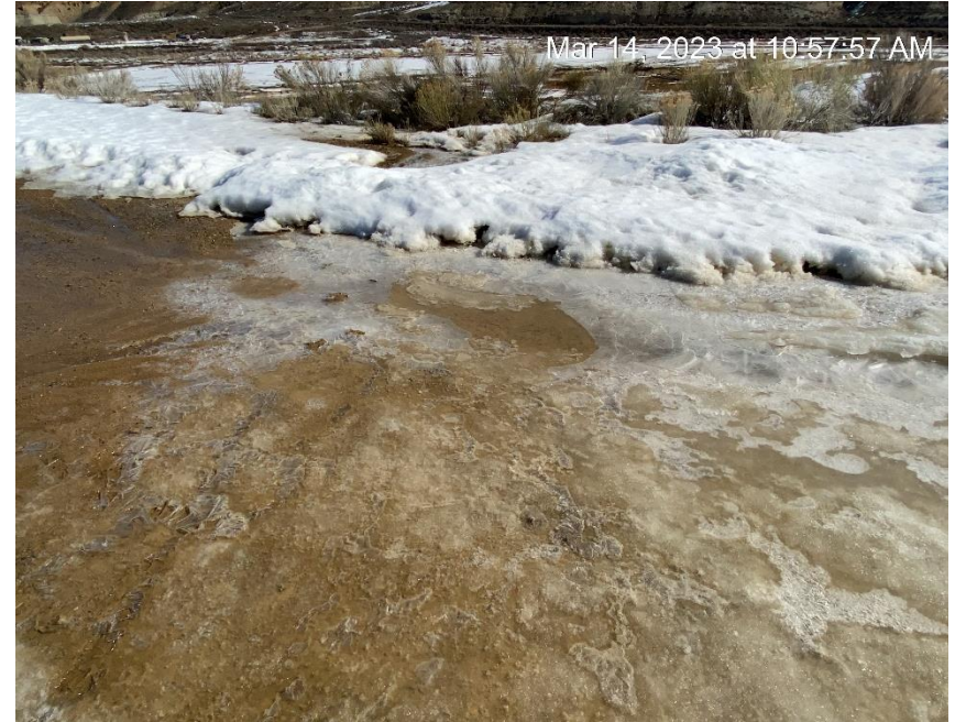
Stormwater BMPs not in place and maintained