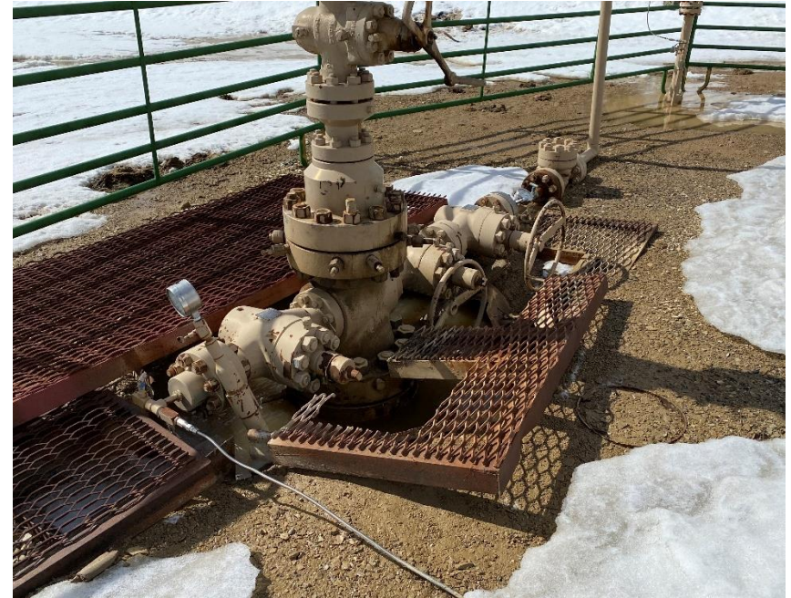
Cellar covers need to fit properly