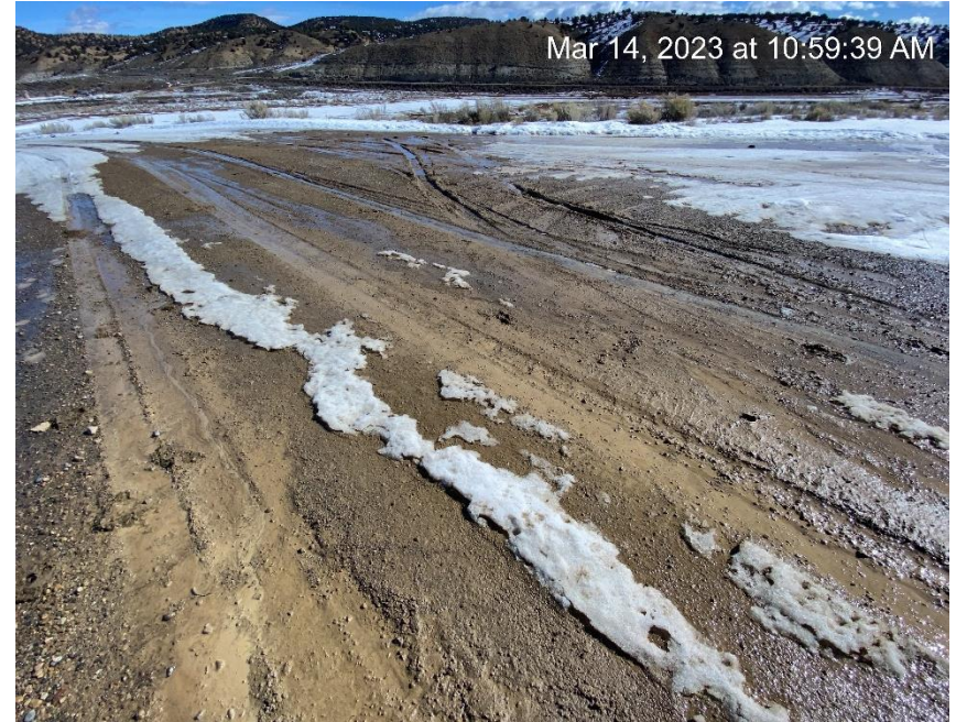
Insufficient tracking BMP at entrance to location.