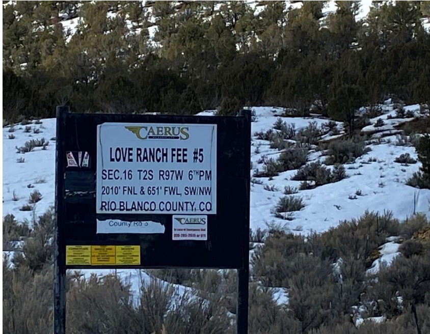
Public road used to access location needs replaced.