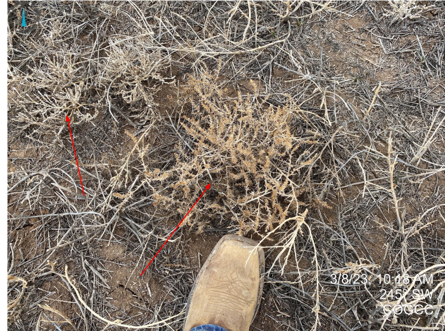
Photos 6 & 7. Close up photos illustrating bare soil and undesirable vegetation (e.g. russian thistle and kochia).