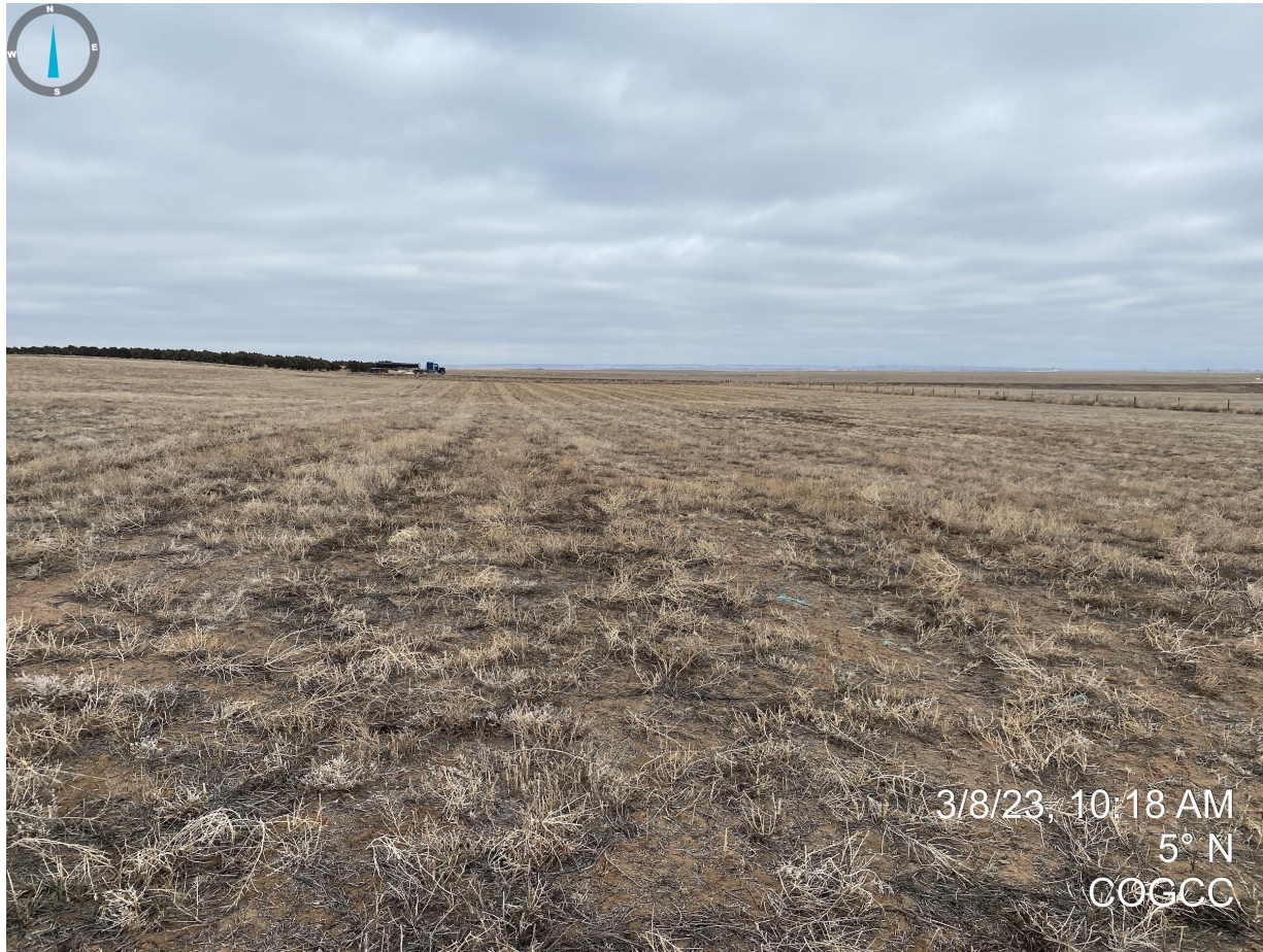
Photo 1. Facing north from the southeastern portion of the interim reclamation areas. Undesirable vegetation (e.g. kochia and russian thistle) and areas of bare soil were observed throughout the interim areas. It appears that the weeds have been managed previously with evidence of mowing.