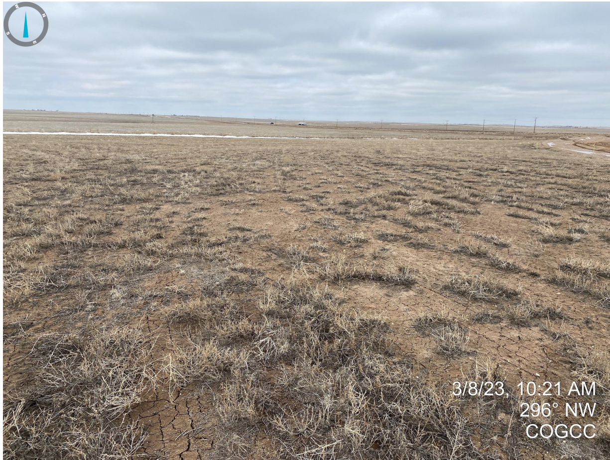
Photo 5. Facing northwest towards the western interim area. See comments in Photo 1.