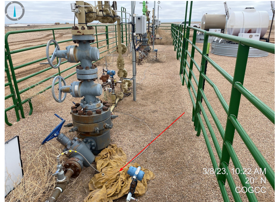
Photos 15 & 16. Close up photos of debris that needs to be removed.