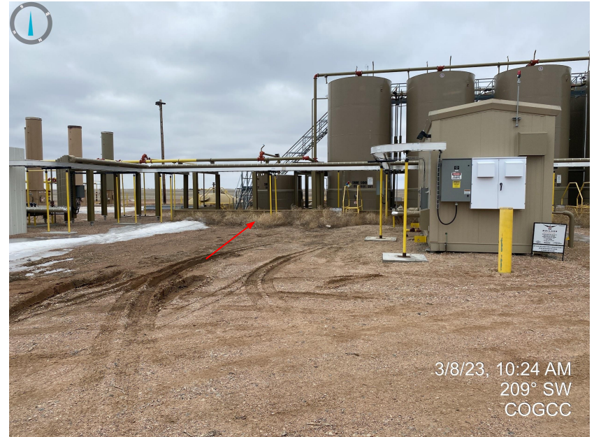
Photos 17 & 18. Facing southwest near production equipment. Photo illustrates tumbleweed accumulations within equipment; this is now considered debris and needs to be removed as it present a fire hazard.