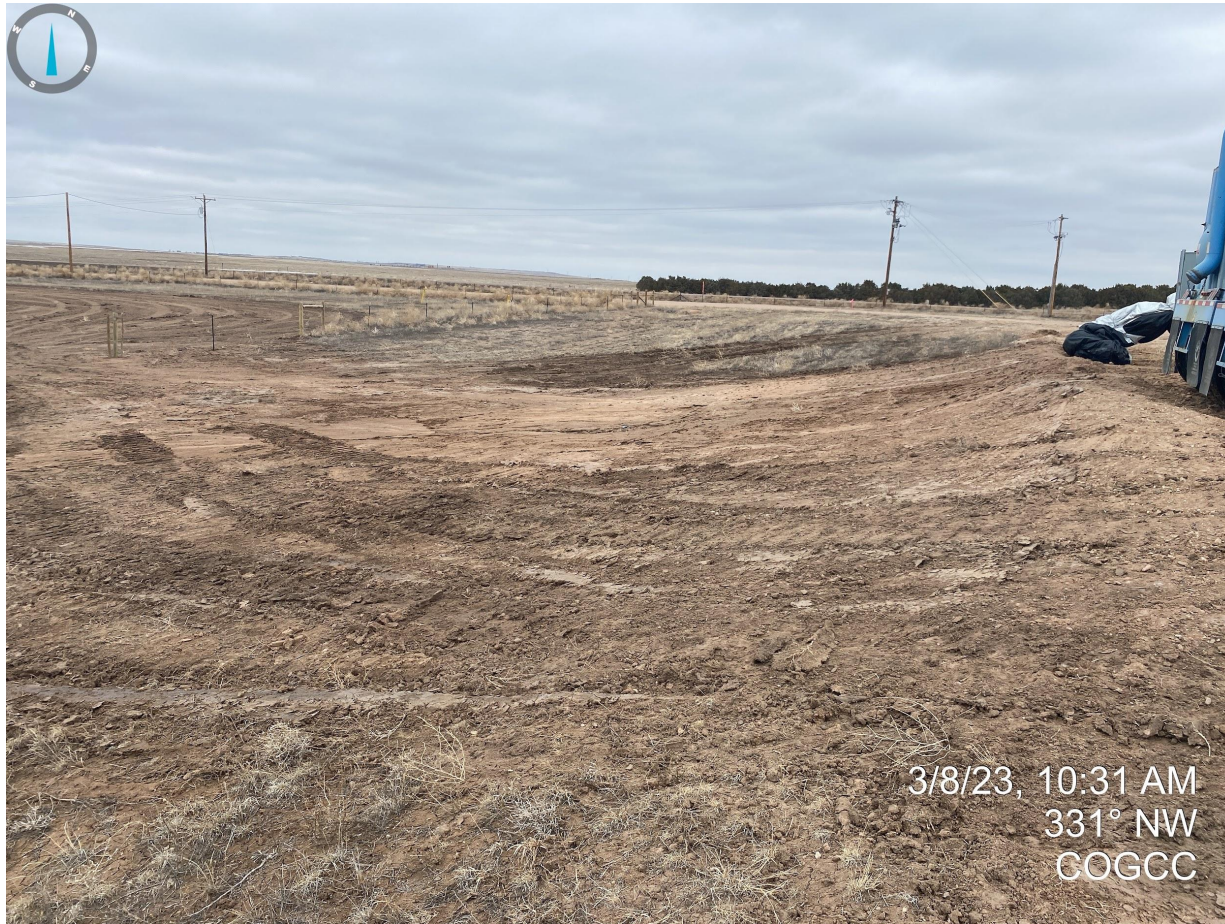
Photo 12. Facing northwest from the western portion of the pad; this portion of the interim area will need to be reclaimed once the pipeline work has been completed.