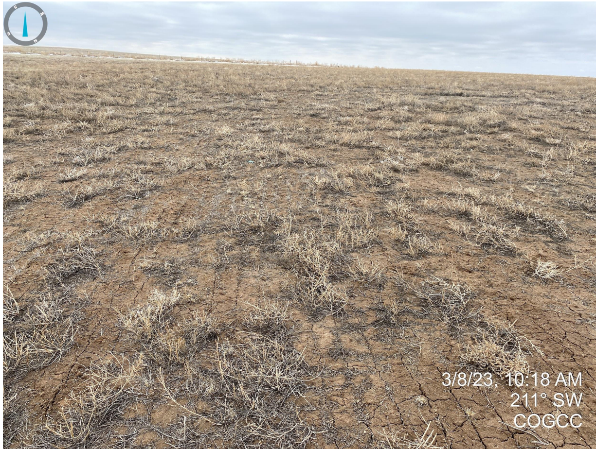
Photo 2. Facing southwest from the southeastern portion of the interim area. See comments in Photo 1.