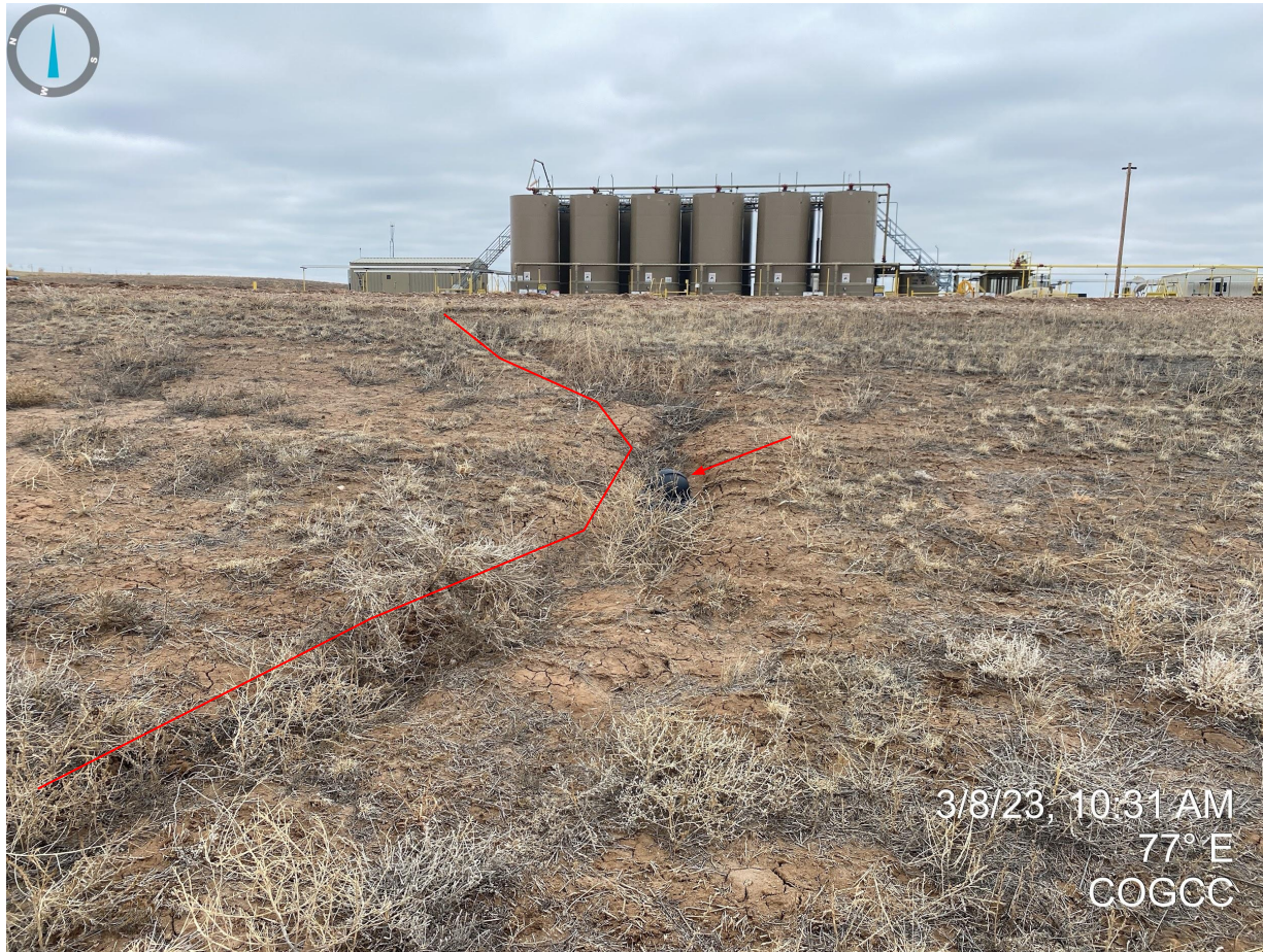
Photo 9. Facing east from the western edge of the pad. Photo illustrates rill erosion occurring within the interim areas that appears to have originated from a breached perimeter berm. (Hard hat for scale)