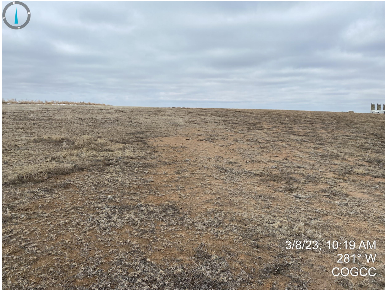
Photo 3. Facing west from the southeastern portion of the interim area. See comments in Photo 1.