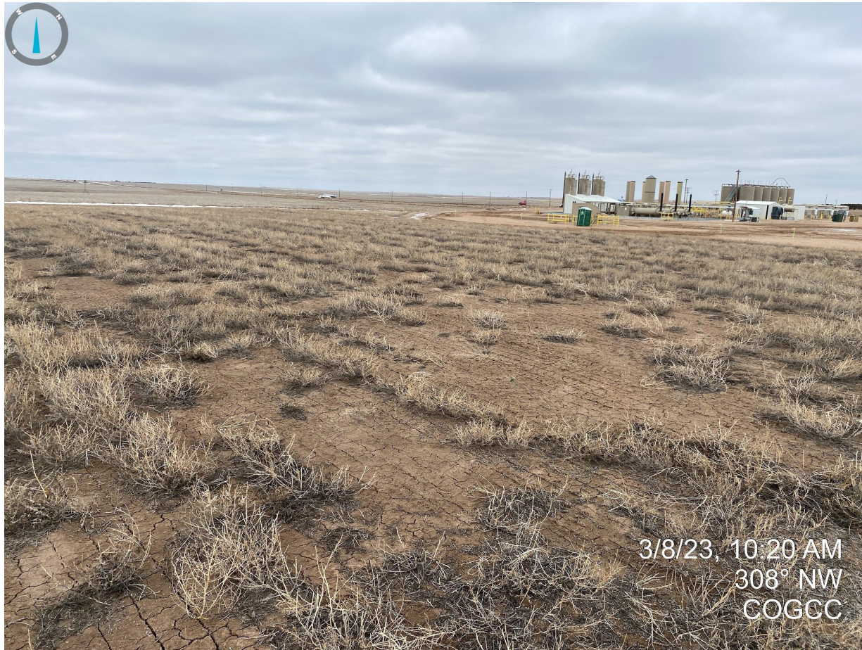
Photo 4. Facing northwest from the southern/central portion of the interim area. See comments in Photo 1.