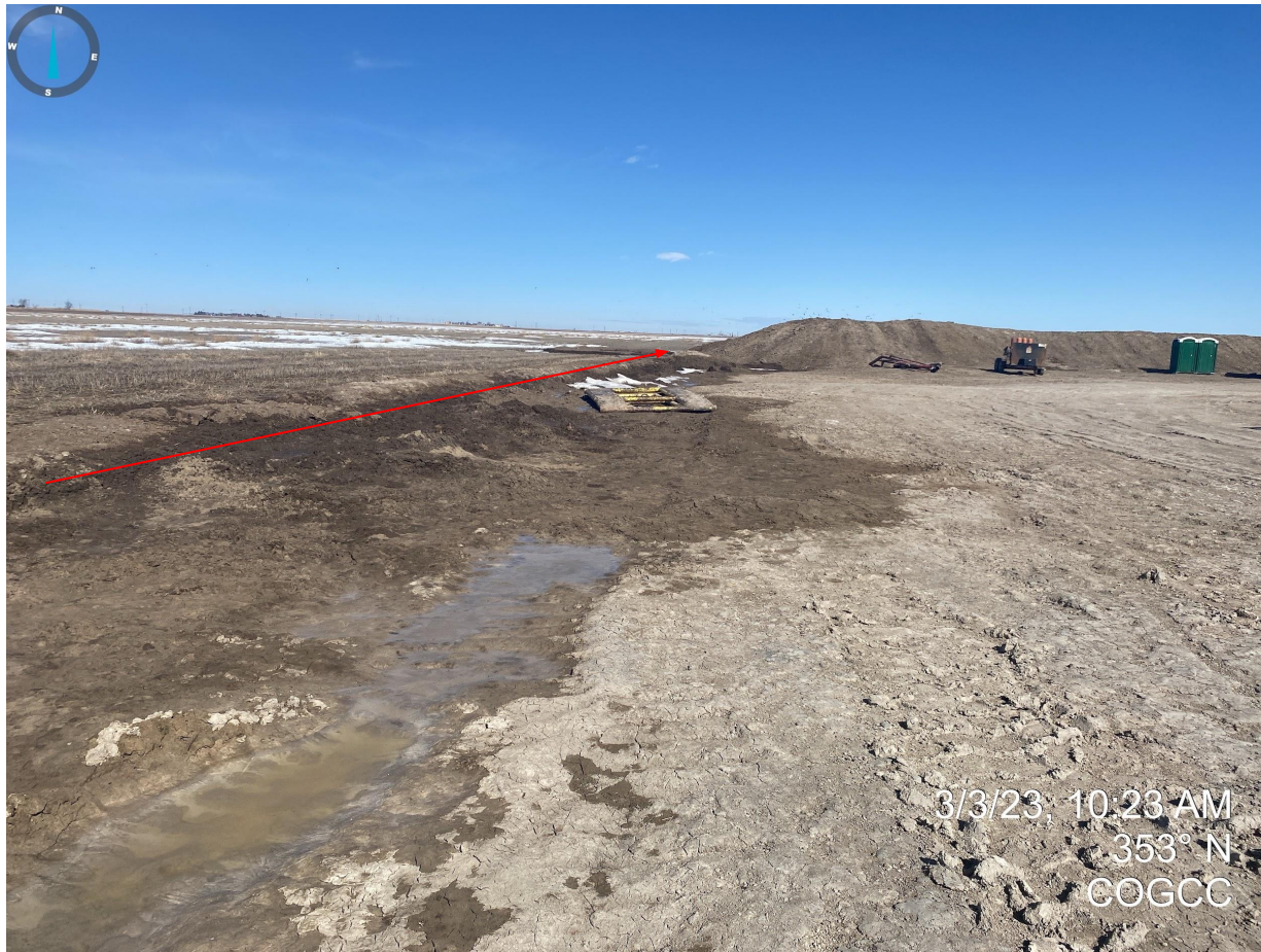
Photo 3. Facing north from the southwest corner of the location. See comments in Photo 1.