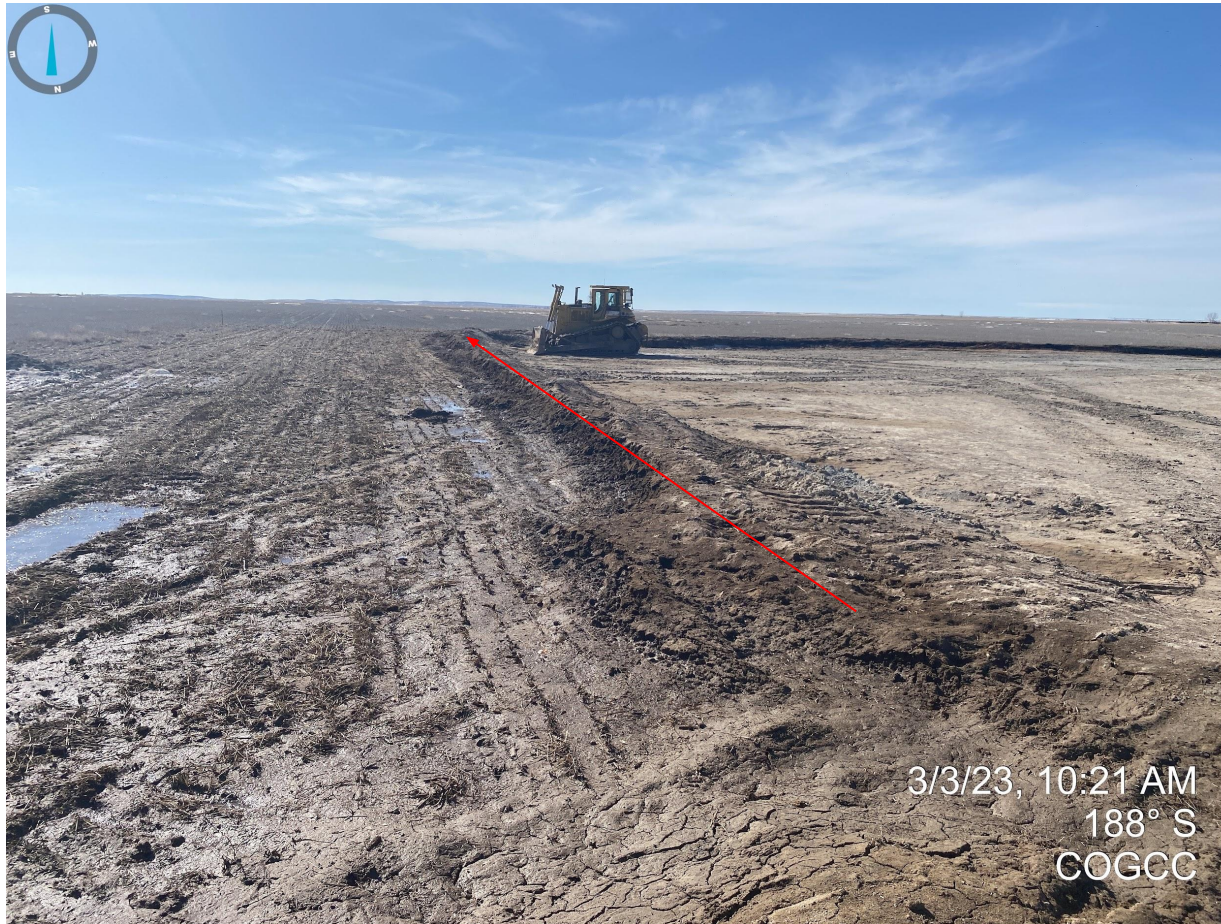
Photo 1. Facing south near the location's entrance. The perimeter berm BMP consists of unconsolidated material and need to be repaired/maintained until final reclamation is achieved pursuant to Rule 1004. Staff acknowledges that soil moisture and weather may delay maintenance; it is Staff's expectation that the BMPs are addressed as soon as conditions permit. Until then, the location will remain out of compliance with Rule 1002.f.(2).