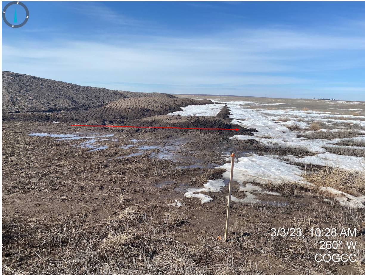
Photo 4. Facing west from the northeast corner of the location. See comments in Photo 1.