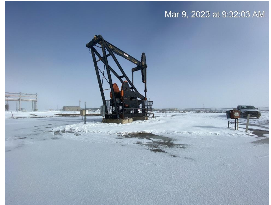
To location entrance and access road