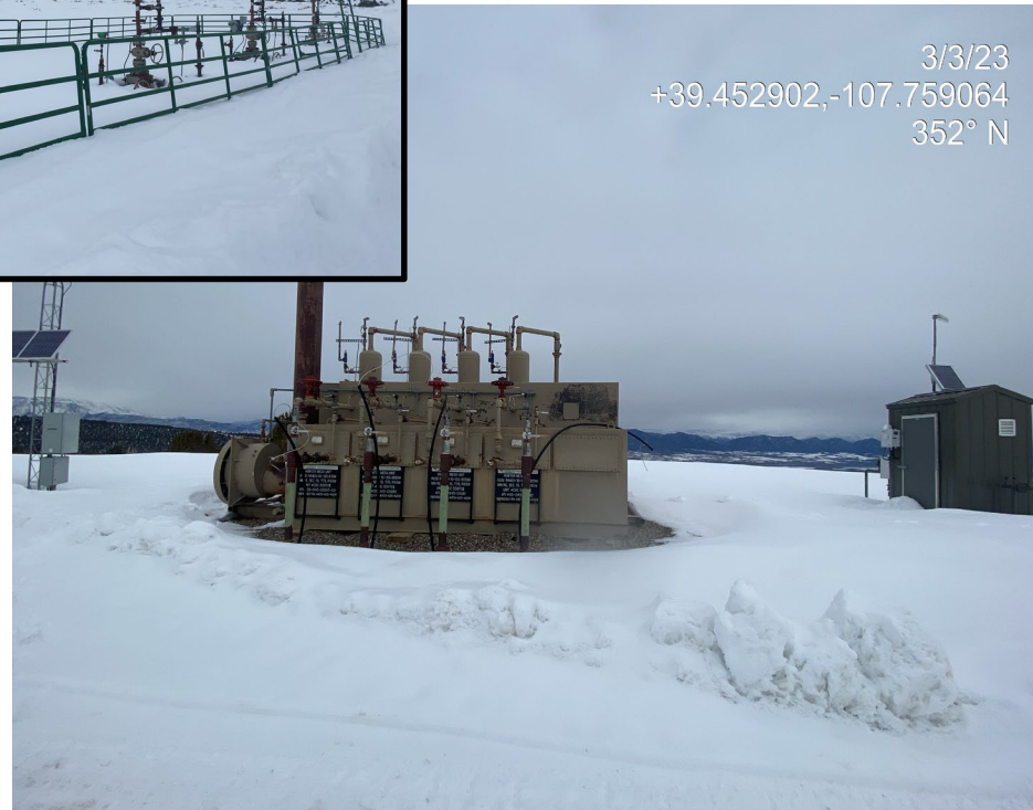
Photo 1. Photos show production areas.