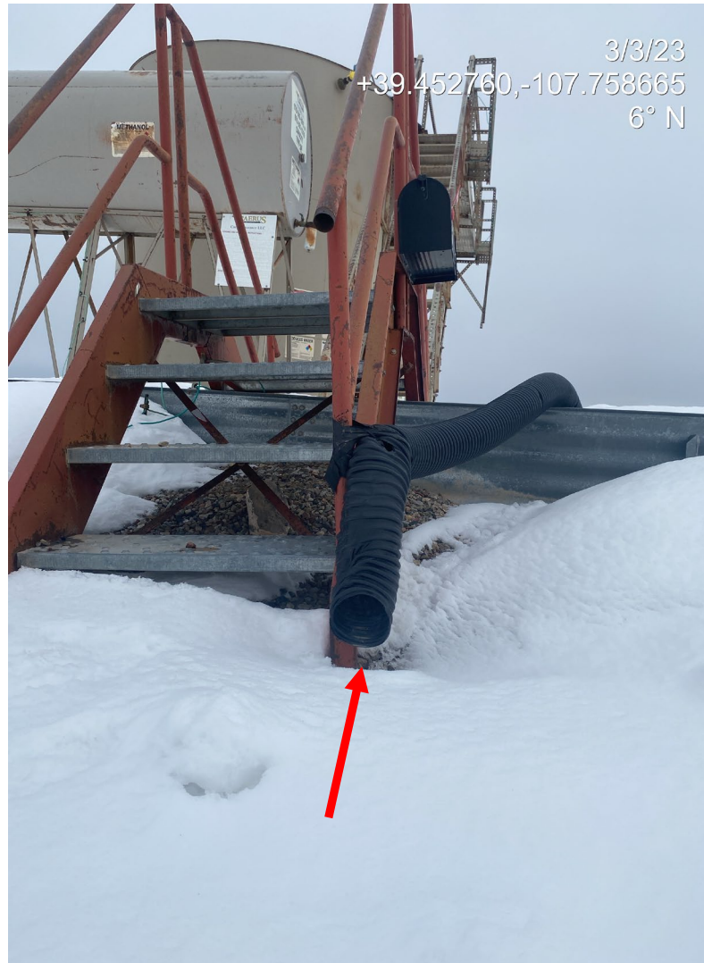
Photo 2. Photo shows wildlife protection BMPs to prevent entry into tank battery piping are absent.