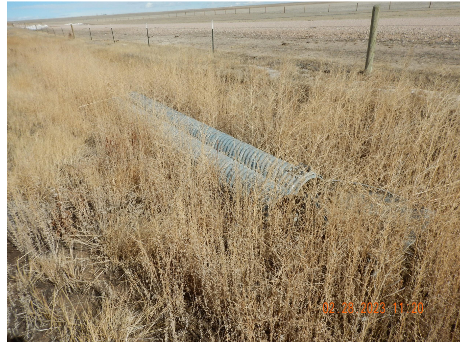
Photo 4. Photo taken from the eastern location, facing Northeast. Photo illustrates the weedy vegetation within the BMP area and unused equipment remains.