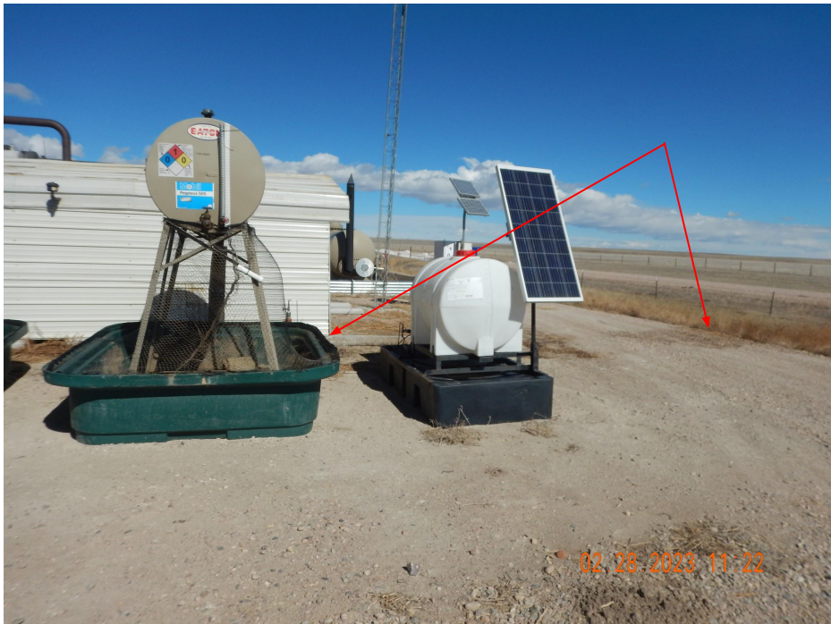
Photo 5. Photo taken from the eastern location, facing North. Photo illustrates a spill of what appears to be non-E&P exempt waste from a Mobil Pegasus SAE 40 container. This will need to be reported to CDPHE and this appears to be a violation of Rule 906. Note- it does not appear any action has been taken since the previous inspection.