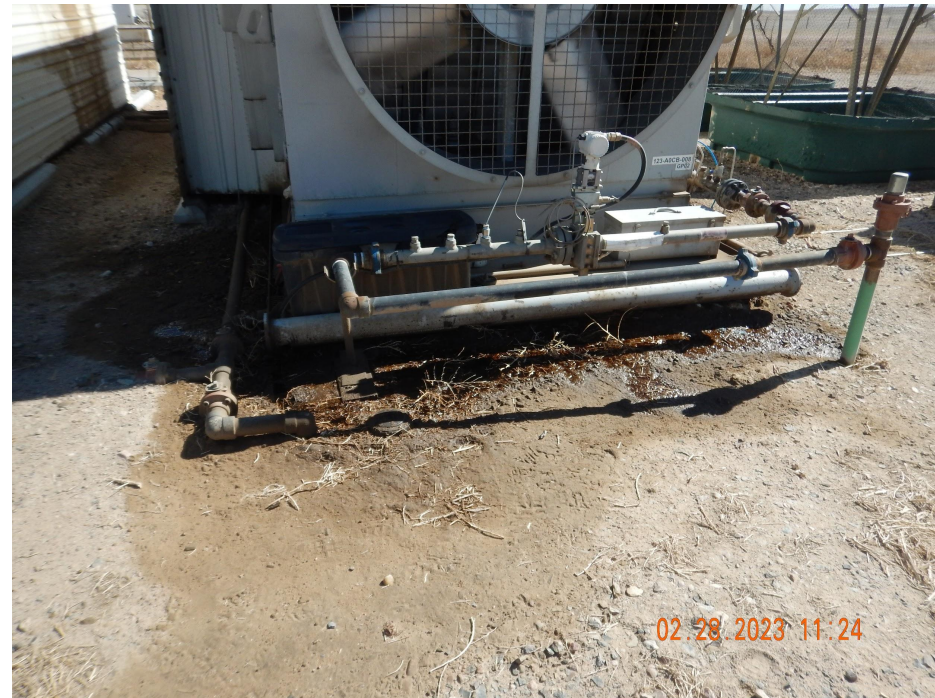
Photo 6. Photo taken from the eastern location, facing East. Photo illustrates stained soil/spill related to the compressor. Note- it does not appear any action has been taken since the previous inspection.