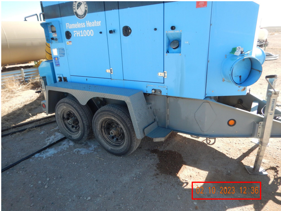
Photo 7. Photo taken from the eastern location on 2/10/2023. Photo illustrates poor housekeeping, as diesel fuel has spilled onto the ground. Note- Operator has not installed secondary containment for materials handling and spill prevention practices for this piece of equipment.