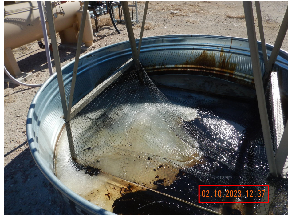
Photo 8. Photo taken from the eastern location on 2/10/2023. Photo illustrates netting is in disrepair. Remove and properly dispose fluids from within the secondary containment. Note- Operator has not addressed this corrective action.