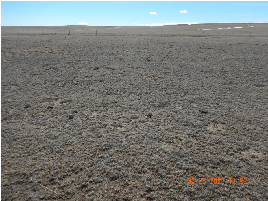
Photo 1. Photo taken from the southern location, facing South. Photo illustrates that it appears trash blown off location has been picked up.