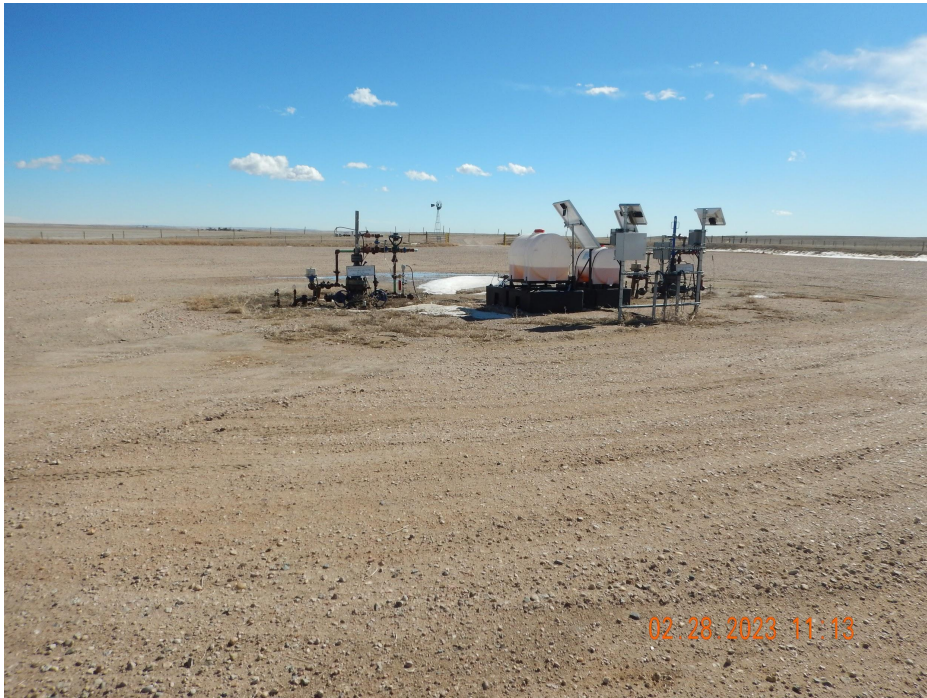
Photo 3. Photo taken from the wellheads, facing East. Photo illustrates unused has been removed.