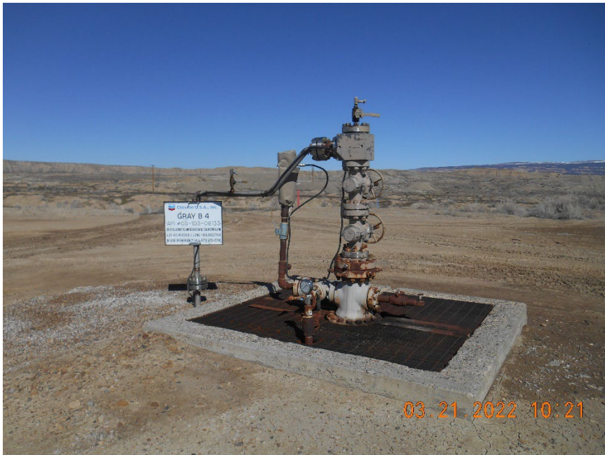
Injection wellhead No picture taken during MIT (oops)