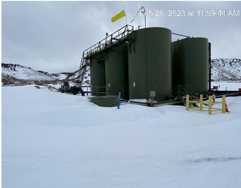
From entrance to location