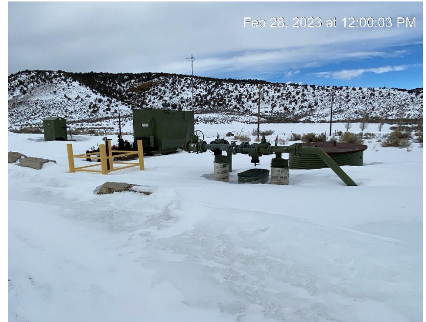
From entrance to location