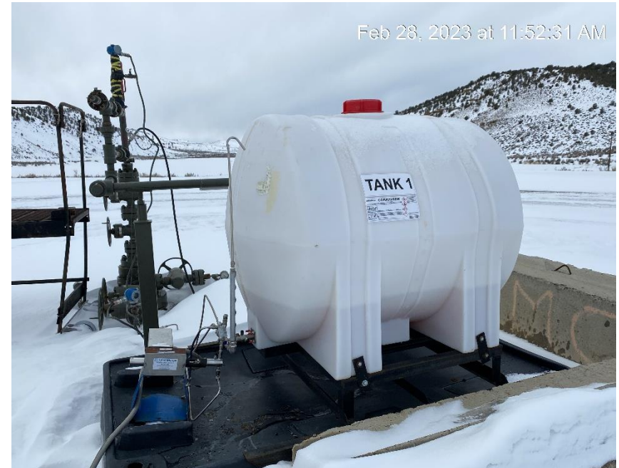
Chemical tank lacks proper labeling