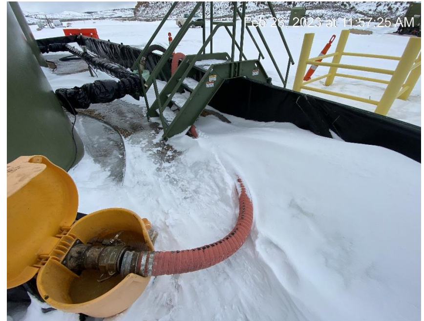
Hoses not in use.