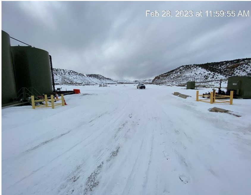
From entrance to location