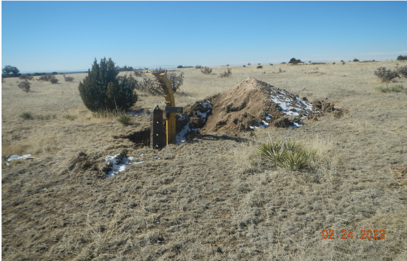
Photo 8. There was a hole dug out by the location to place the ripper. This has created unnecessary disturbance that will need to be reclaimed.