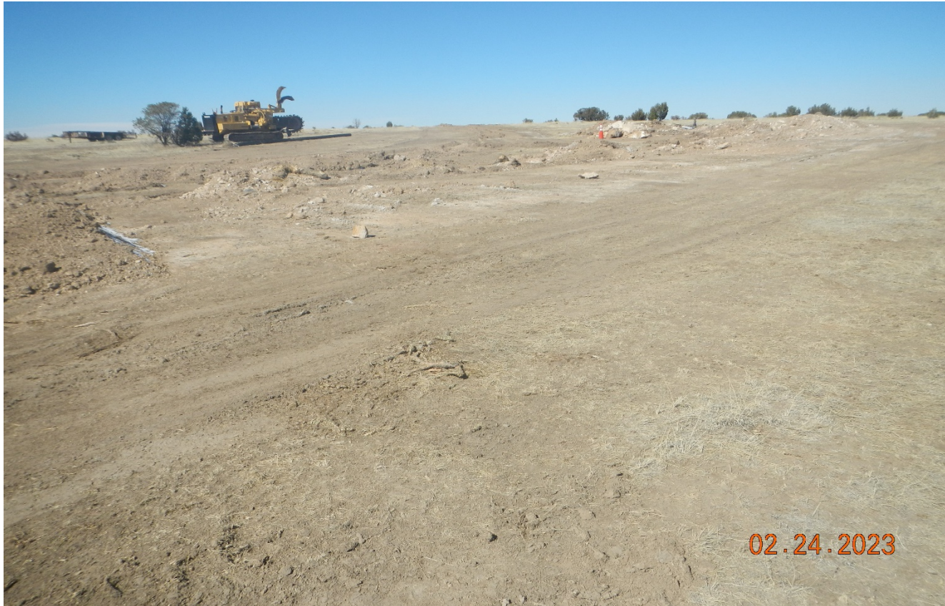
Photo 12. Facing northwest toward the wellsite. There is soil mixing throughout this area and soils are not salvage and protected from degradation and compaction.