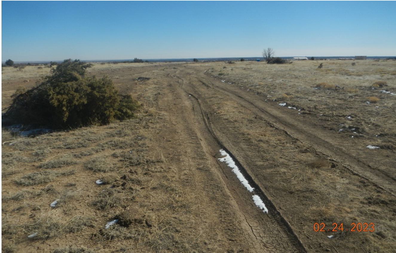
Photo 4. Facing southeast along the access road where flowline intersects the road to the processing plant and wellsite.