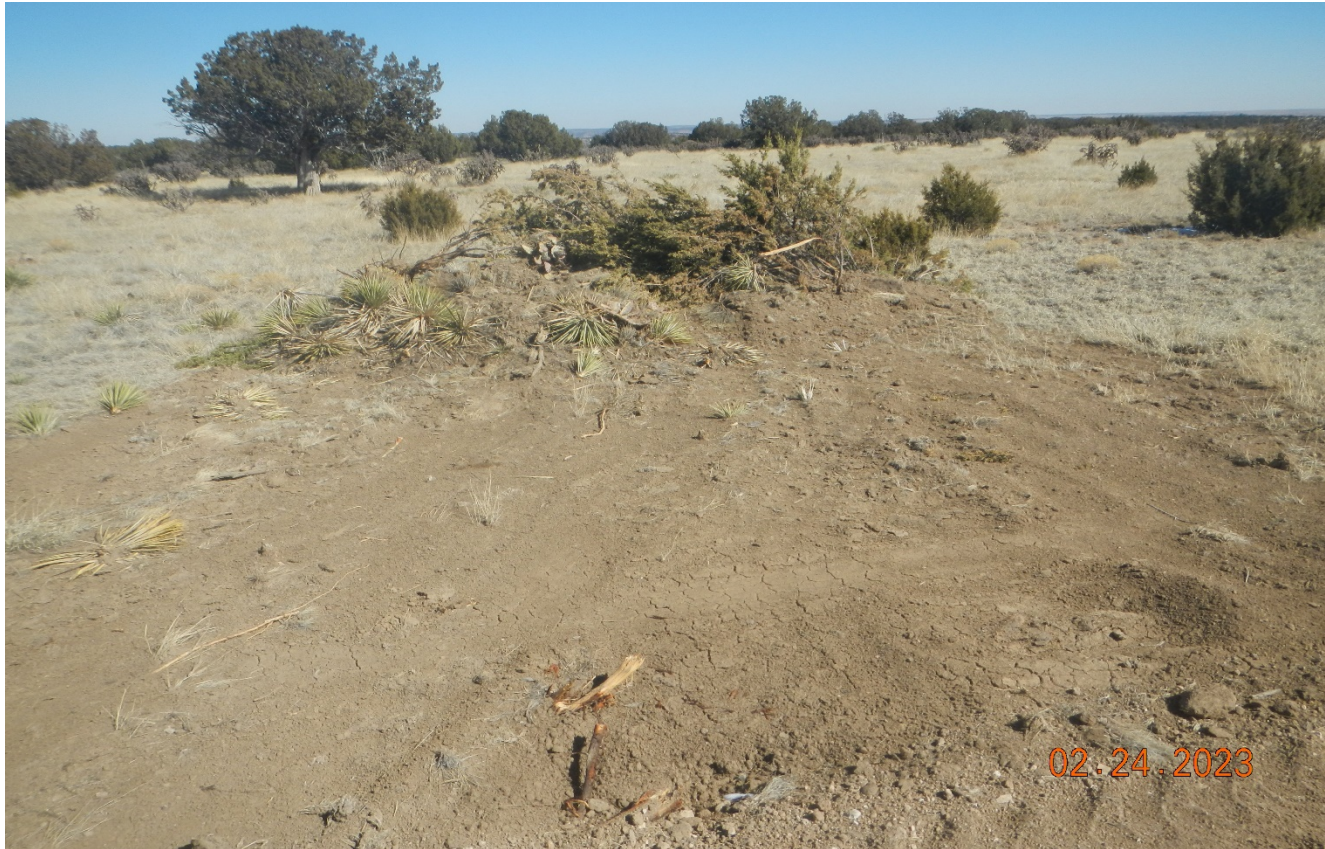
Photo 5. There are trees and soil pushed out along the area of trenching. All tree debris will need to be removed. Soil pushed out will need to be replaced.