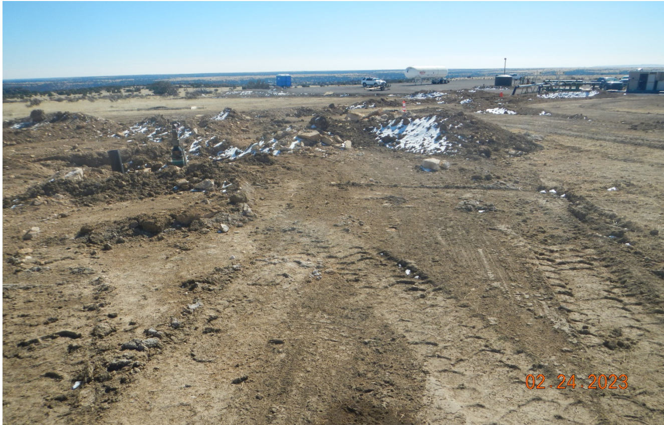
Photo 9. Facing southeast toward the wellsite. There is soil mixing throughout this area and soils are not salvage and protected from degradation and compaction.