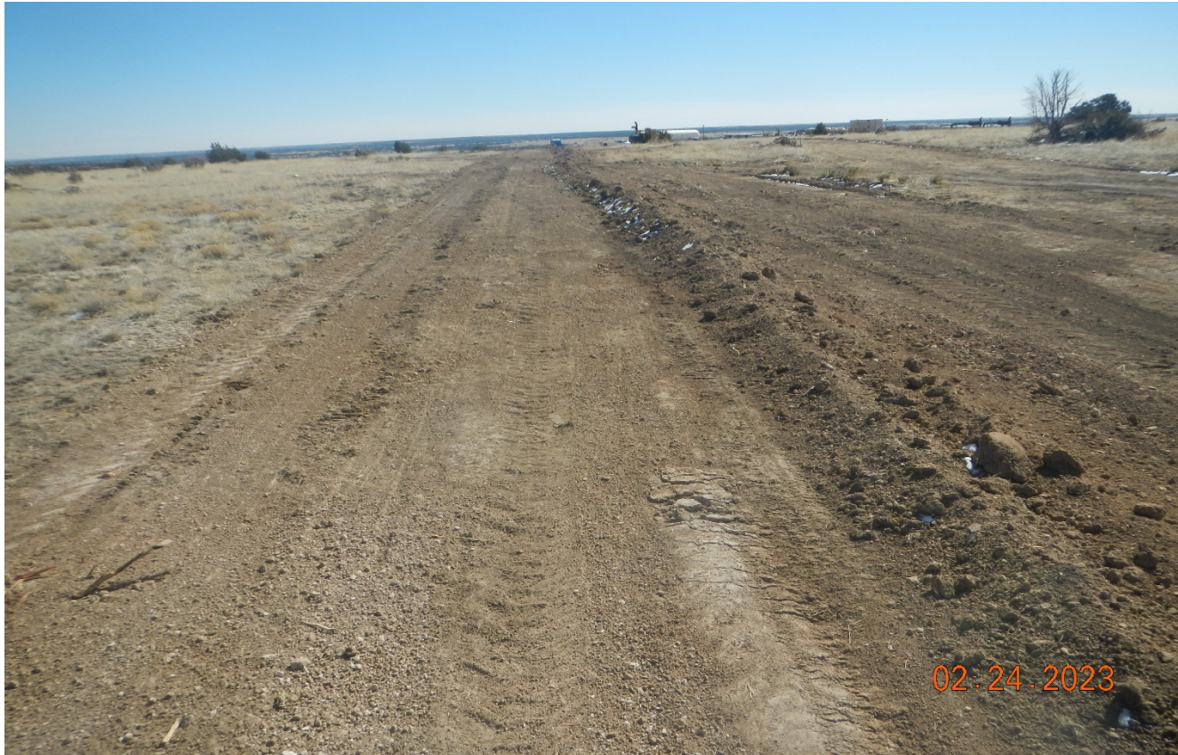
Photo 6. Facing southeast along the flowline disturbance.