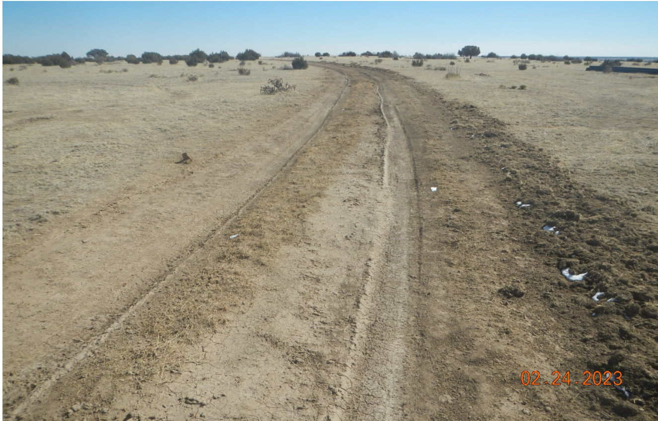
Photo 2. Facing southeast along the access road. The access road is not stabilized and soil is being pushed off the road. Soils should be segregated off the road before stabilizing the road with road base.