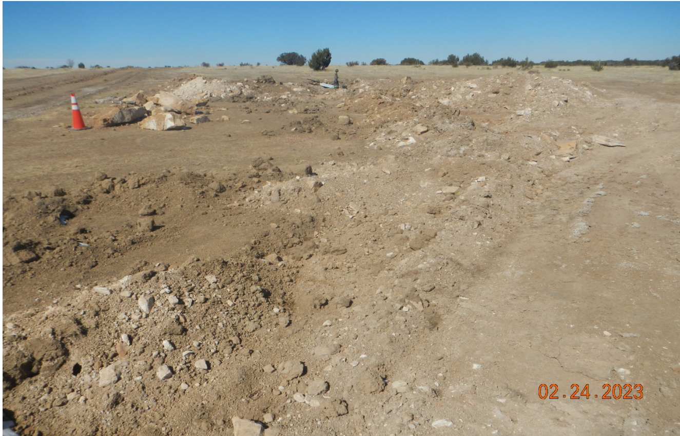
Photo 10. Facing northwest toward the wellsite. There is soil mixing throughout this area and soils are not salvage and protected from degradation and compaction.