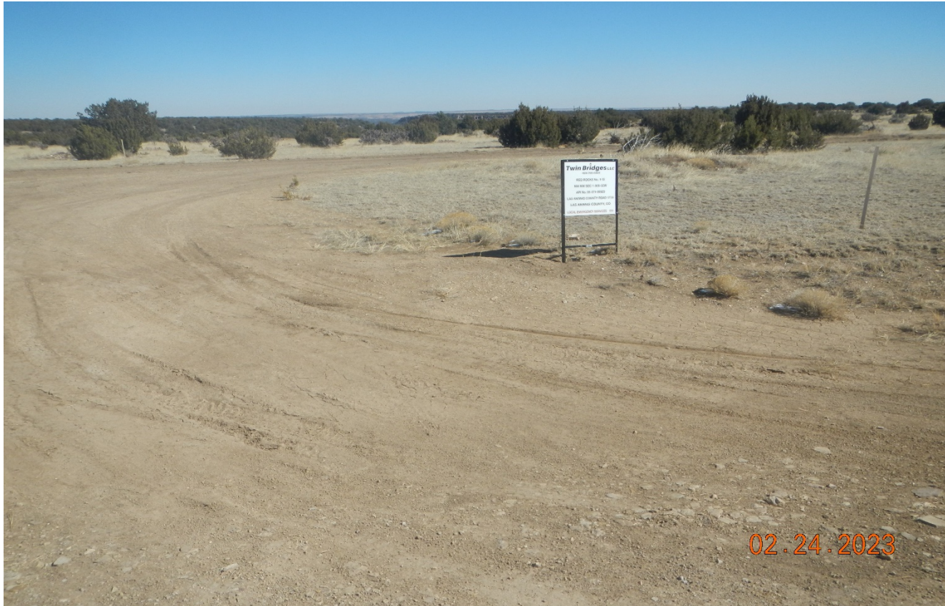
Photo 1. Facing southeast toward the access road. Sign posted at road does not reflect current operator.