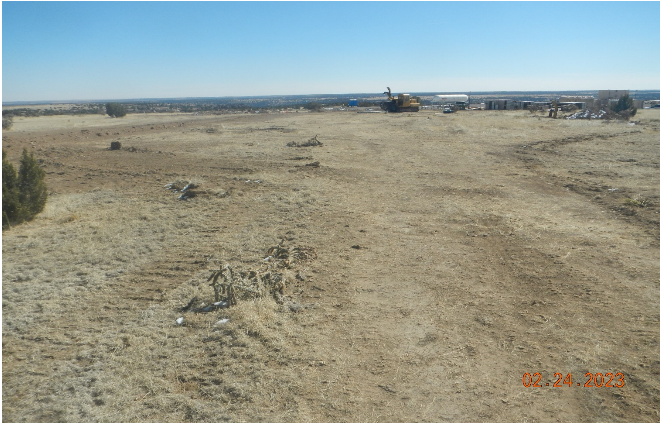
Photo 7. Facing southeast along the access road toward the location.