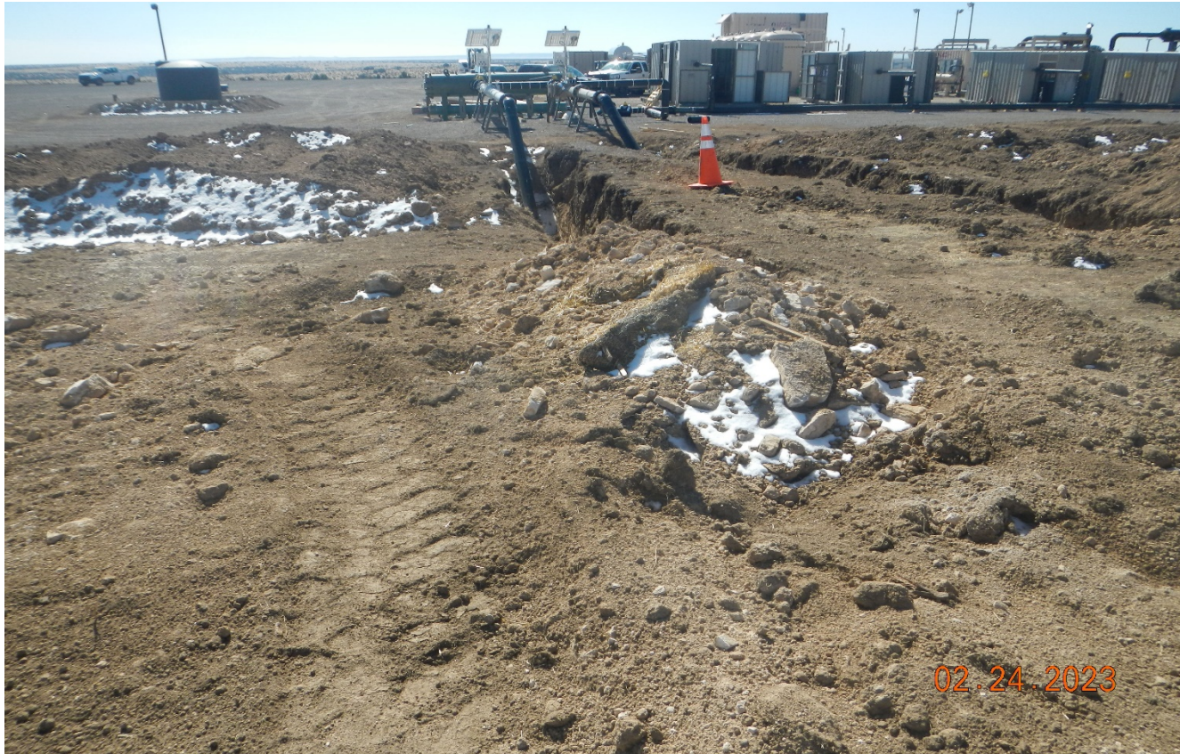
Photo 11. Facing south toward the processing plant adjacent to the wellsite. The two well site flowlines tie into the processing plant.