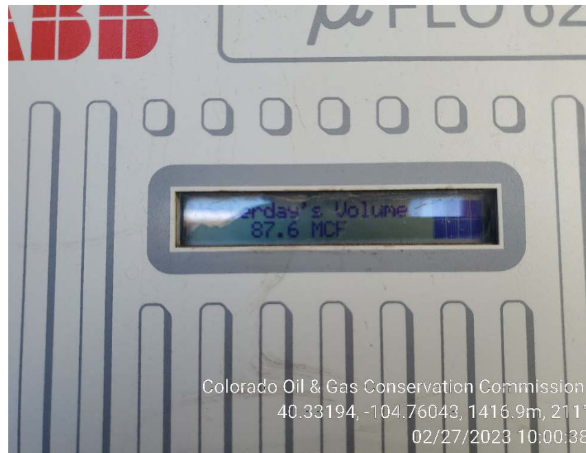
DCP gas sales meter station number

Colorado Oil & Gas Conservation Commission 40.33194, -104.76043, 1416.9m, 211° 02/27/2023 10:00:38